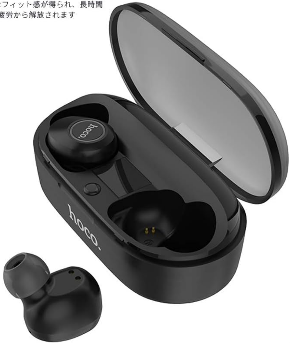
Image: The Hoco ES24 earphones resting inside their open charging case, showcasing their compact design.

人間工学に基づいたデザインにより、優れた快適性と常に信頼性の高い安全なフィット感が得られ、長時間の着用でも疲労から解放されます