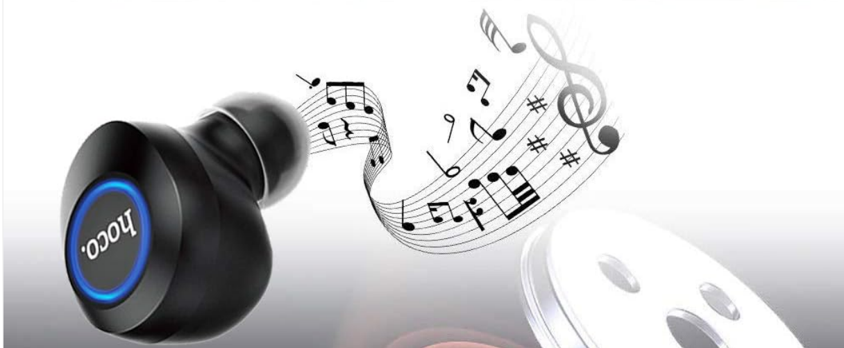
Image: A close-up of a Hoco ES24 earphone, with a smartphone screen in the background showing music playback, emphasizing HiFi sound quality and noise cancellation capabilities.