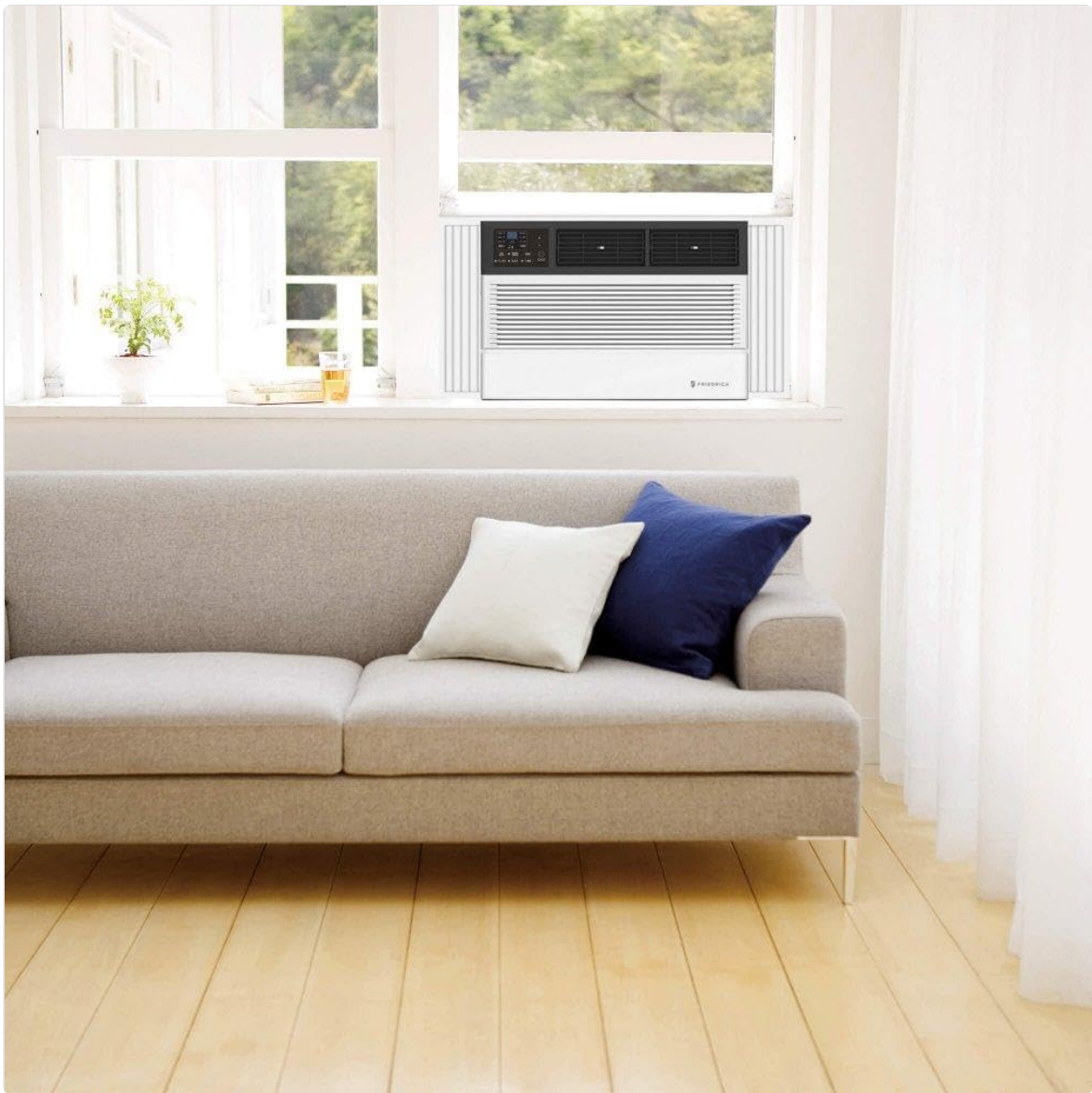
Image: Friedrich CCF05A10A Air Conditioner installed in a window, showing the side panels extended to fill the gap.