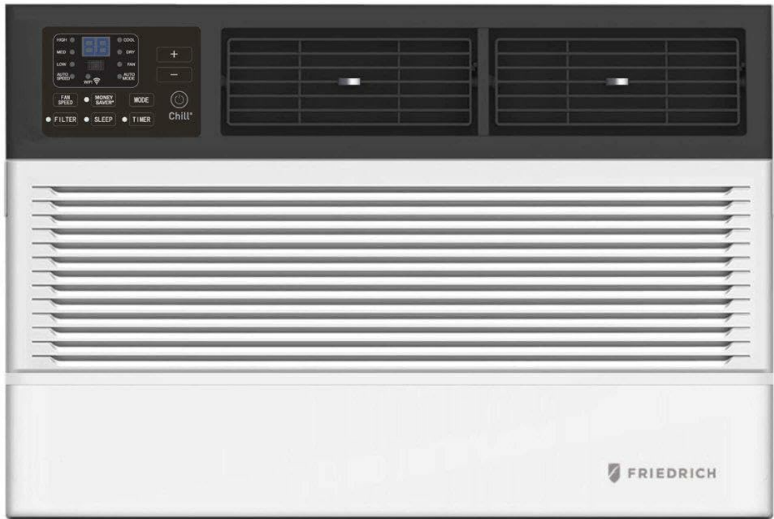
Image: Front view of the Friedrich CCF05A10A Air Conditioner.