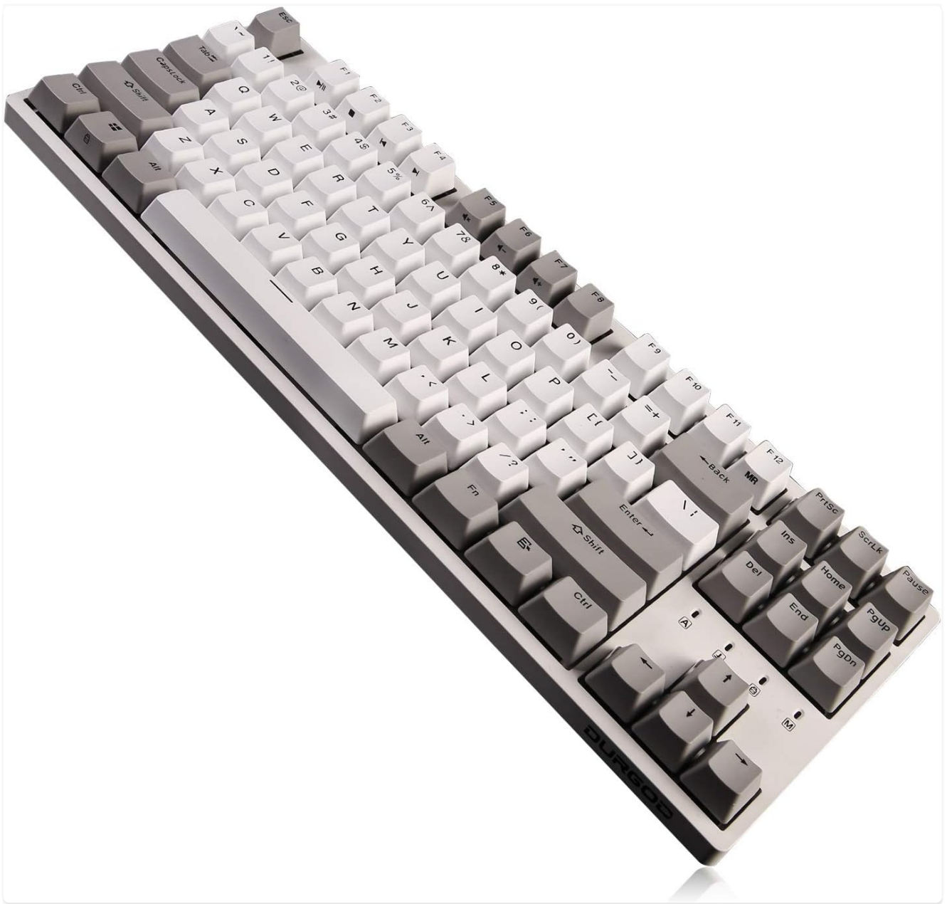
Image: The DURGOD Taurus K320 TKL Mechanical Gaming Keyboard, showcasing its compact tenkeyless design with white and grey keycaps.