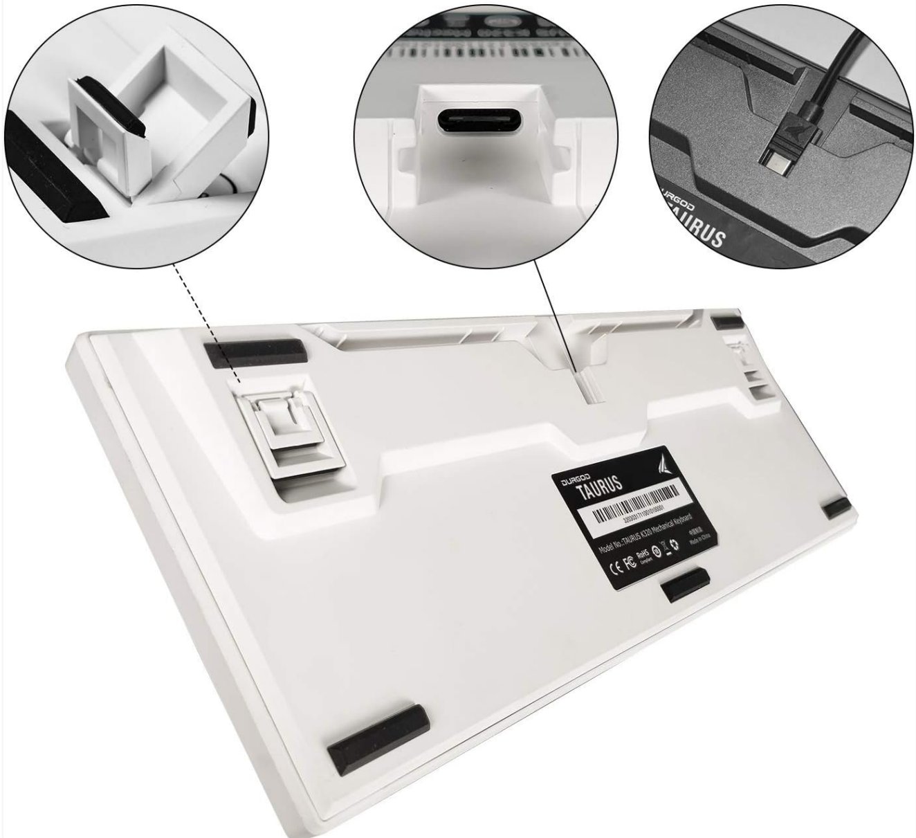
Image: The underside of the DURGOD K320 keyboard, highlighting the adjustable feet and the central Type-C interface for cable connection.