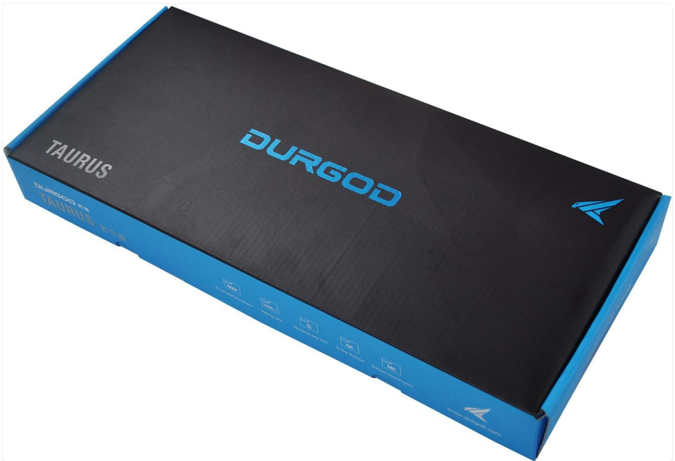
Image: The retail packaging box for the DURGOD Taurus K320 keyboard, indicating the product inside.