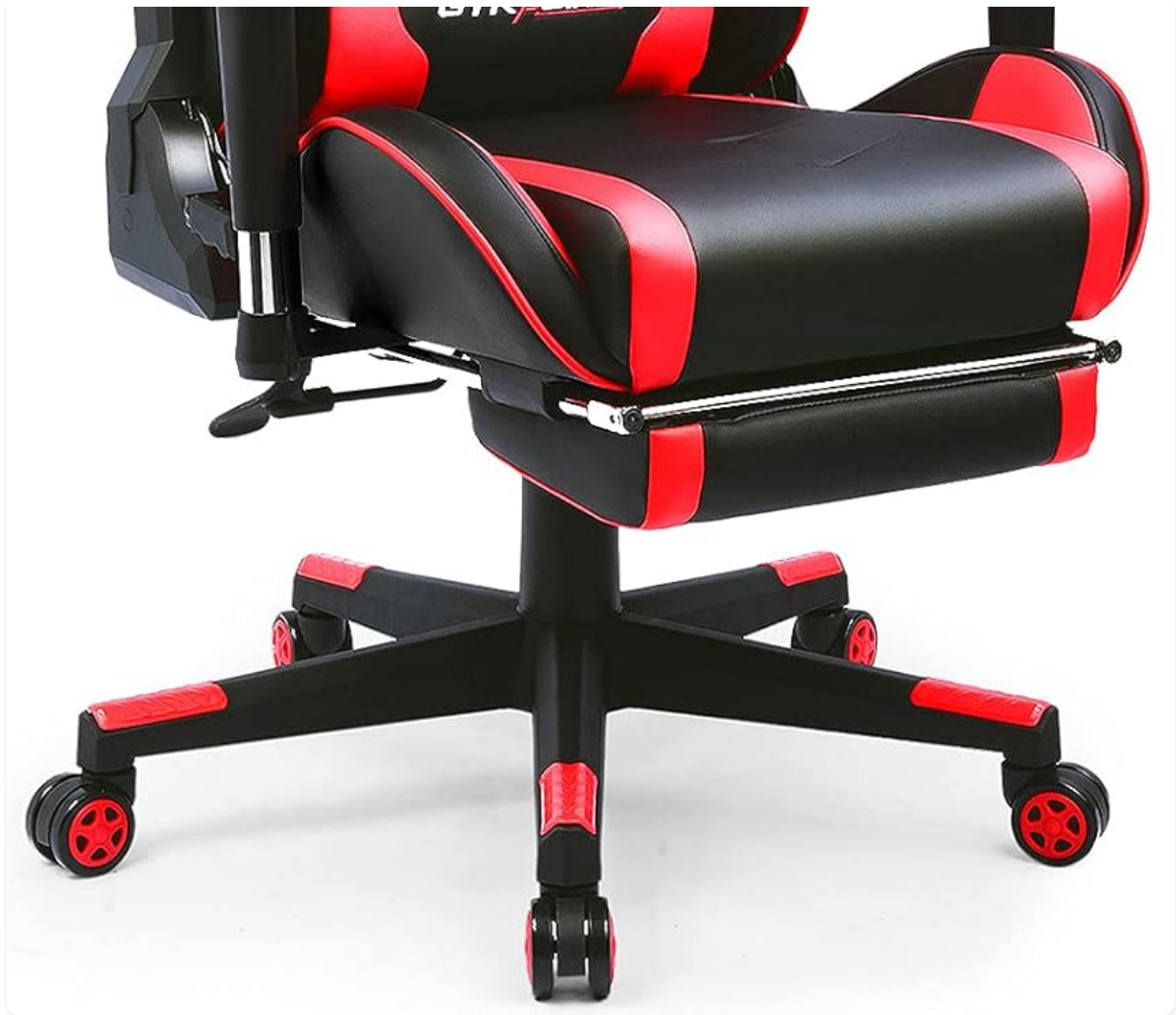
This image displays the GTRACING Gaming Chair in red and black, highlighting its ergonomic shape and integrated features.