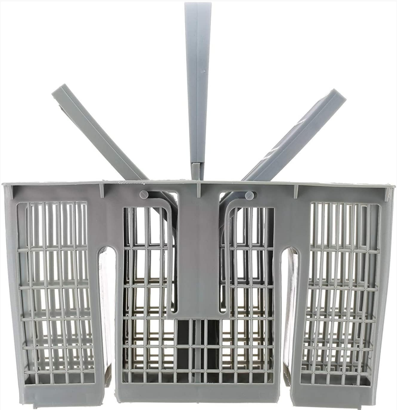
Figure 8.1: Diagram illustrating the dimensions of the cutlery basket: approximately 21 cm length, 16 cm width, and 22.5 cm height including the handle.