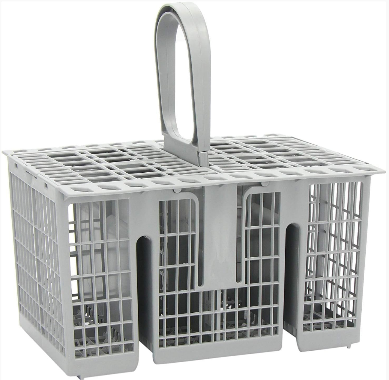
Figure 2.1: Front view of the Find A Spare C00257140 Cutlery Cage Dishwasher Basket. This image shows the grey plastic basket with its integrated handle and multiple compartments for cutlery.