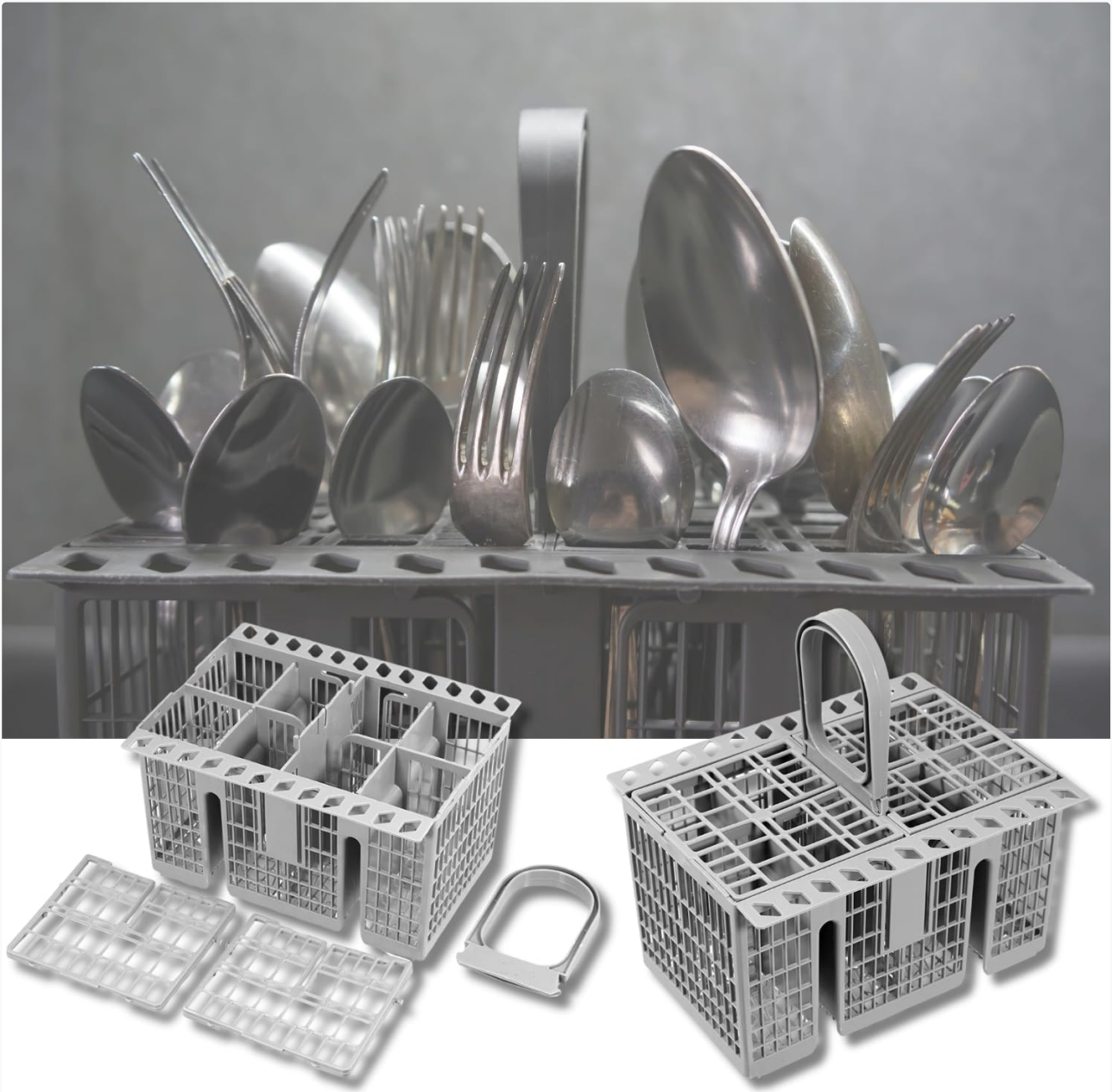
Figure 2.2: The cutlery basket shown with various pieces of cutlery inside, alongside an exploded view of the basket showing its detachable handle and lid components.