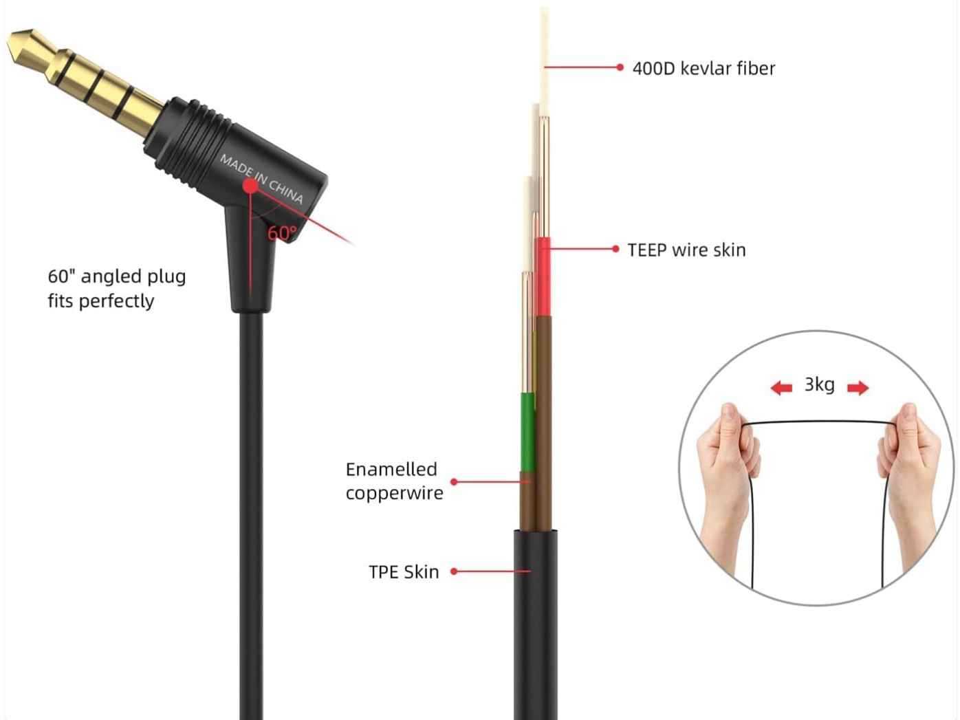
Image: Cross-section of the silver-plated copper cable and the design of the 60-degree angled 3.5mm jack.

Less radio interference, better audio performance