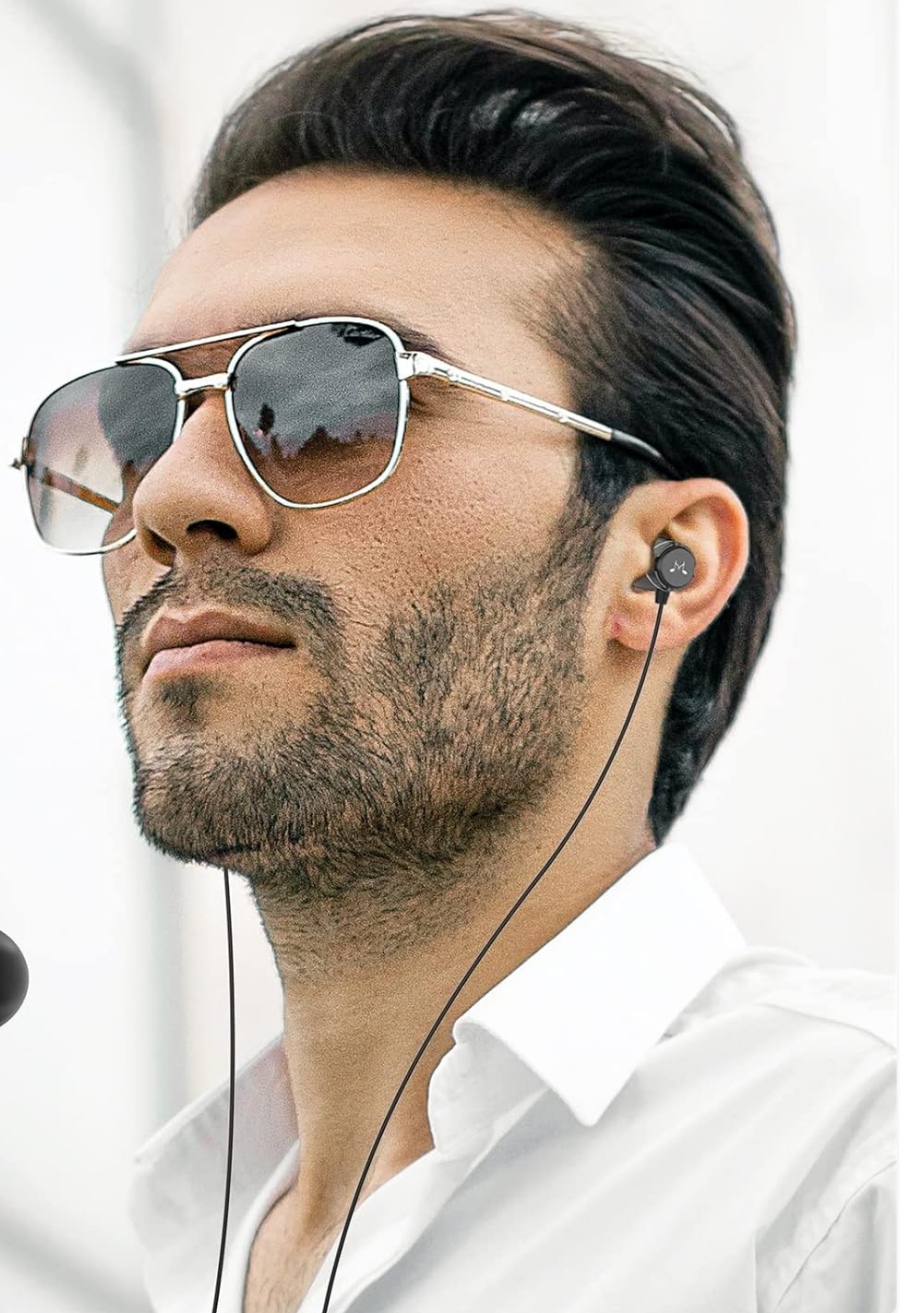
Image: Proper insertion and comfortable fit of the SoundMAGIC E11 earbuds in the ear.