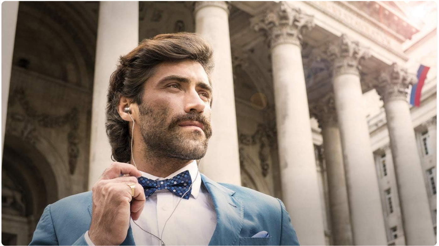
Image: A user enjoying audio with the SoundMAGIC E11 earbuds, highlighting their discreet and comfortable design.