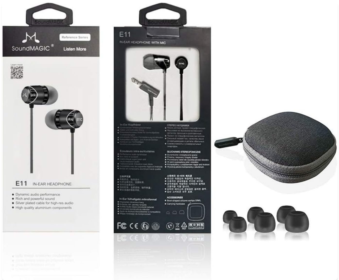
Image: Contents of the SoundMAGIC E11 package, including the earbuds, a carrying case, and different sizes of ear tips.