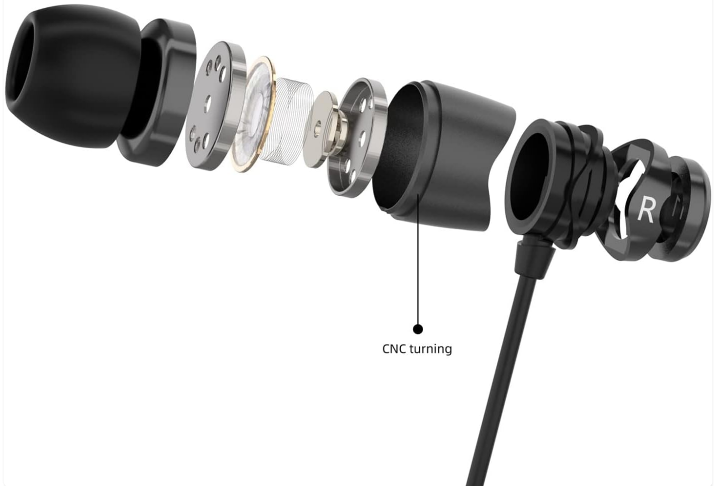
Image: Detailed view of the E11's elegant aluminum housing and internal structure, highlighting its durable construction.

Crafted from aluminium in a high-precision cutting process and finished with a unique hand painting process