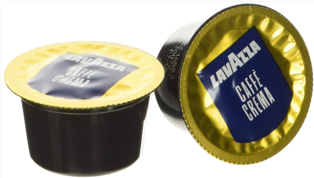
Figure 2.2: Two Lavazza Blue Caffe Crema coffee capsules, one upright and one on its side, showcasing the design and packaging.

These capsules are specifically designed for use with Lavazza Blue coffee machines, including the Classy Plus and Classy Mini models. They are not compatible with other coffee systems.