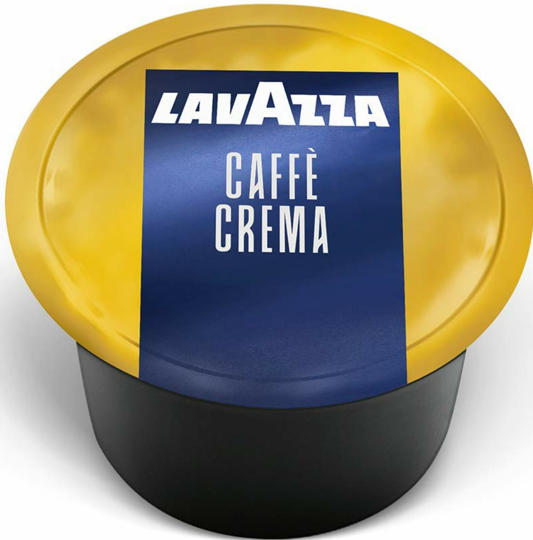
Figure 2.1: A single Lavazza Blue Caffè Crema coffee capsule, featuring the Lavazza logo and "Caffè Crema" text on a blue label, set against a yellow top and black base.