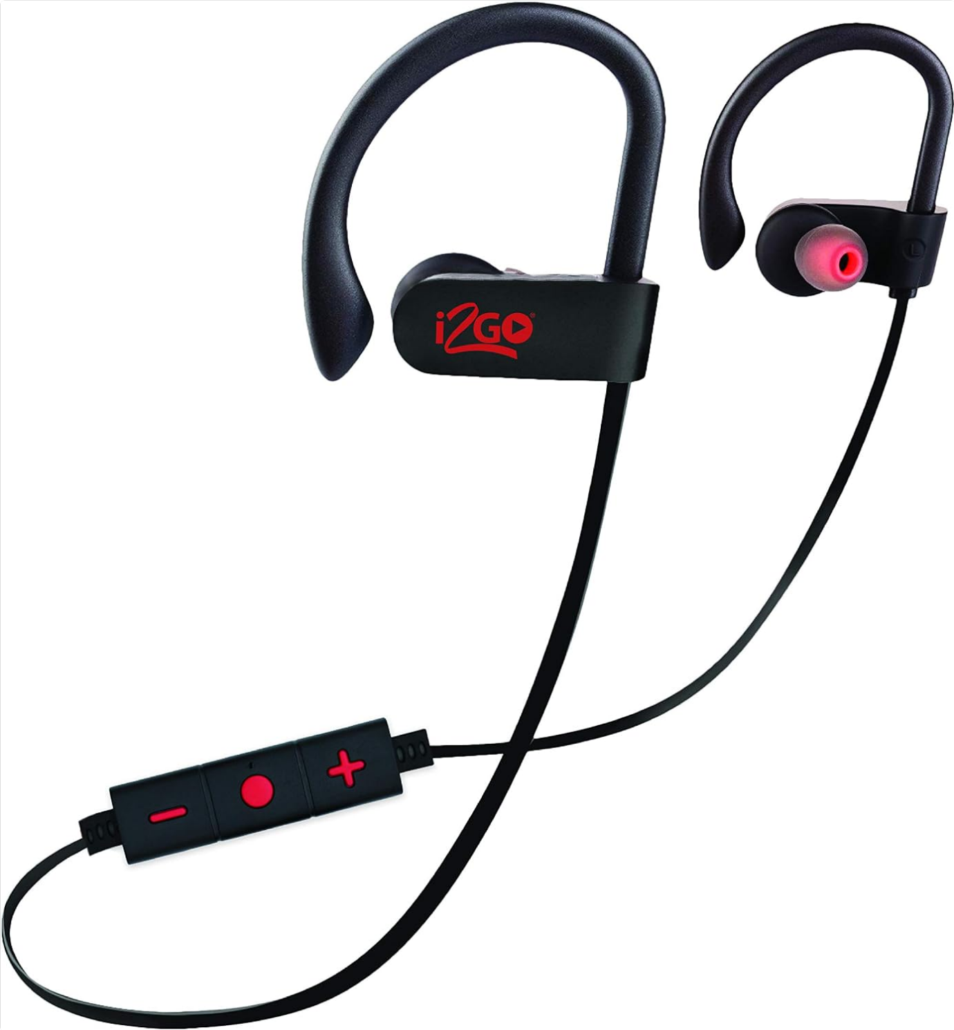
Figure 2: Angled view of the earphones, highlighting the flexible ear hooks designed for a secure fit during physical activity.