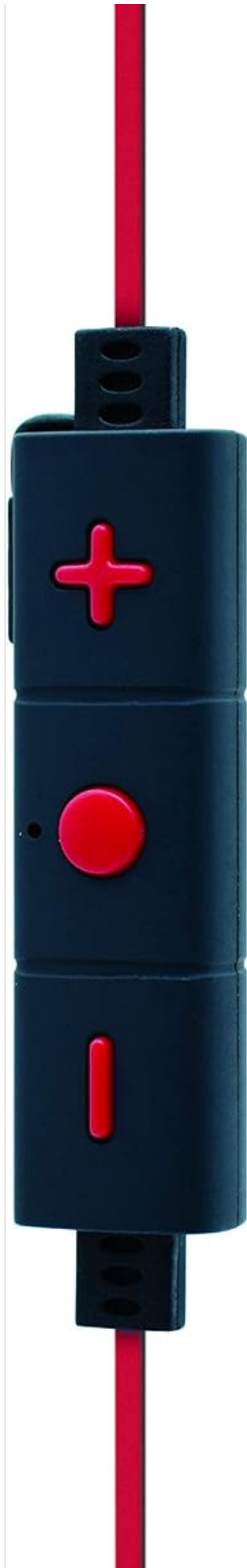
Figure 3: Close-up of the rubberized inline control panel, featuring volume up (+), multi-function button (center), and volume down (-) buttons.