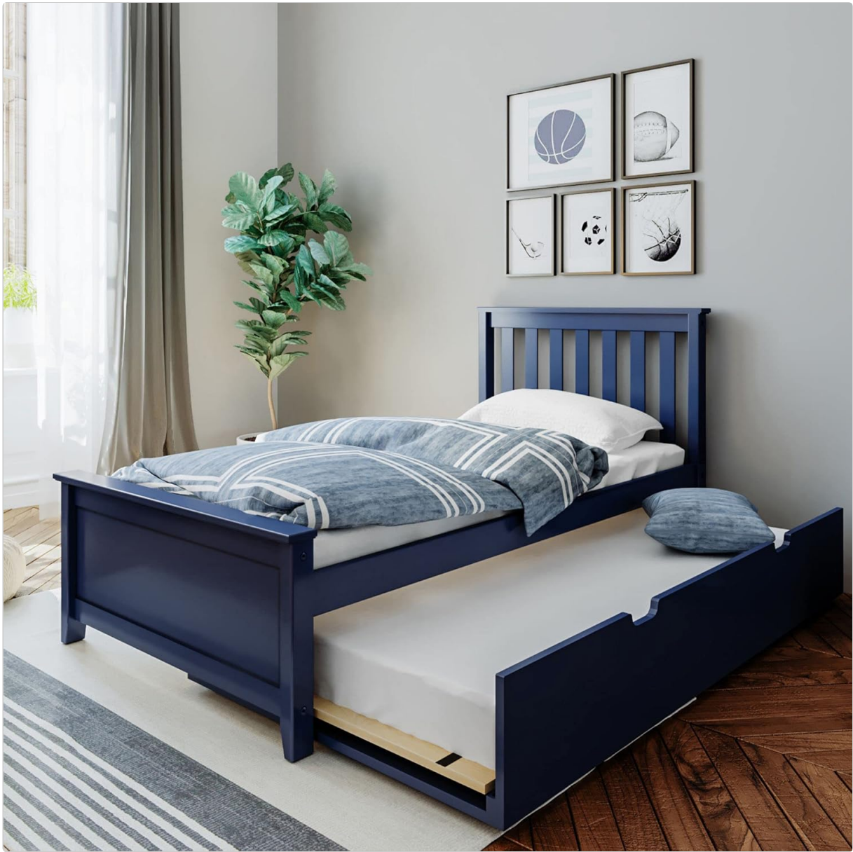
Image: Fully assembled Max & Lily Twin Bed with Trundle, showcasing its design and functionality.