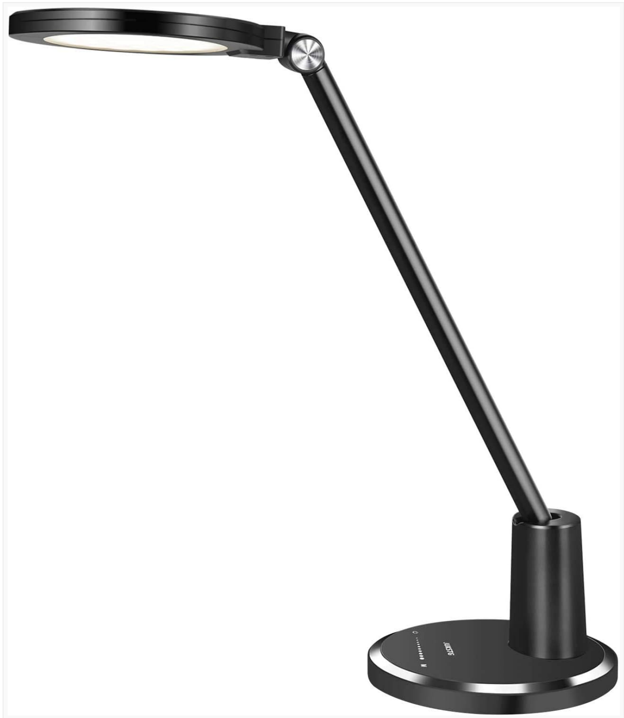
Figure 1: JUKSTG LED Desk Lamp (Overall View)

Familiarize yourself with the components and control panel of your JUKSTG desk lamp.