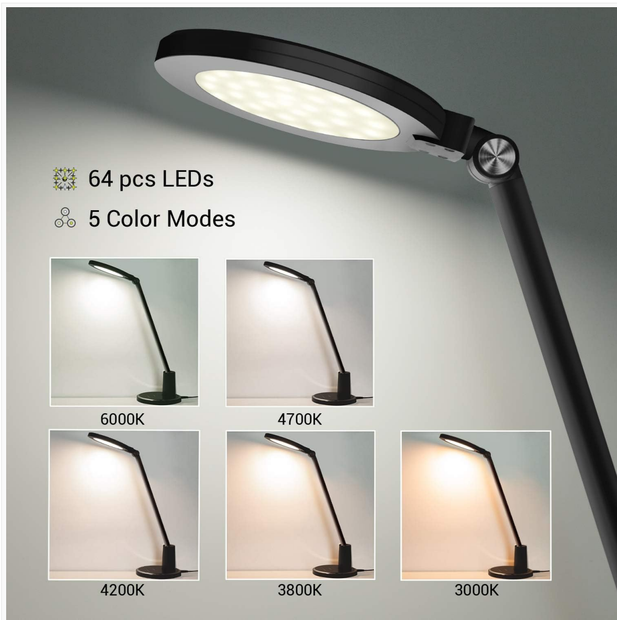
Figure 4: 5 Color Temperature Modes