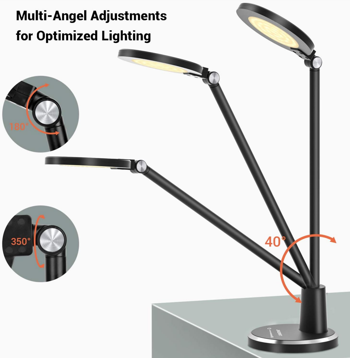
Figure 5: Multi-Angle Adjustments