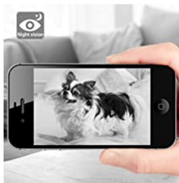
Image: A smartphone screen displaying the night vision capability of the feeder's camera, showing a clear image of a dog in low light conditions.