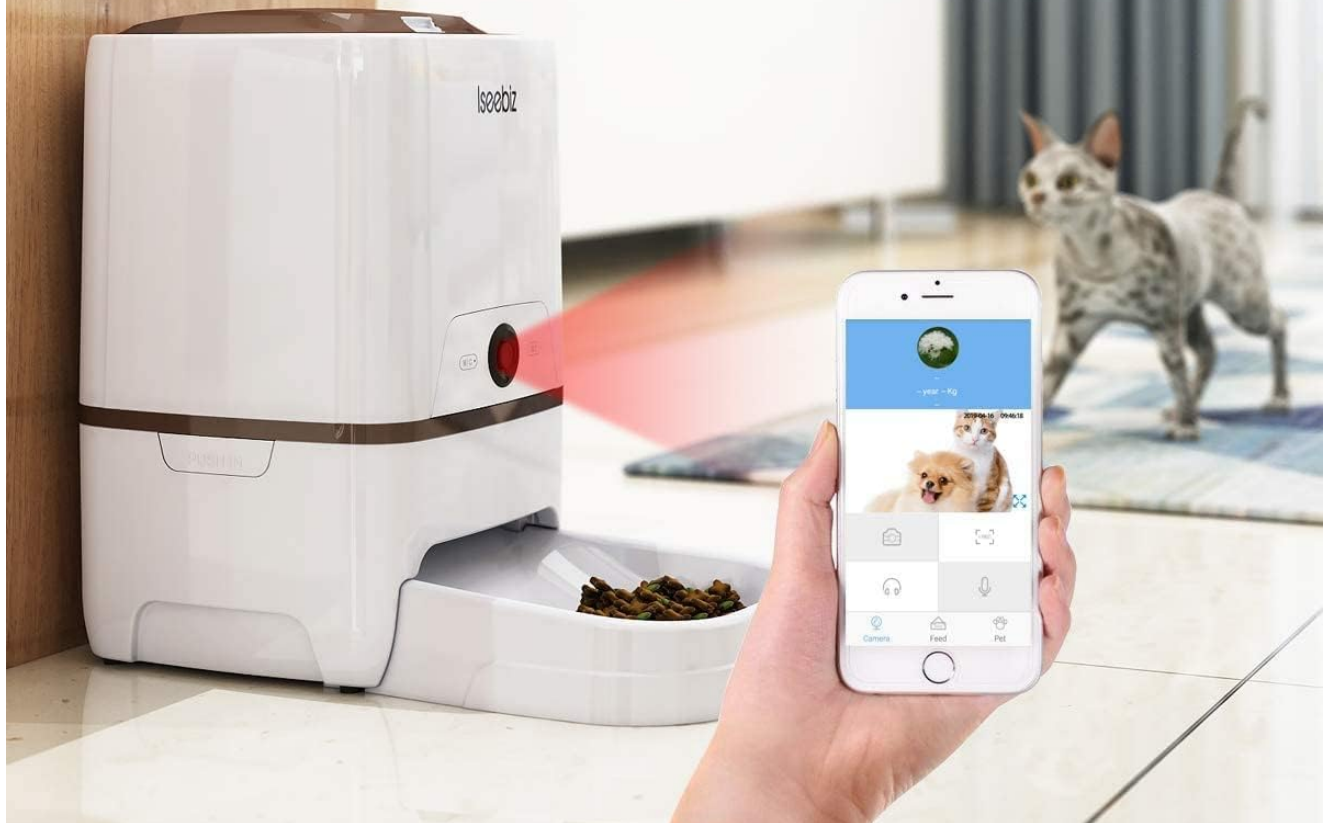
Image: The Iseebiz Automatic Pet Feeder with an accompanying smartphone displaying the app's interface for remote control and two-way audio communication with your pet.