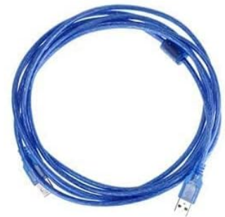
USB charging cable

Image: The Iseebiz Automatic Pet Feeder with a speech bubble indicating "LUNCH TIME", illustrating the voice recording feature to call pets for meals.