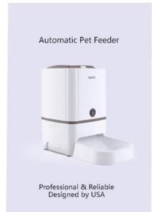
English user manual