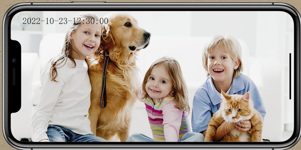
Image: An interactive pet feeder setup, emphasizing real-time video monitoring, voice interaction, and the ability to capture special moments with your pets.