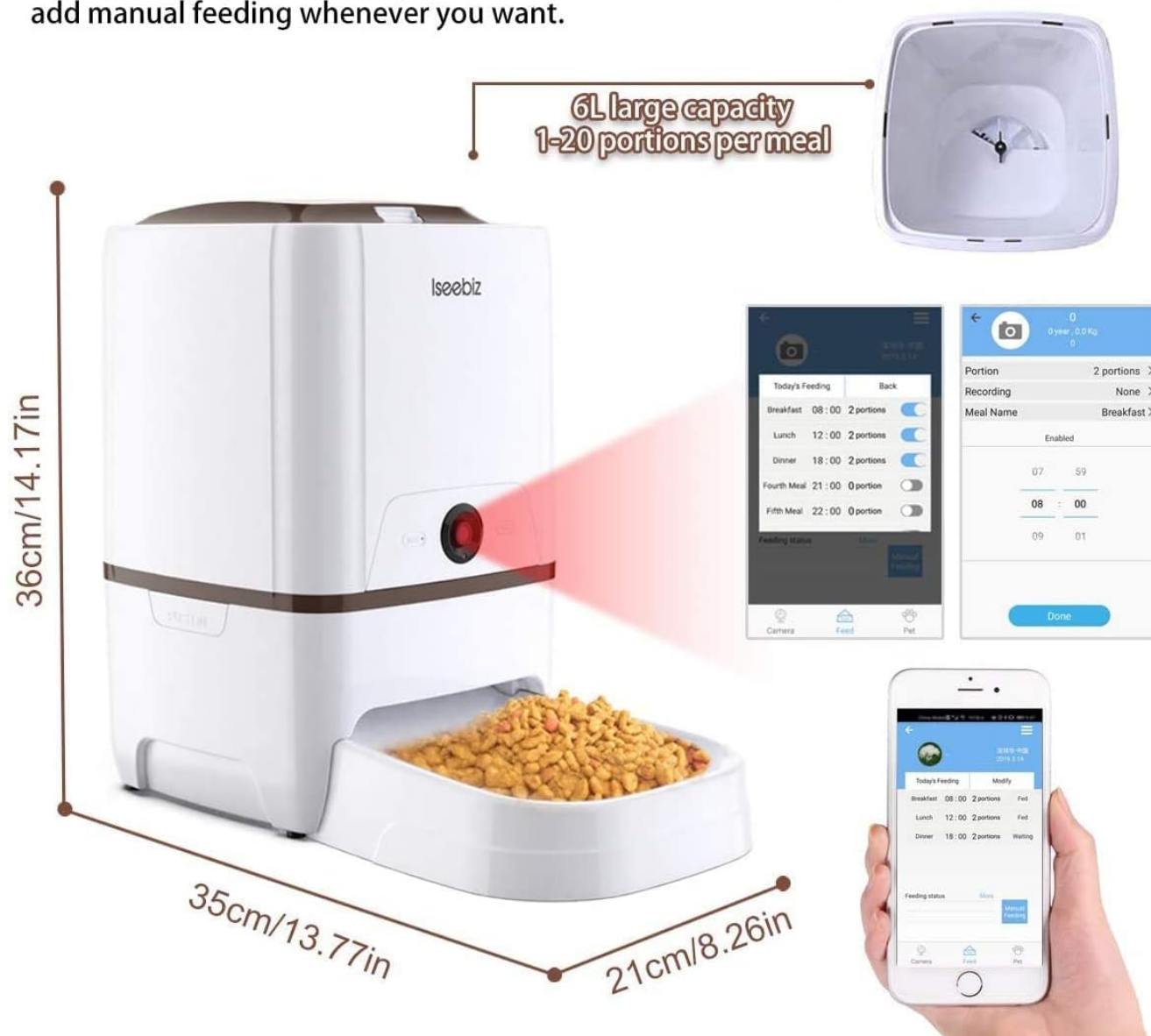
Image: The Iseebiz Automatic Pet Feeder with an overlay demonstrating the app's interface for setting up to 6 feeding times and customizing portion sizes.

Up to 6 feeding times per day to set in the APP, you could use your phone to add manual feeding whenever you want.