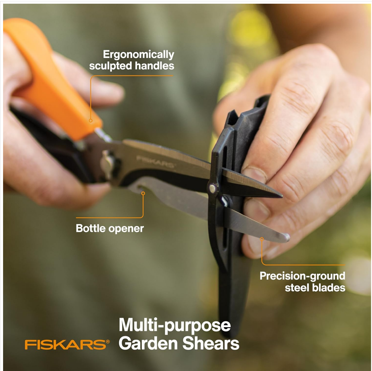
Image 1: Overview of the Fiskars 7-in-1 Garden Shears with key features highlighted.

Your browser does not support the video tag.