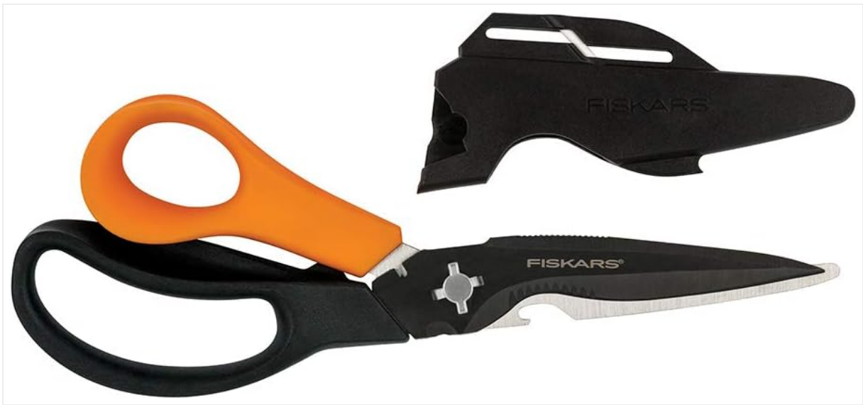
Image 2: The Fiskars 7-in-1 Garden Shears in their standard configuration.