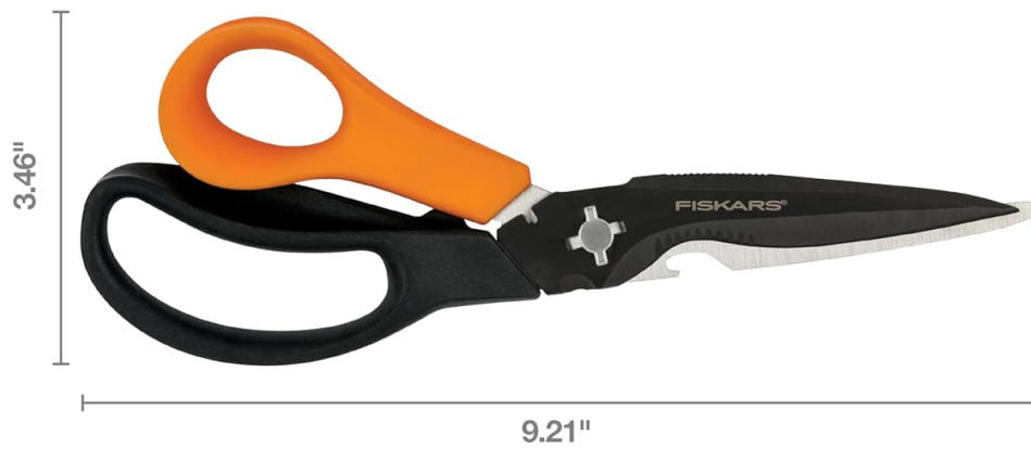
Image 10: Product dimensions for the Fiskars 7-in-1 Garden Shears.