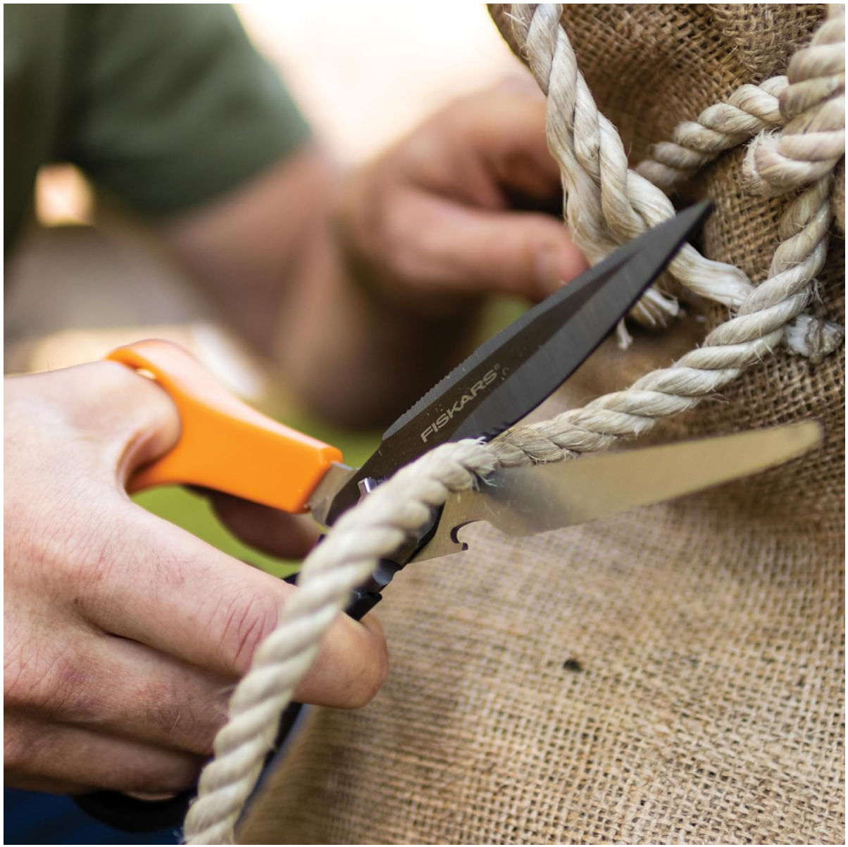
Image 8: Cutting a rope using the power notch for increased leverage.