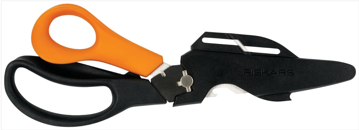
Image 9: The sheath with its integrated sharpener, designed for convenient blade maintenance.

Your browser does not support the video tag.