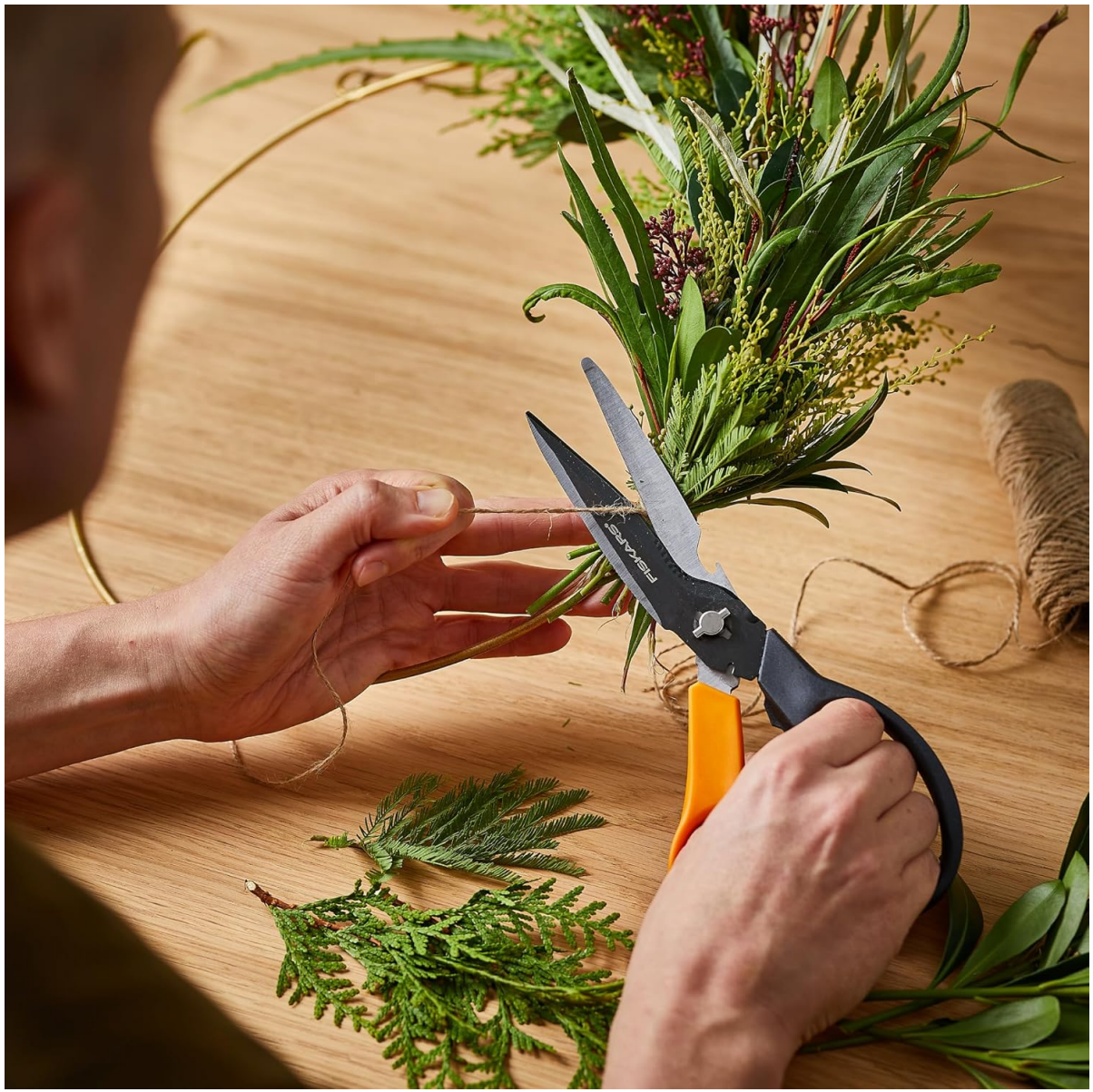
Image 6: The shears being used to cut twine, a common gardening task.