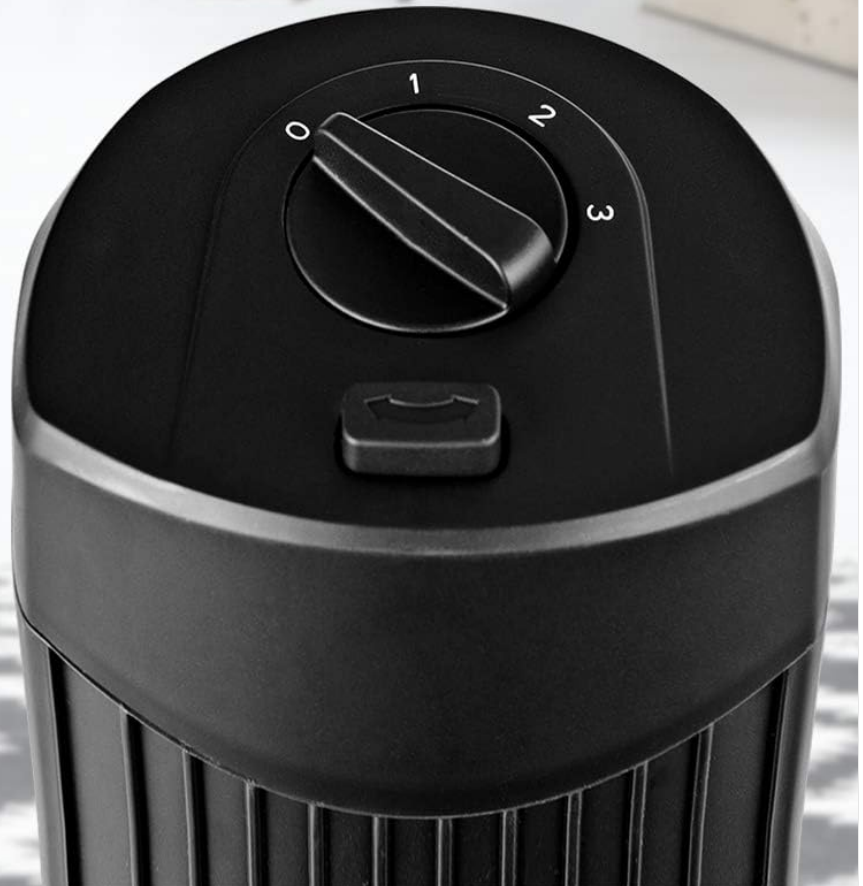
Figure 5: Wind Speed Modes. This graphic explains the three fan speeds: Low (Soft Wind), Mid (Refreshing Wind), and High (Strong Winds).