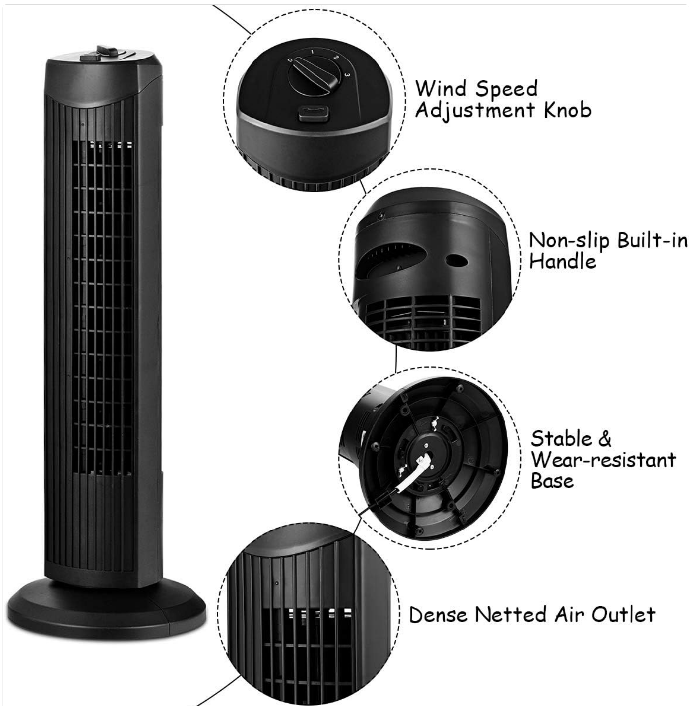
Figure 4: Fan Components. This diagram highlights the Wind Speed Adjustment Knob, Non-slip Built-in Handle, Stable & Wear-resistant Base, and Dense Netted Air Outlet.