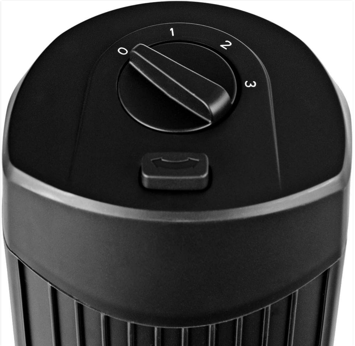
Figure 3: Control Panel. This image shows the top of the fan with the rotary knob for speed selection and the push button for oscillation control.