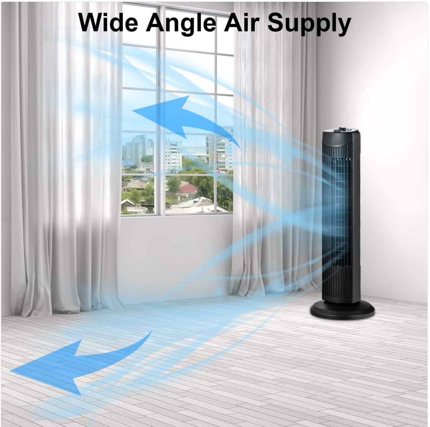
Figure 6: Wide Angle Air Supply. This image demonstrates the fan's oscillation feature, showing how it distributes air across a broad area in a room.