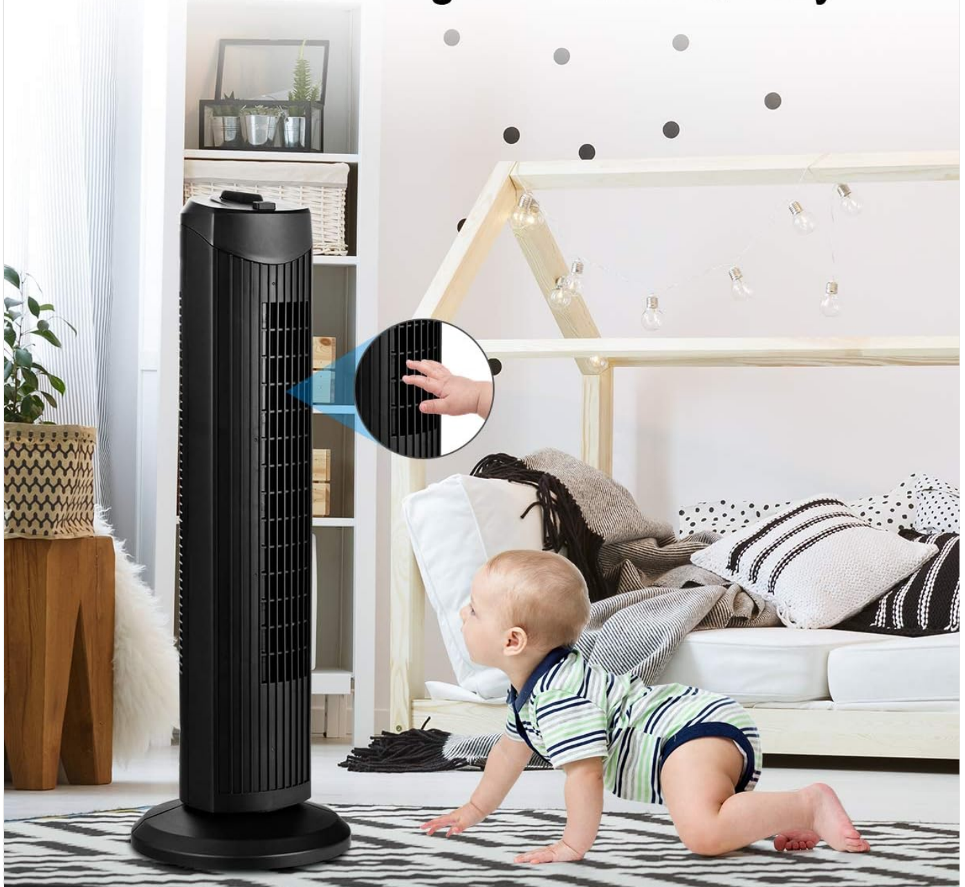
Figure 1: Bladeless Design for Safety. This image illustrates the fan's bladeless design and dense netted air outlet, emphasizing its safety features, especially around children.