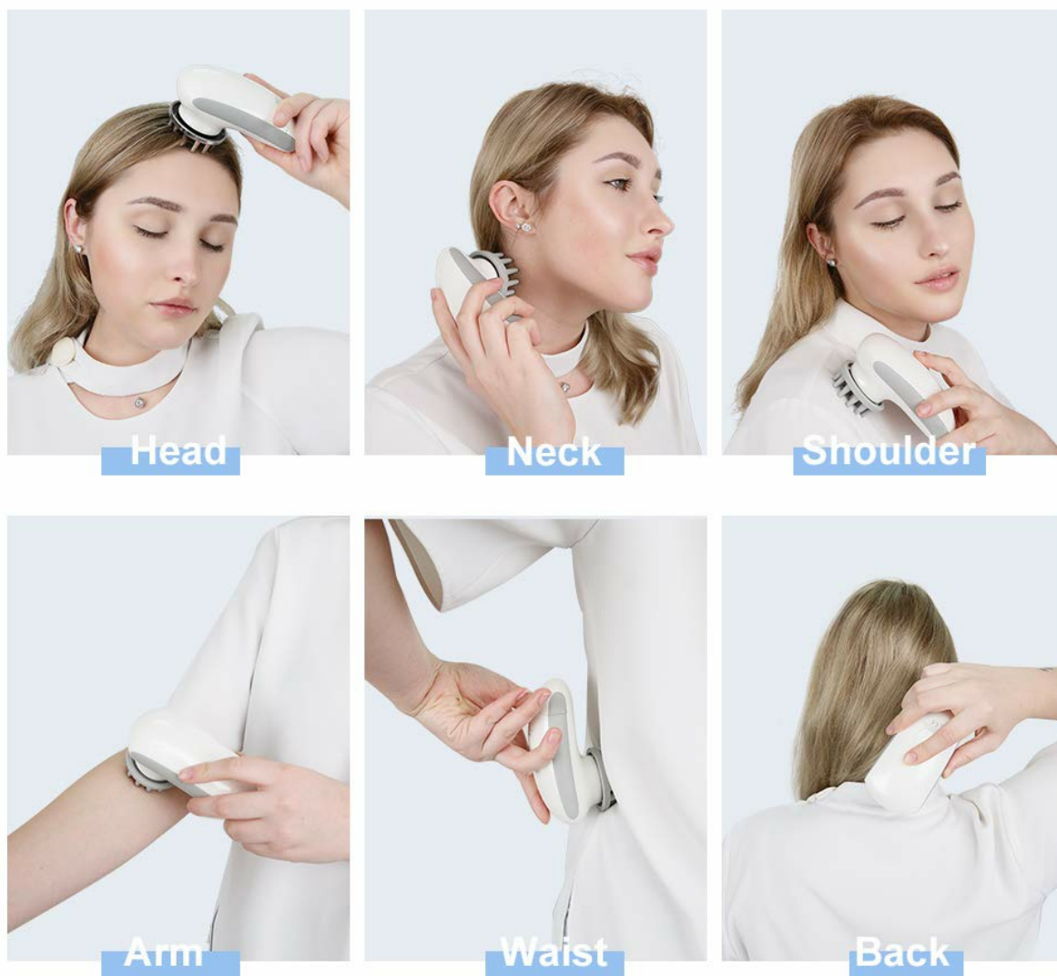
Image: A collage demonstrating the versatility of the device, showing it being used for massage on the head, neck, shoulder, arm, waist, and back.