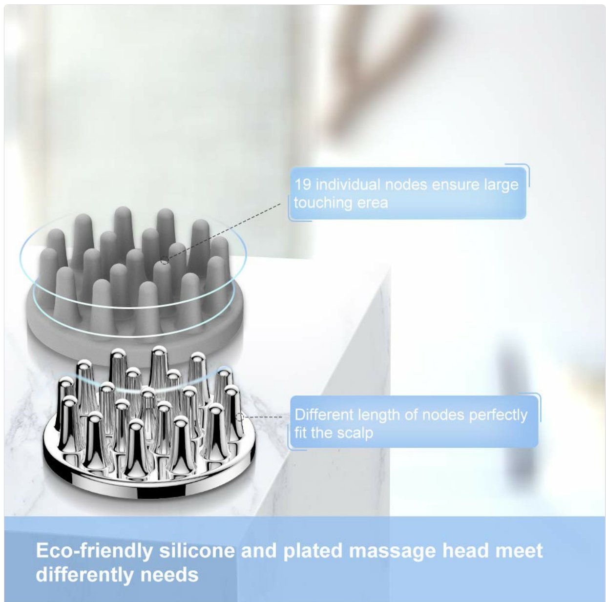
Image: Detailed view of the two scalp massage heads: an eco-friendly silicone head with 19 individual nodes for a large touching area, and a plated massage head with different node lengths designed to fit the scalp.