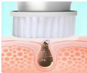
6X More Efficient Cleansing