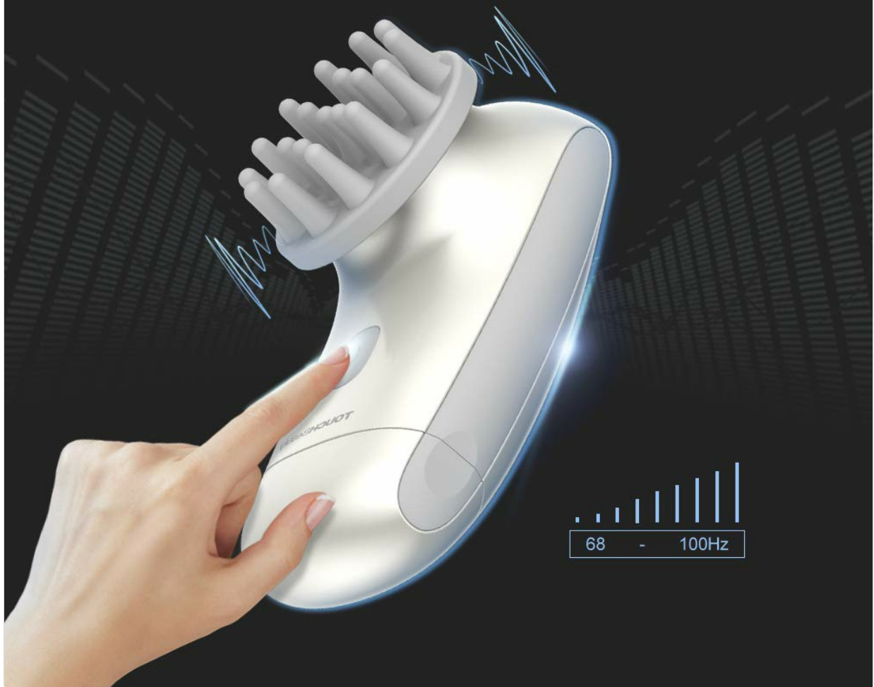
Image: A hand demonstrating how to long-press the power button to adjust the infinitely variable speed and vibration intensity of the device, indicated by a visual scale from 68 to 100Hz.

Press the power button to turn on the device. Long press the power button to adjust the intensity level according to your needs.