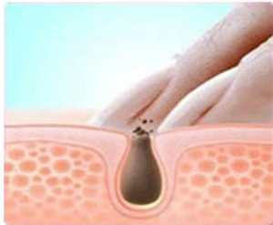
Traditional hand washing

Compared to rotating cleansing, it has less friction to facial skin