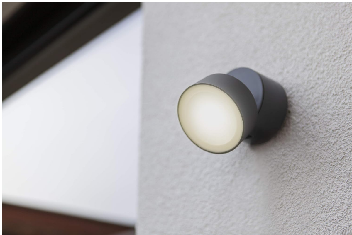
Figure 4.1: Example of the Lutec Trumpet wall light installed on an exterior wall.