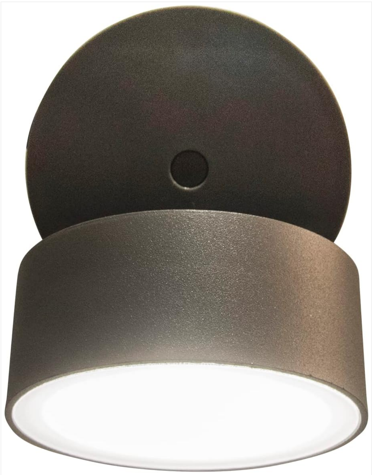
Figure 1.1: Lutech Trumpet 5626101125 LED Outdoor Wall Light, front view.