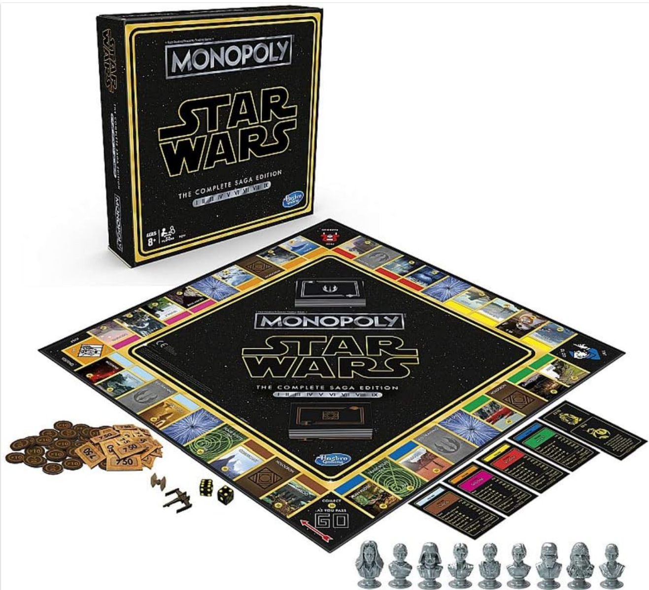
Image: All game components, including the board, character tokens, cards, and credits, are displayed. The board features Star Wars themed properties, and the tokens are detailed busts of characters from the saga.