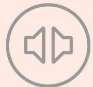
Image: A close-up view emphasizing the custom-tuned 50 mm drivers for powerful and clear sound with immersive bass.