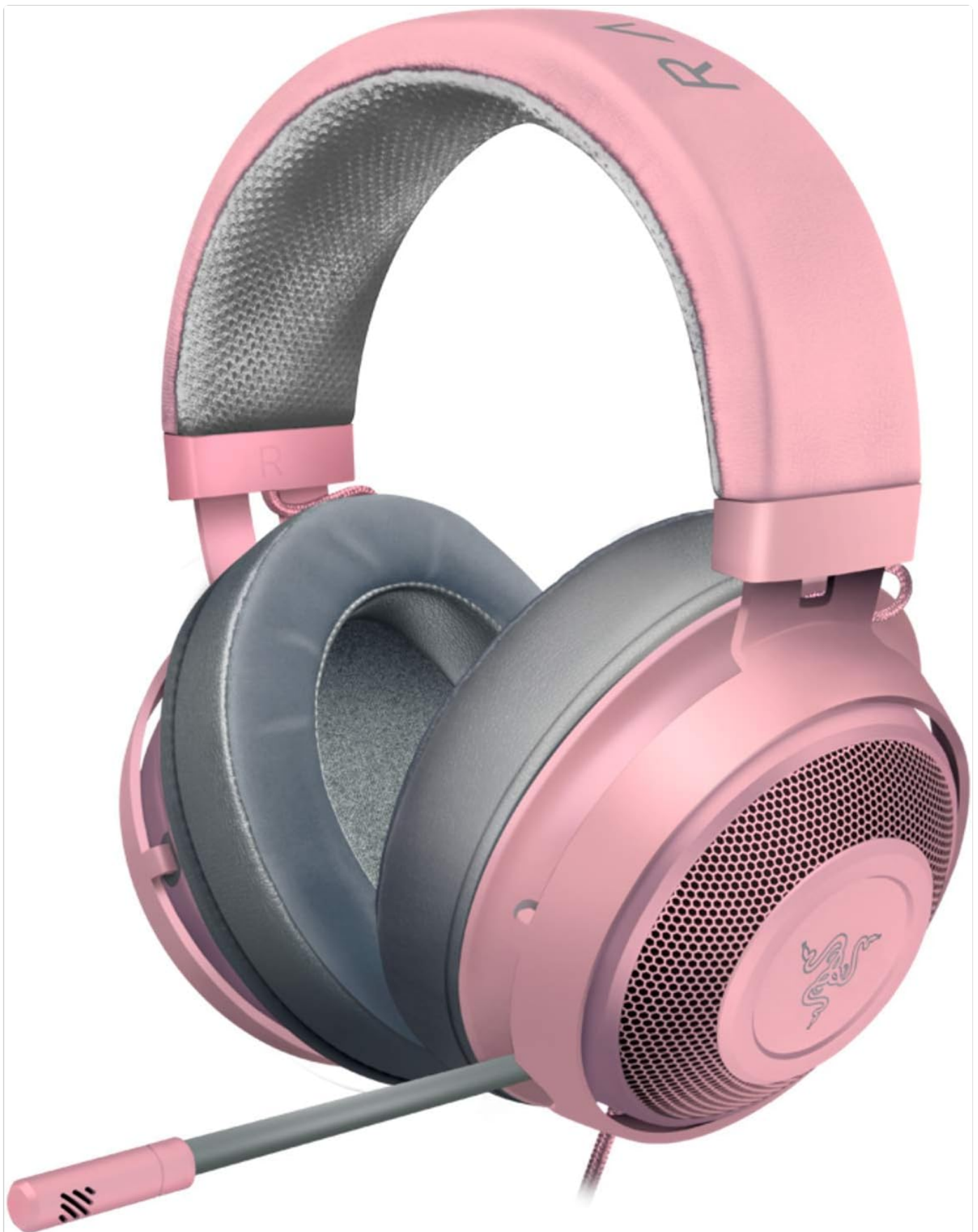
Image: The Razer Kraken Gaming Headset in Quartz Pink, showcasing its overall design with the headband, earcups, and retractable microphone.