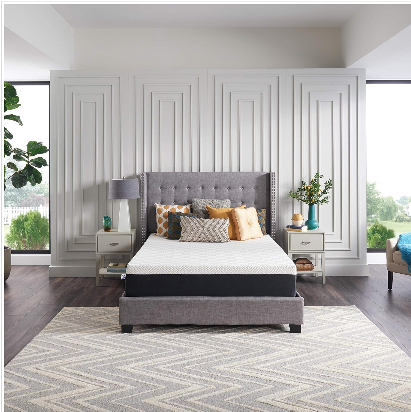
Image: A detailed view of the Sealy 12-inch hybrid mattress, highlighting the quilted top layer and the distinct side panel with the Sealy logo. This image illustrates the mattress's construction and aesthetic.