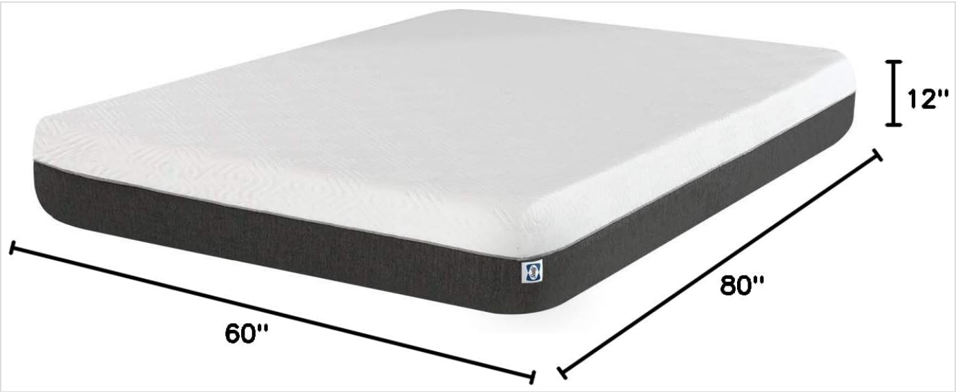
Image: A visual representation of the Sealy 12-inch Queen mattress with its dimensions clearly labeled: 80 inches in length, 60 inches in width, and 12 inches in thickness.