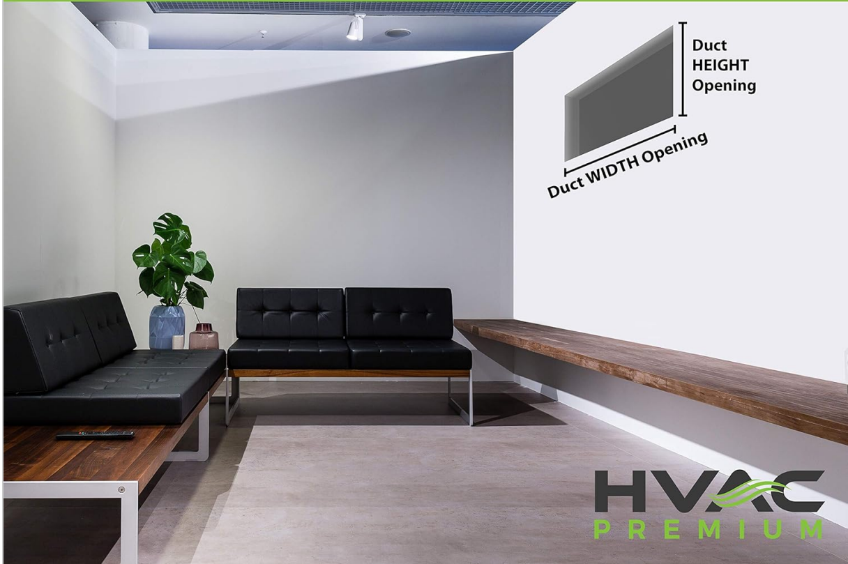
Figure 1: Front view of the HVAC Premium Aluminum Return Grille.