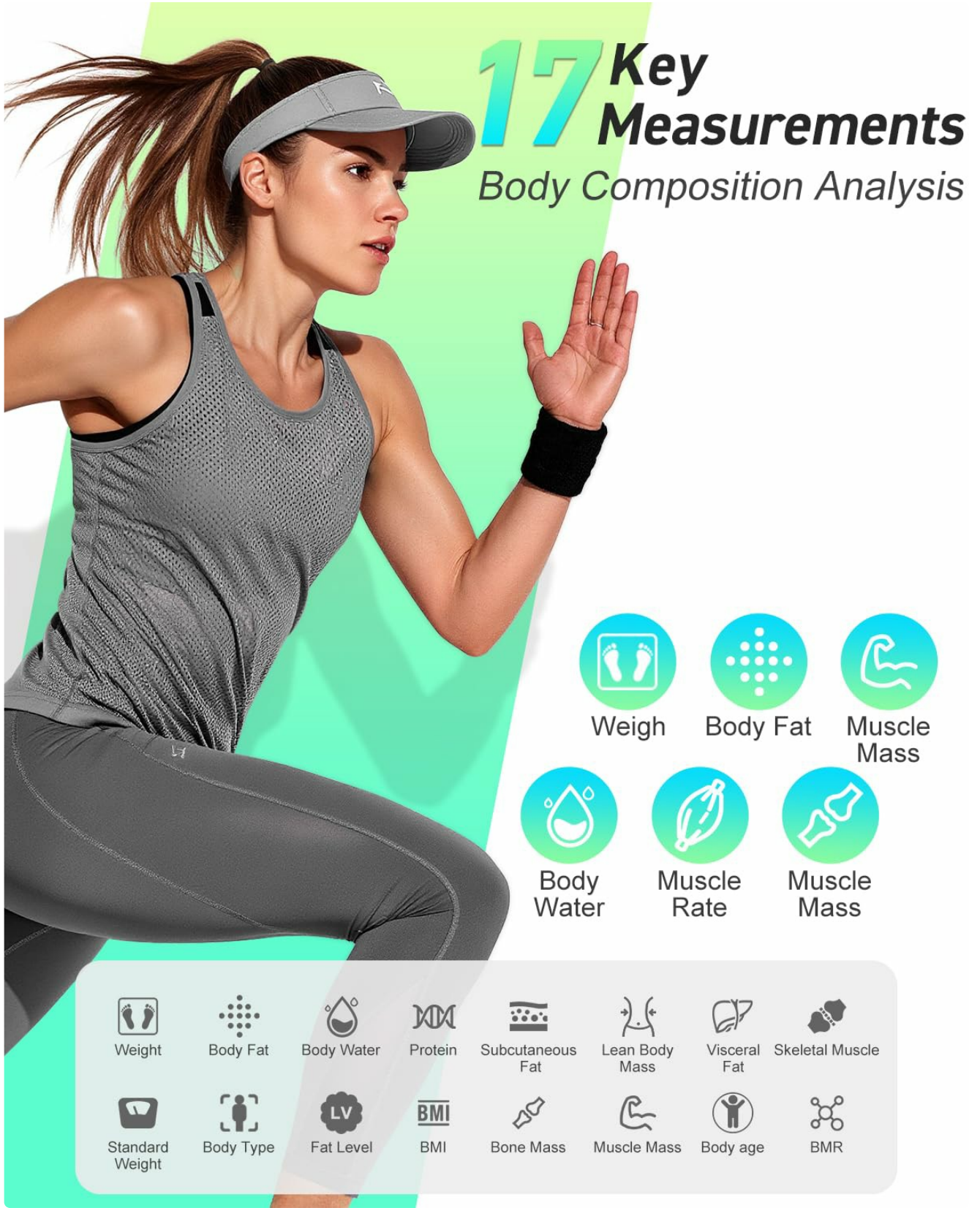
Visual representation of the 17 body metrics tracked by the INSMART Smart Body Fat Scale.