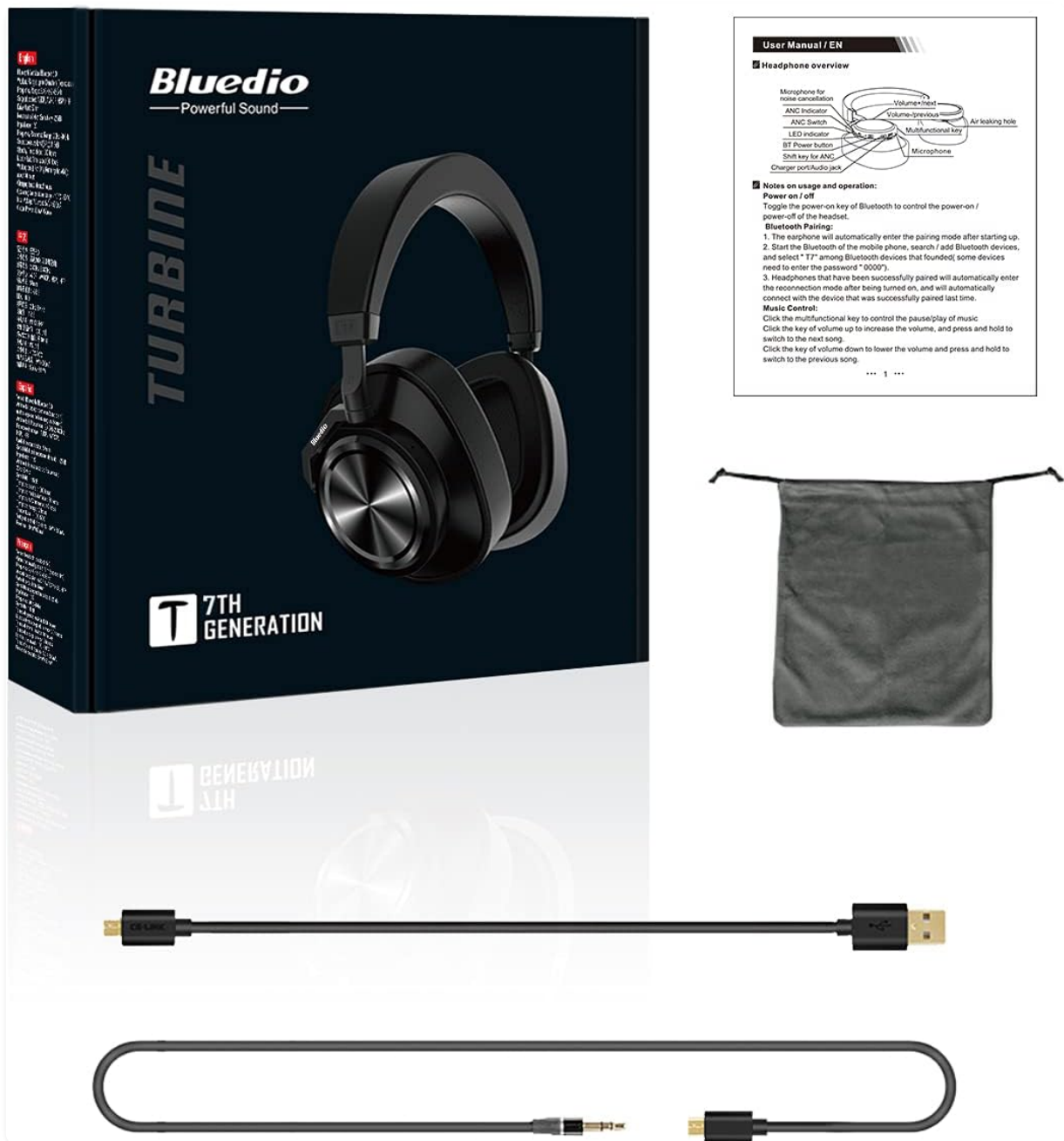
Image 2.1: Bluedio T7 Headphones and included accessories. The image displays the headphones, a USB-C charging cable, an audio cable, a carrying pouch, and the user manual.