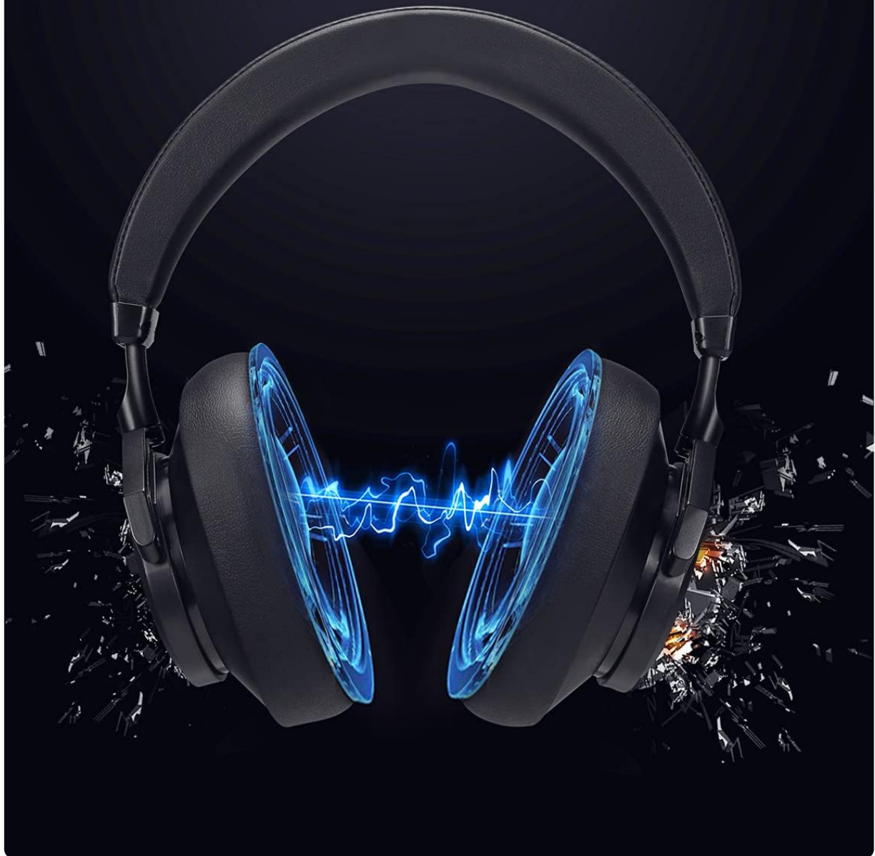
Image 8.1: Bluedio T7 headphones highlighting the 57mm proprietary drivers. These drivers are designed to deliver balanced and clear audio.