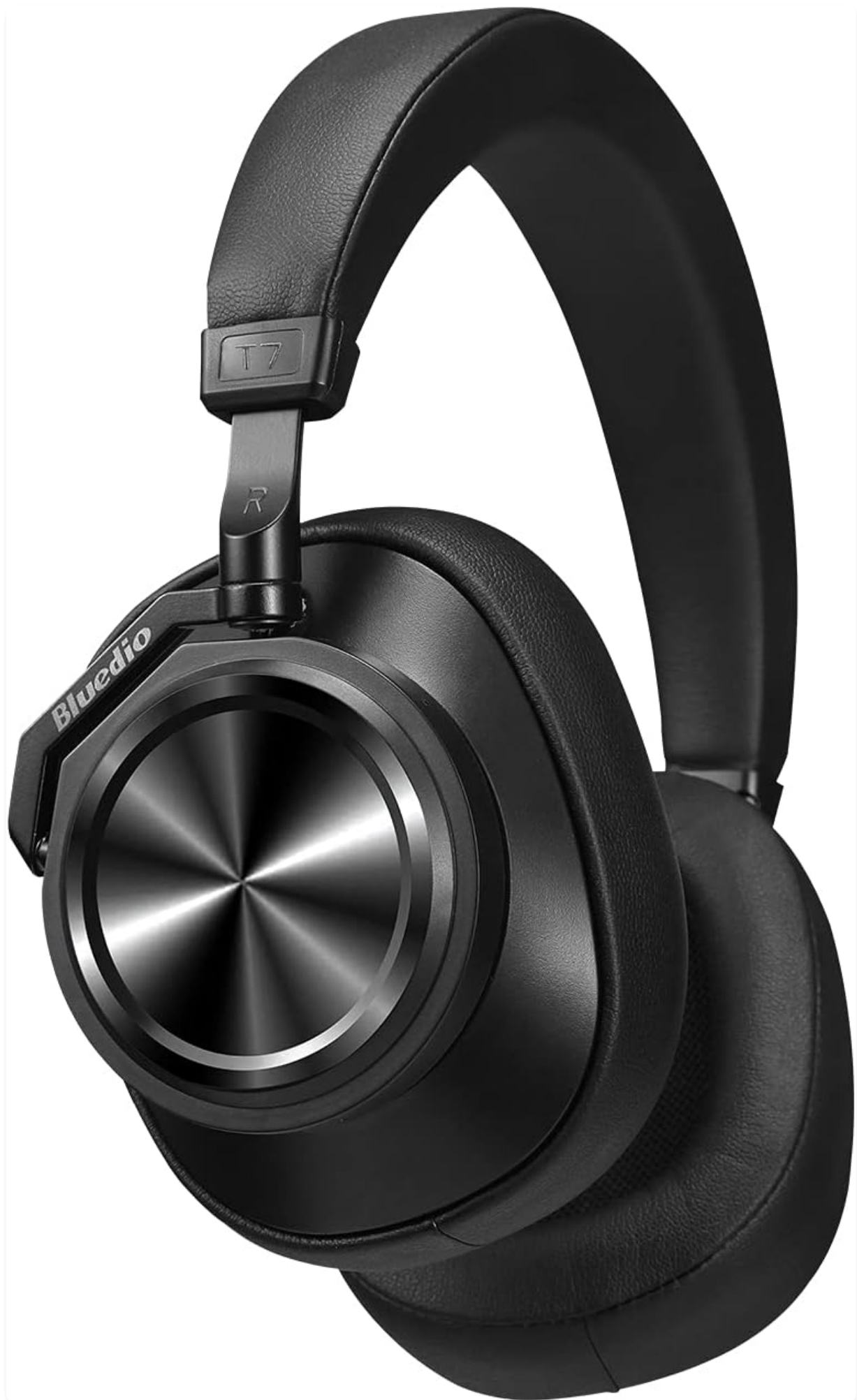
Image 1.1: Bluedio T7 Turbine Active Noise Canceling Bluetooth Headphones. These over-ear headphones feature a