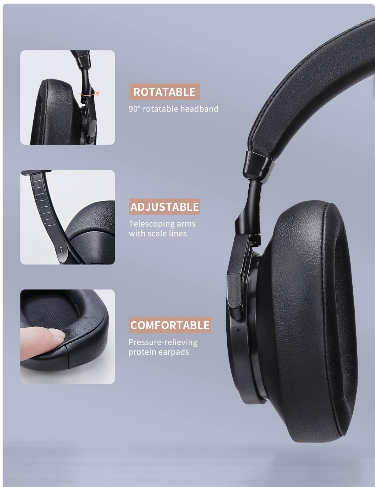
Image 6.1: Bluedio T7 headphone design features. The image highlights the 90-degree rotatable headband, adjustable telescoping arms with scale lines, and comfortable pressure-relieving protein earpads.