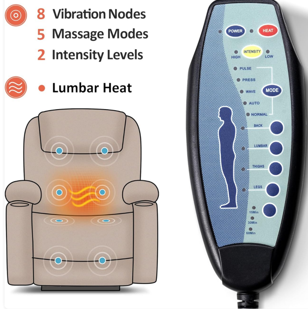
Image: Diagram illustrating the placement of 8 vibration nodes throughout the chair and a single lumbar heating point, alongside the dedicated remote control for massage and heat functions.

Heating function works separately from vibration.