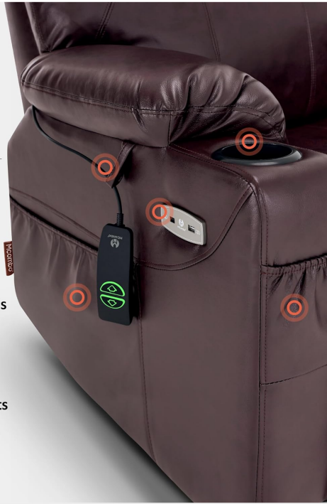
Image: A close-up view of the recliner's armrest, highlighting the dual USB and Type-C charging ports, two cup holders, and the convenient side and front pockets for storage.