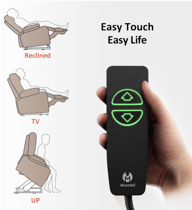
Image: The remote control for the recliner, showing the 'UP' and 'DOWN' buttons used to adjust the chair's position, along with illustrations of the Reclined, TV, and Lift (UP) positions.

The chair is operated using a wired remote control with lighted buttons for easy visibility.