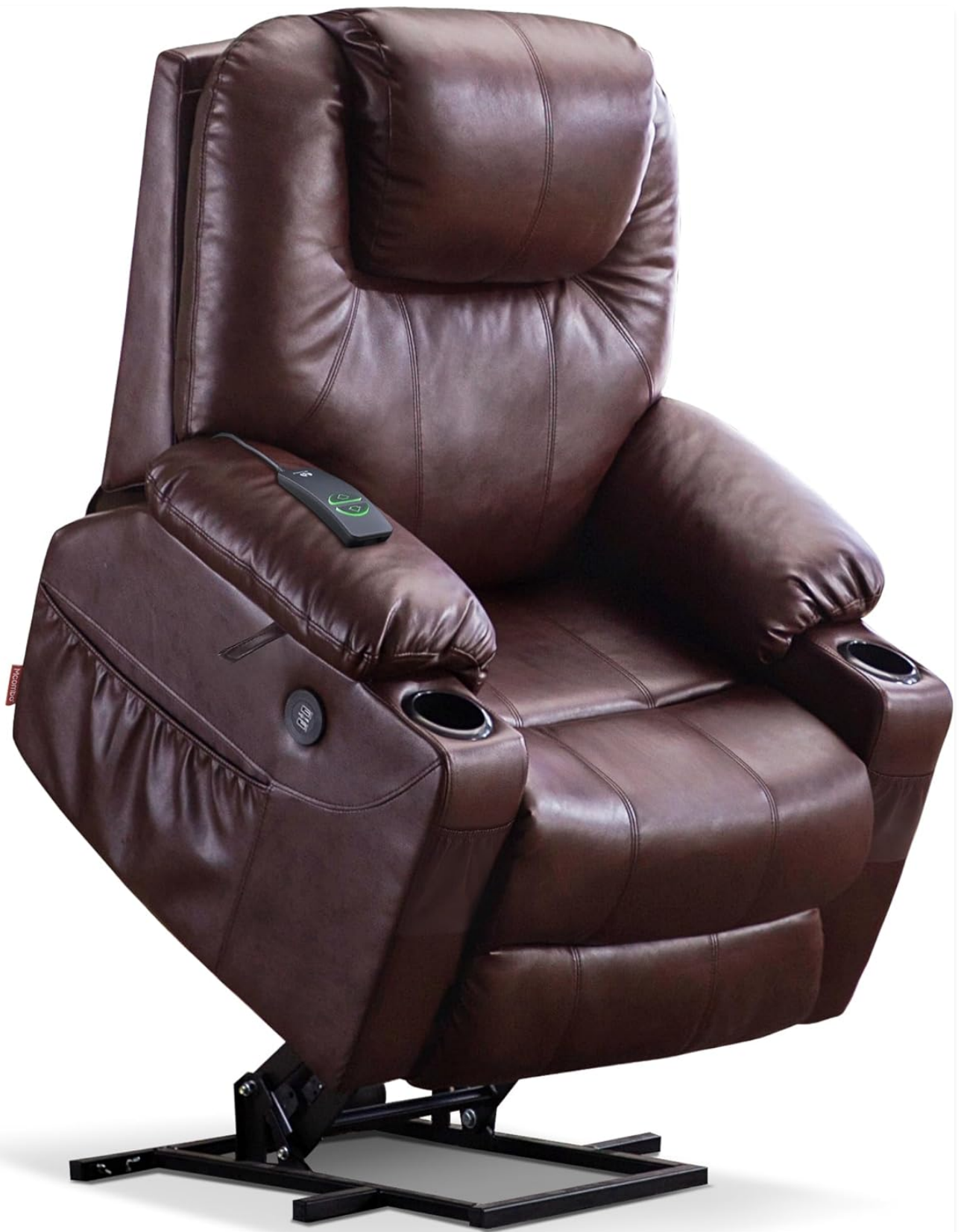
Image: The MCombo Electric Power Lift Recliner Chair in its upright, slightly lifted position, showcasing its dark brown faux leather upholstery, armrests with cup holders, and remote control.

This chair is constructed with high-quality faux leather for durability and easy cleaning, and features a thick seat cushion for enhanced comfort. The wooden frame is FSC certified, ensuring sustainable sourcing.