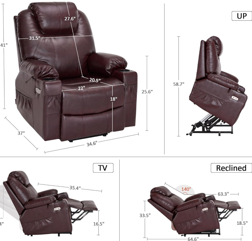
Image: Comprehensive dimension diagram for the MCombo recliner, including overall height, width, depth, seat dimensions, and recline angles for upright, TV, and fully reclined positions. Also indicates ideal user height (5'1"-5'9") and maximum capacity (350 lbs).

Ideal Height : 5'1"-5'9" Max Capacity : 350 lbs