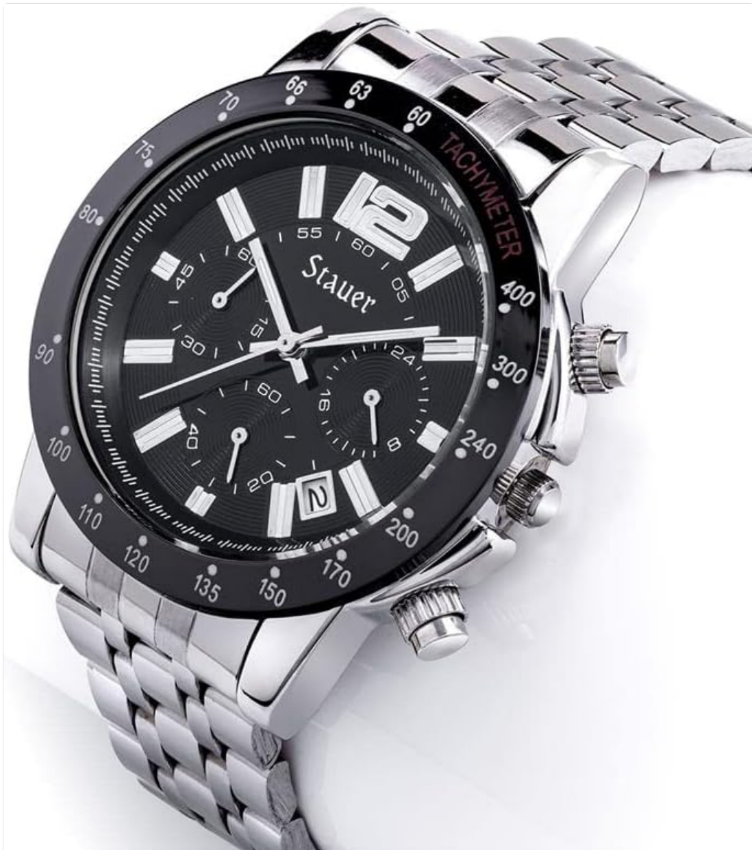
Image: Another front view of the Stauer Jet Setter Chronograph Watch, showcasing its overall design.