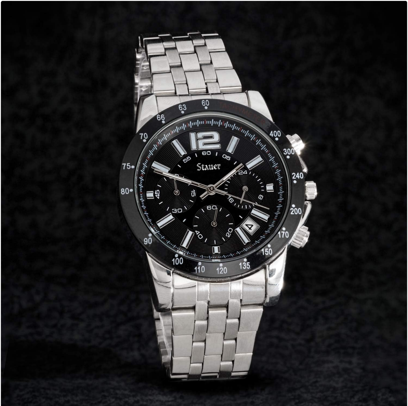
Image: Angled view of the Stauer Jet Setter Chronograph Watch, highlighting the crown and pushers.

The stainless steel bracelet can be adjusted by removing or adding links. It is recommended to have this procedure performed by a qualified jeweler to prevent damage to the watch or bracelet.