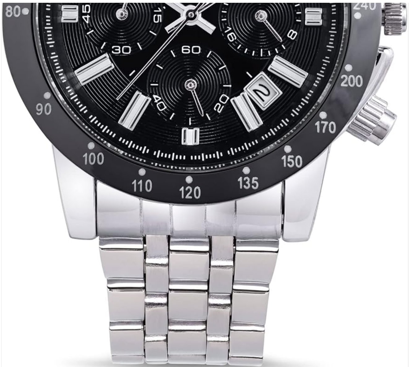
Image: Front view of the Stauer Jet Setter Chronograph Watch, showcasing its black dial and stainless steel bracelet.