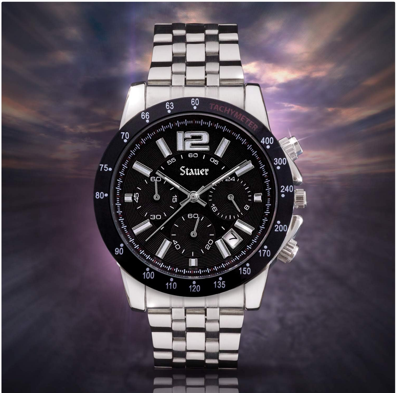
Image: Close-up view of the Stauer Jet Setter Chronograph Watch dial, showing the subdials, date window, and tachymeter

The tachymeter bezel on your watch can be used to measure speed over a known distance (e.g., 1 mile or 1 kilometer). Start the chronograph when you begin the distance, and stop it when you complete the distance. The number on the tachymeter scale corresponding to where the chronograph second hand points indicates the speed in units per hour (e.g., miles per hour or kilometers per hour).