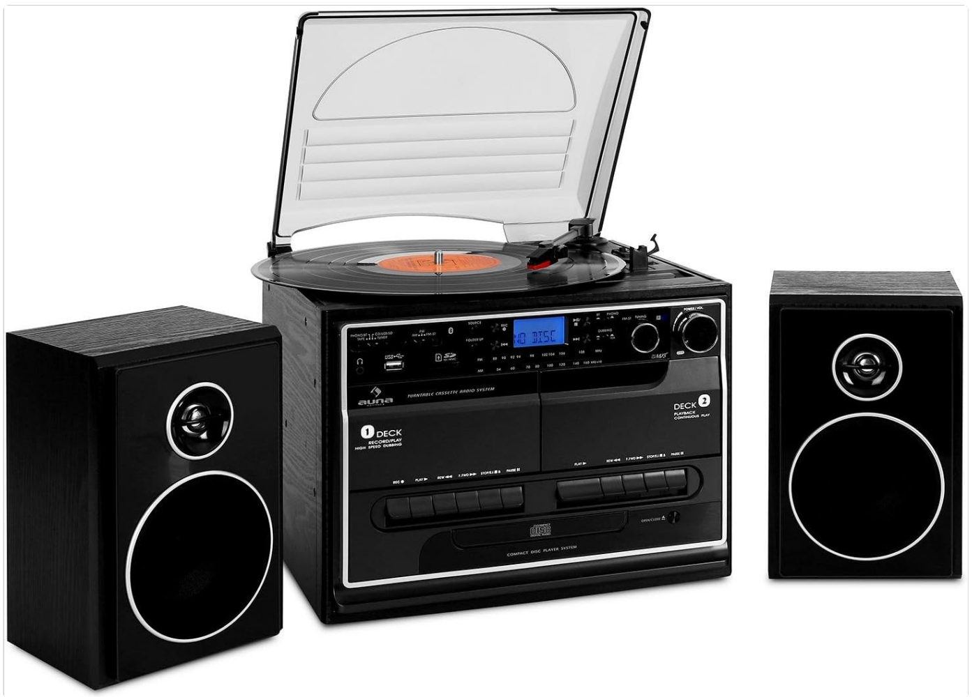
Figure 1: Front view of the auna 388-BT stereo system with turntable, main unit, and two external speakers.