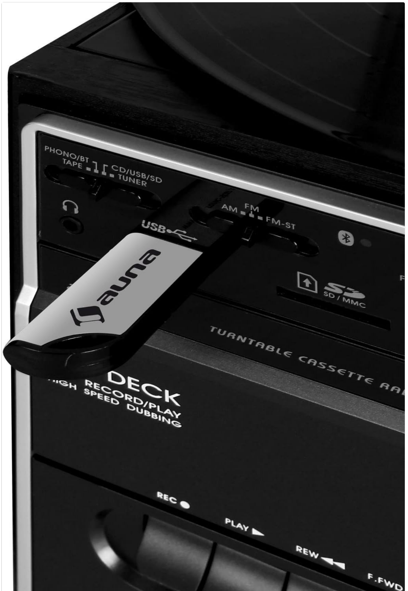
Figure 2: Detailed view of the main unit's front panel, showing the display, control buttons, and input ports.