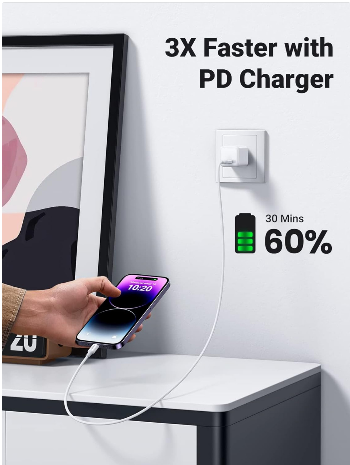
Image: An iPhone connected to a wall charger via the UGREEN USB C to Lightning Cable, demonstrating fast charging capabilities with a visual indicator of 60% charge in 30 minutes.