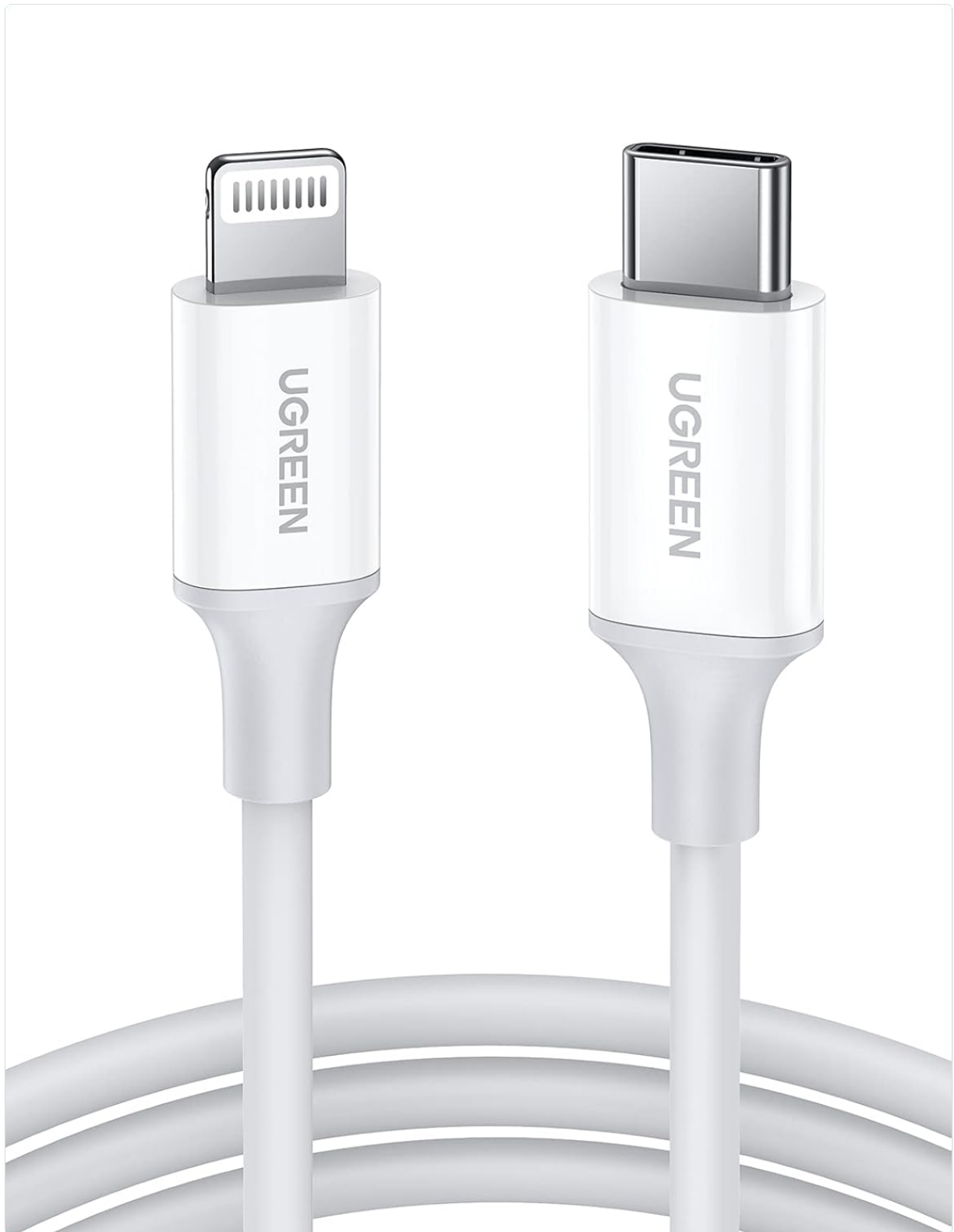
Image: The UGREEN USB C to Lightning Cable, showcasing its USB-C and Lightning connectors.