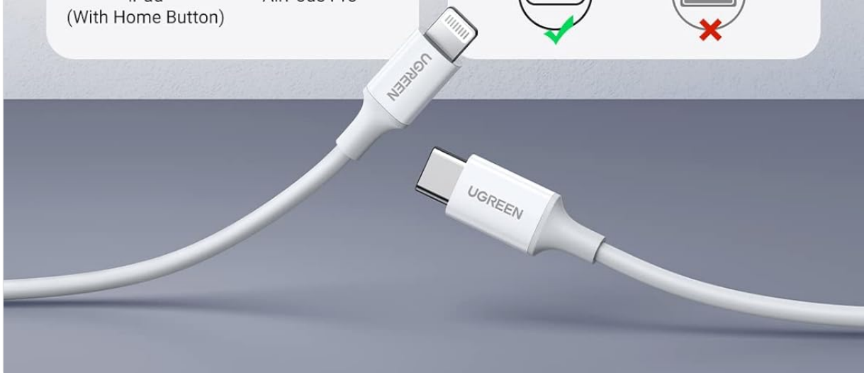
Image: A visual guide illustrating the universal compatibility of the cable with Lightning output devices (iPhone, iPad, AirPods) and USB-C input devices (USB-C charger, power bank, other USB-C devices). A note indicates that a USB-C charger is required.