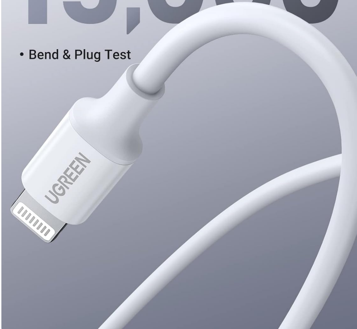
Image: A close-up view of the UGREEN USB C to Lightning Cable's flexible yet robust connector joint, illustrating its superior durability and resistance to bending.