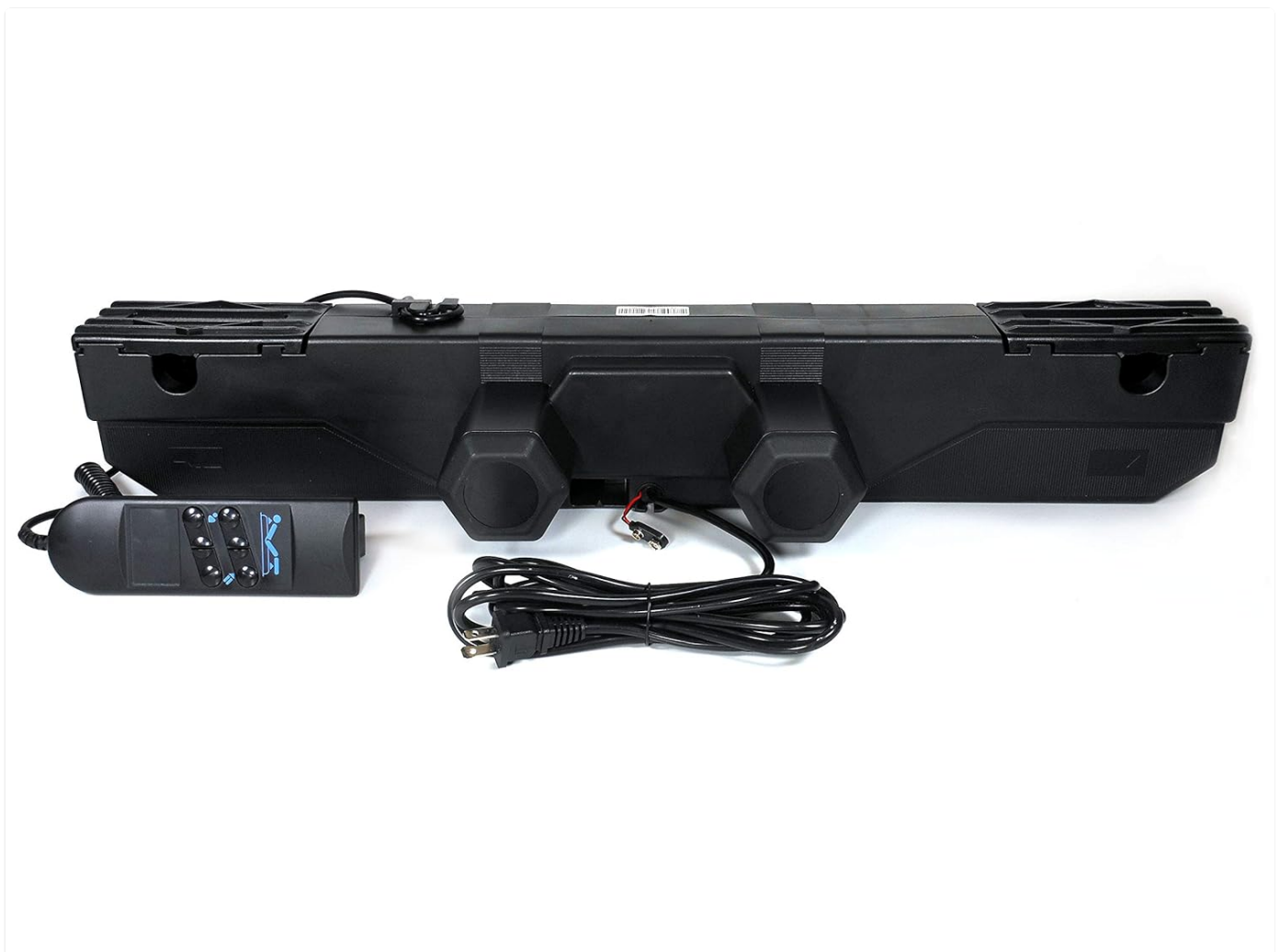
Figure 1: Richmat HJA1S Actuator Motor, showing the main unit, wired remote control, and power cord.

This manual provides essential information for the safe and effective operation, installation, and maintenance of your Richmat HJA1S Actuator Motor. Please read this manual thoroughly before use and retain it for future reference.