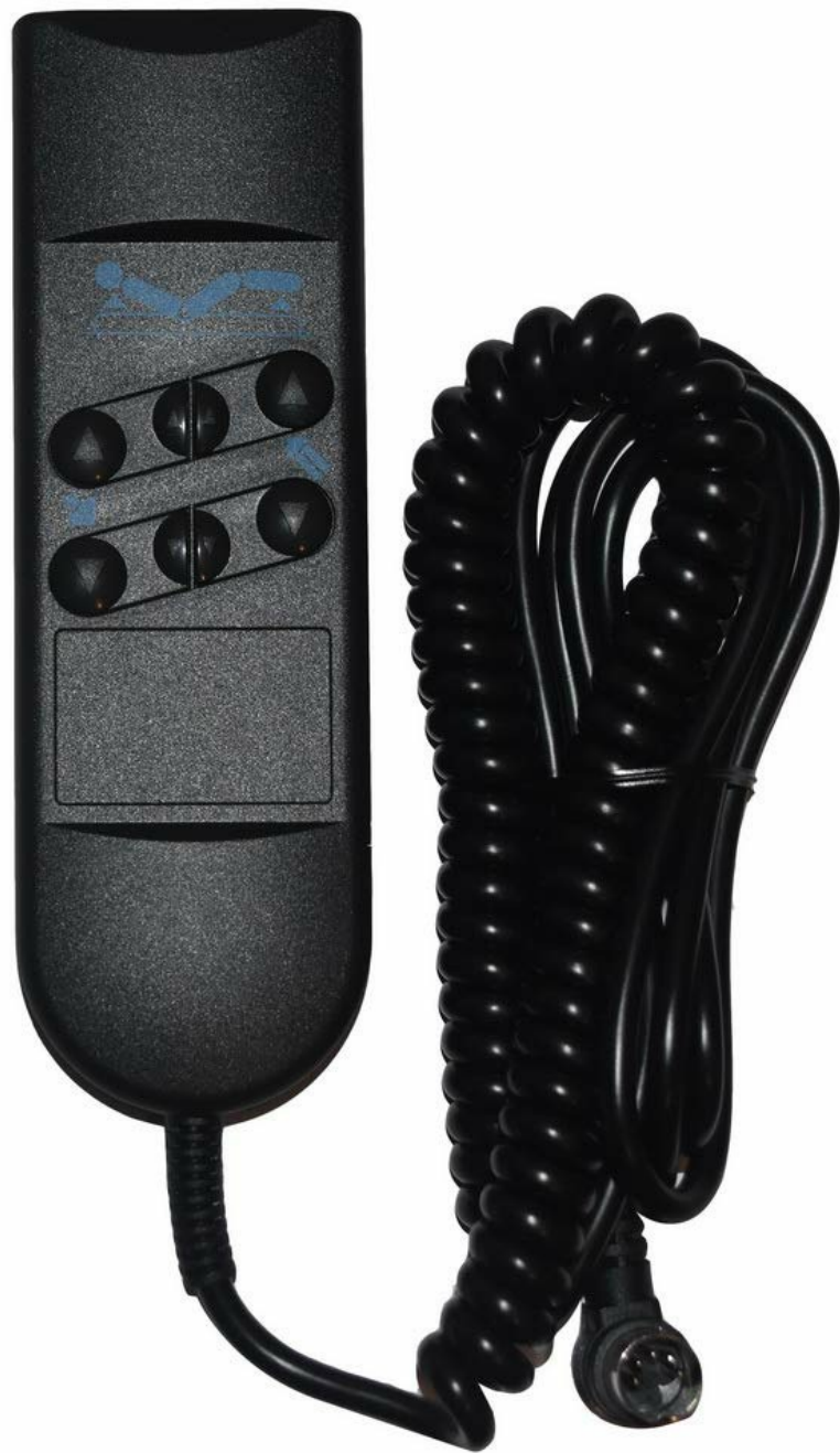
Figure 4: The wired remote control used to operate the bed's adjustable functions.