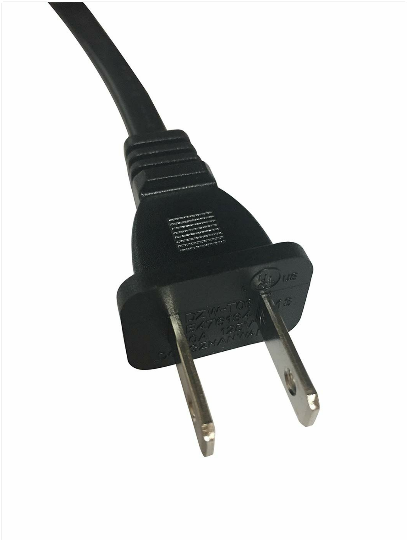
Figure 5: The standard 2-prong power plug for connecting the motor to an electrical outlet.