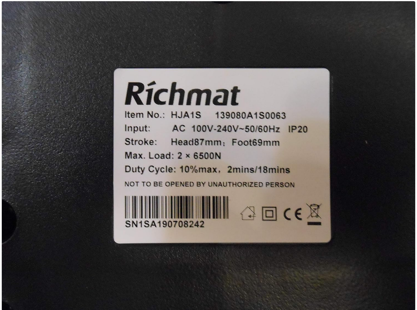
Figure 2: Product label displaying model number, input voltage, stroke, max load, duty cycle, and safety warnings.