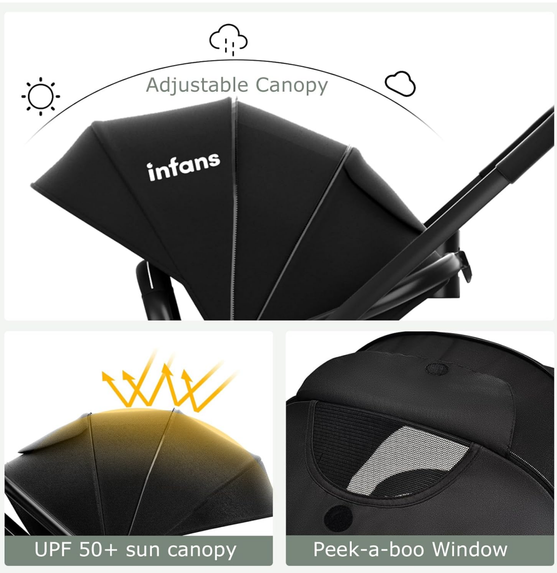
Image: Details of the adjustable canopy, highlighting its UPF 50+ sun protection and the convenient peek-a-boo window.