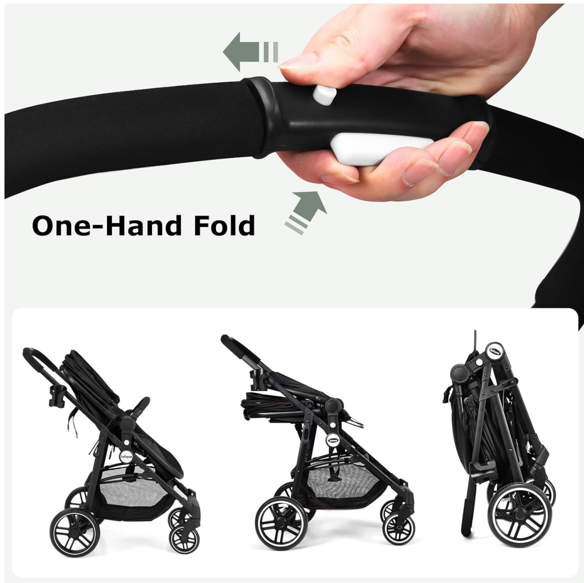
Image: Step-by-step visual guide to folding the stroller using a one-hand mechanism.