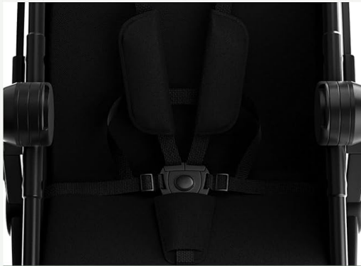
5-Point Safety Belt