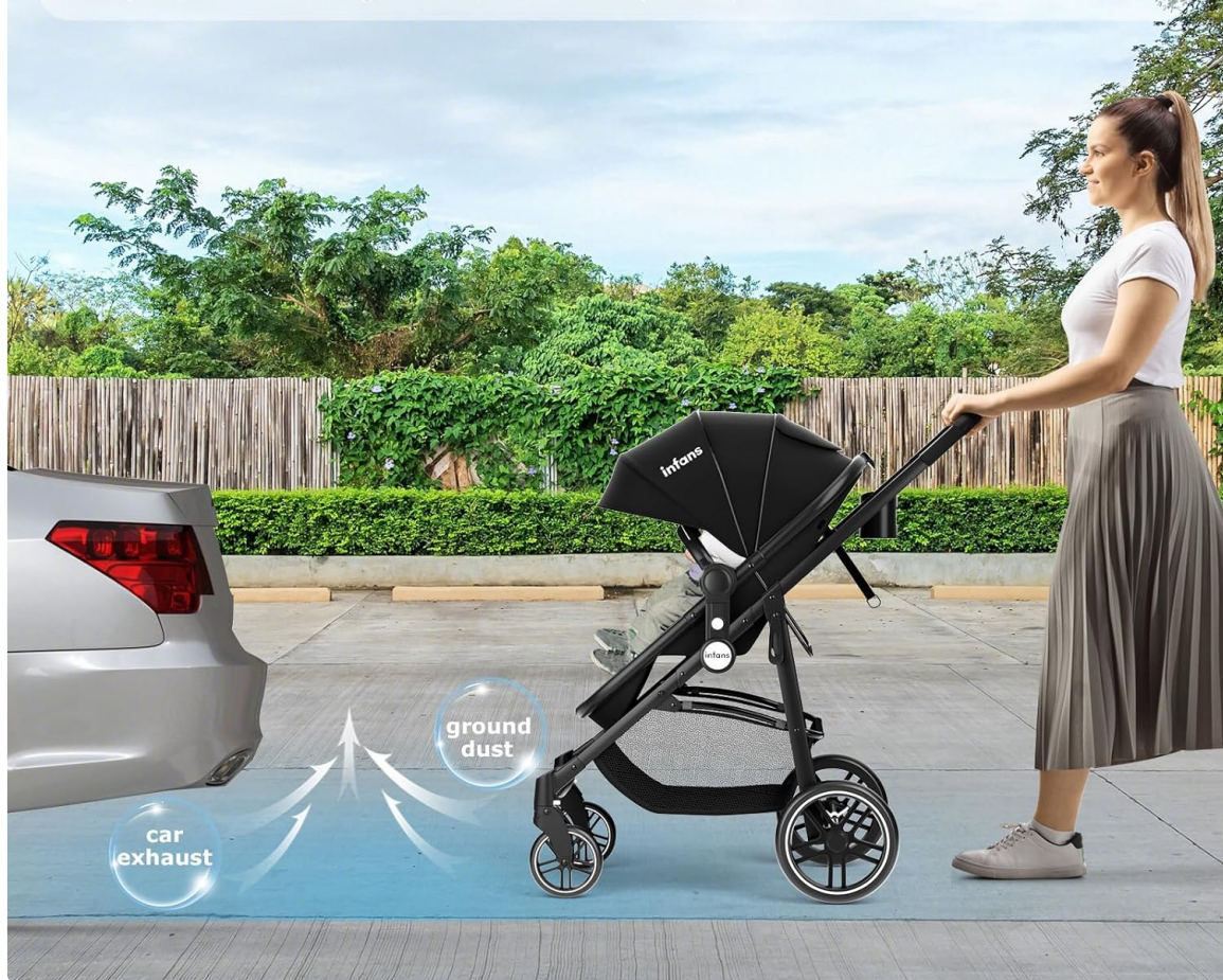
Image: The stroller's elevated seat height, designed to protect the child from environmental pollutants.

The proper seat height keeps the baby away from car exhaust and dust