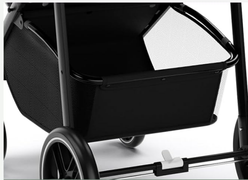
Large-capacity Storage Space

Image: Overview of comfort and convenience features including the safety belt, cup holder, removable armrest, and storage space.