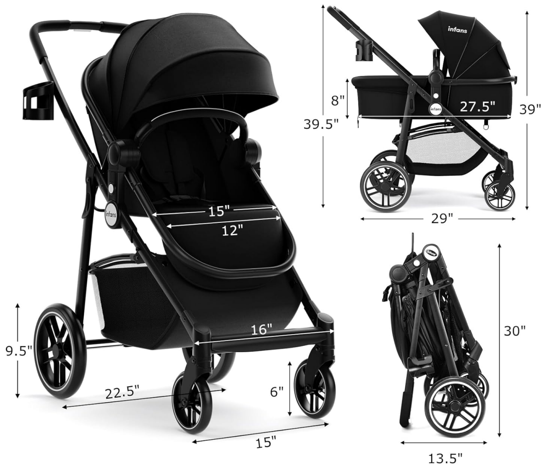
Image: Detailed measurements of the stroller, including height, width, length, and folded size.