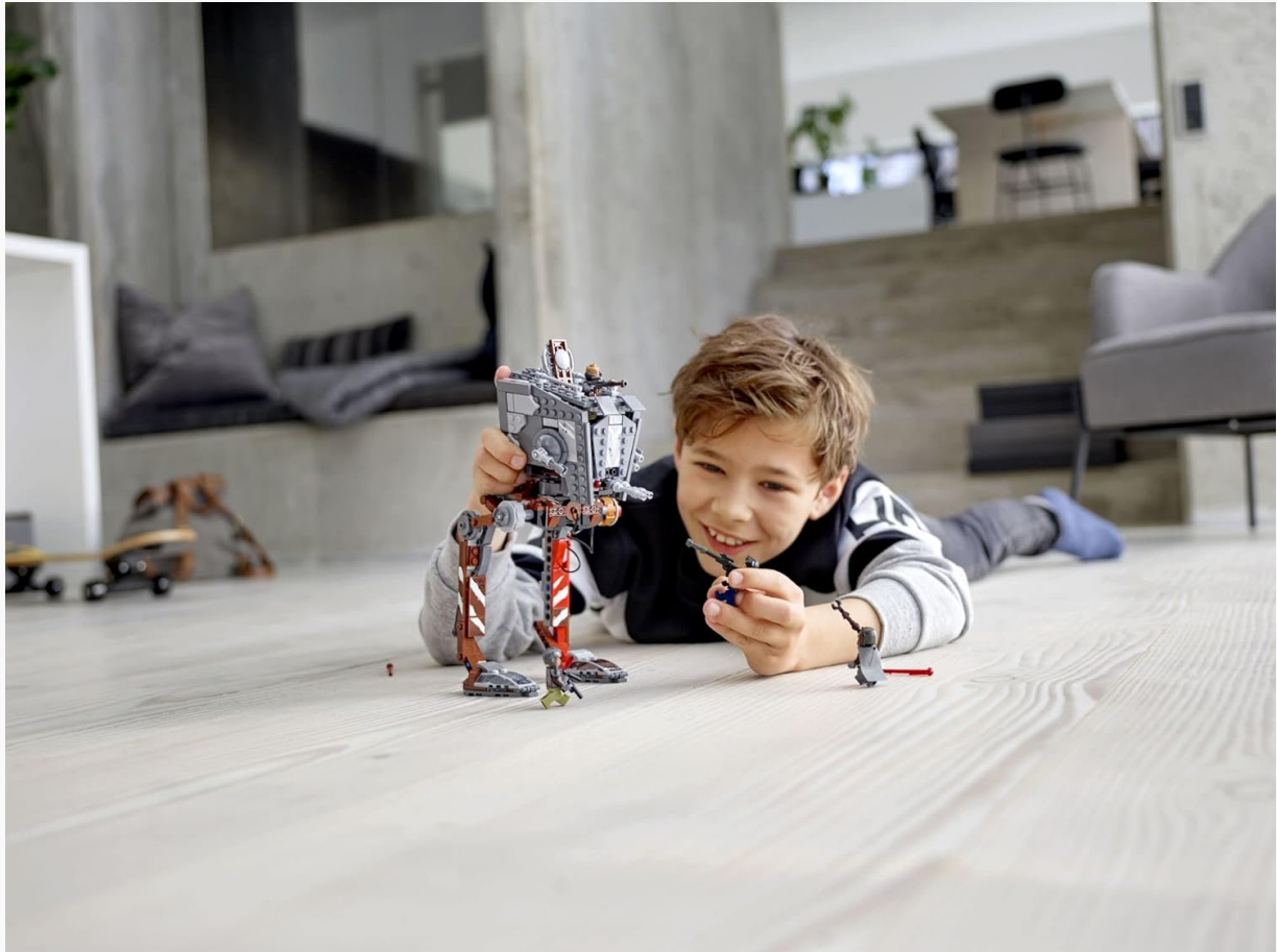
Image: A child engaging in play with the assembled LEGO AT-ST Raider model and minifigures on a wooden floor.

Image: The LEGO AT-ST Raider model depicted in action, with simulated laser fire emanating from its weapons, accompanied by minifigures.