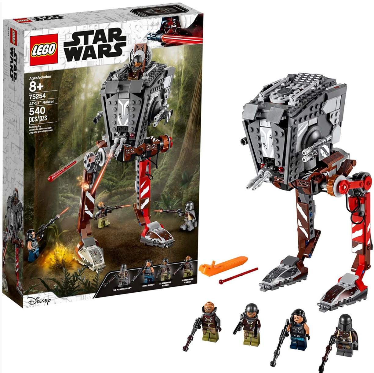
Image: The LEGO Star Wars AT-ST Raider 75254 Building Kit box alongside the fully assembled model and minifigures.