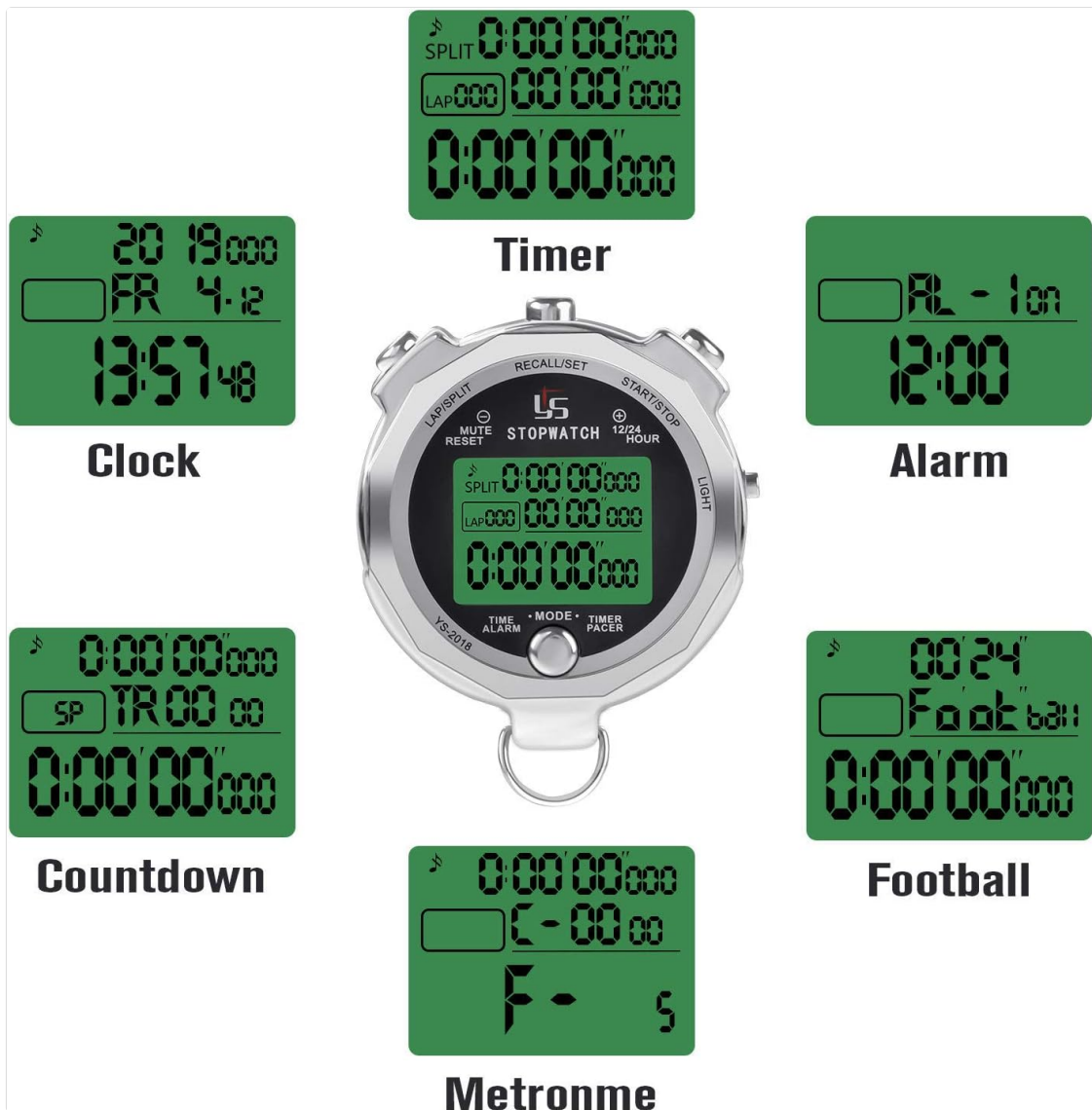
An illustration showing the LAOPAO Stopwatch display in different operational modes, including Timer, Clock, Alarm, Countdown, Football, and Metronome.