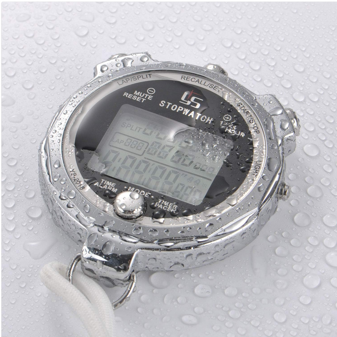
The LAOPAO Metal Digital Stopwatch covered in water droplets, highlighting its water-resistant design.

The LAOPAO YS-2018-100 is designed to be water-resistant, making it suitable for use in various weather conditions. However, it is not intended for submersion. Avoid pressing buttons while the stopwatch is wet to prevent water ingress.