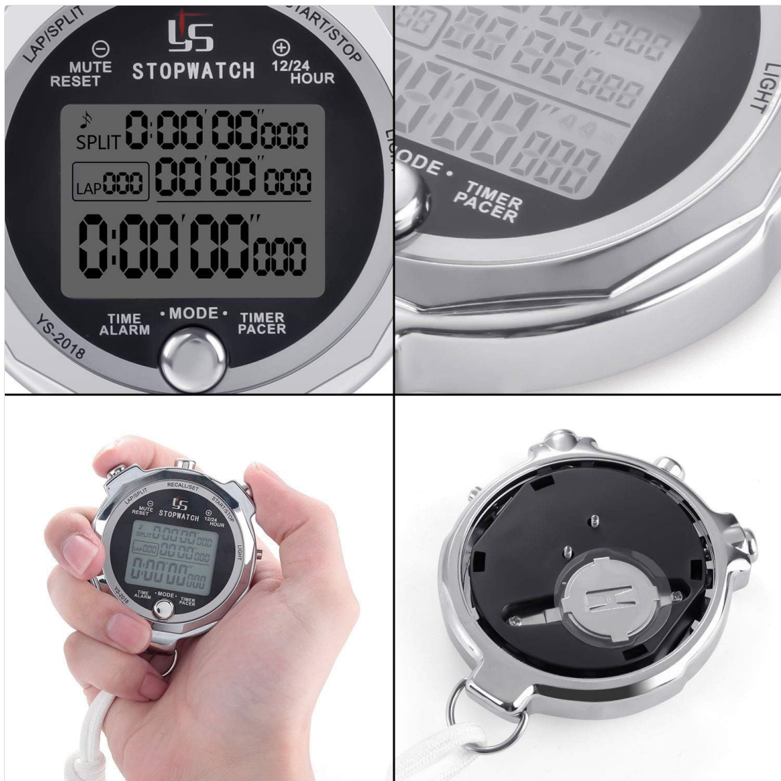
A composite image showing detailed views of the stopwatch's digital display, control buttons, and the rear panel with the battery compartment open for battery replacement.