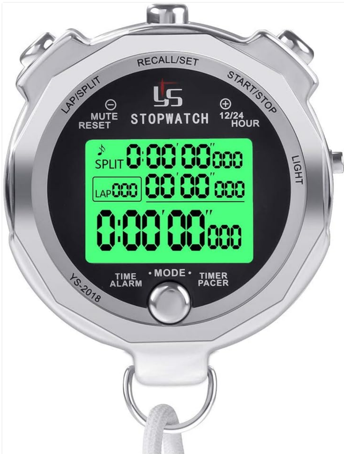
Front view of the LAOPAO Metal Digital Stopwatch, displaying the time and various function labels around the bezel.