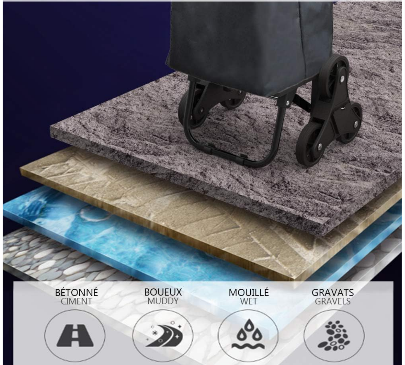
Figure 6: Demonstrates the trolley's versatility and robust wheel design, allowing it to adapt to various terrains such as concrete, muddy paths, wet surfaces, and gravel.