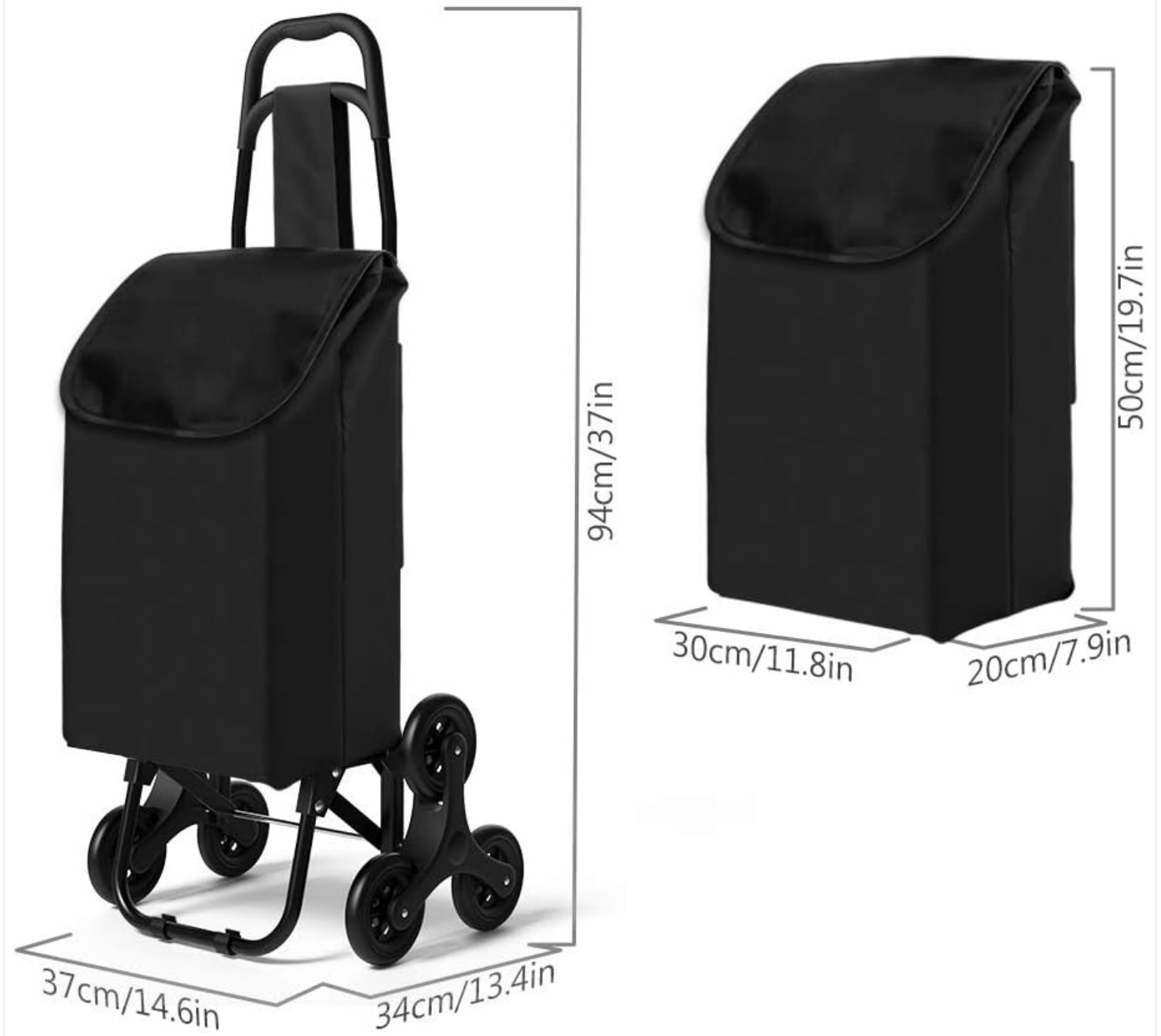
Figure 7: Comprehensive product dimensions for both the trolley frame and the removable shopping bag.