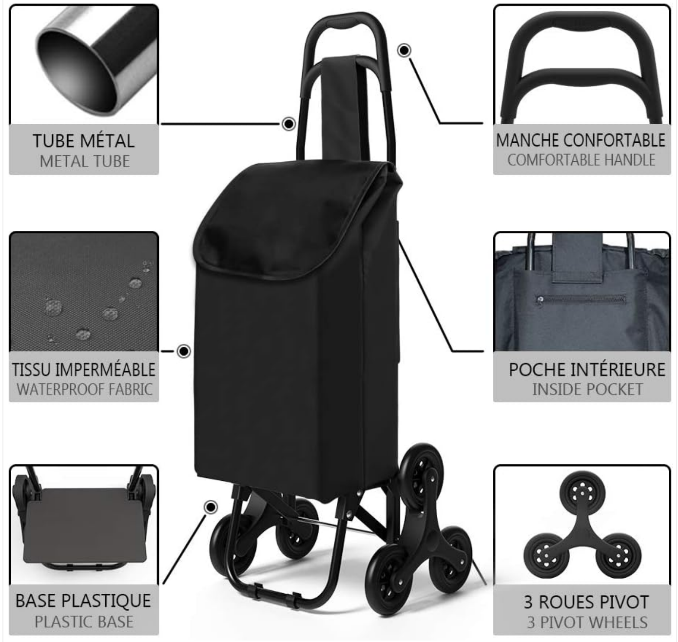
Figure 1: Detailed view of the VOUNOT Shopping Trolley's components, highlighting the metal frame, comfortable handle, waterproof bag, internal pocket, plastic base, and the unique 3-pivot wheel system.