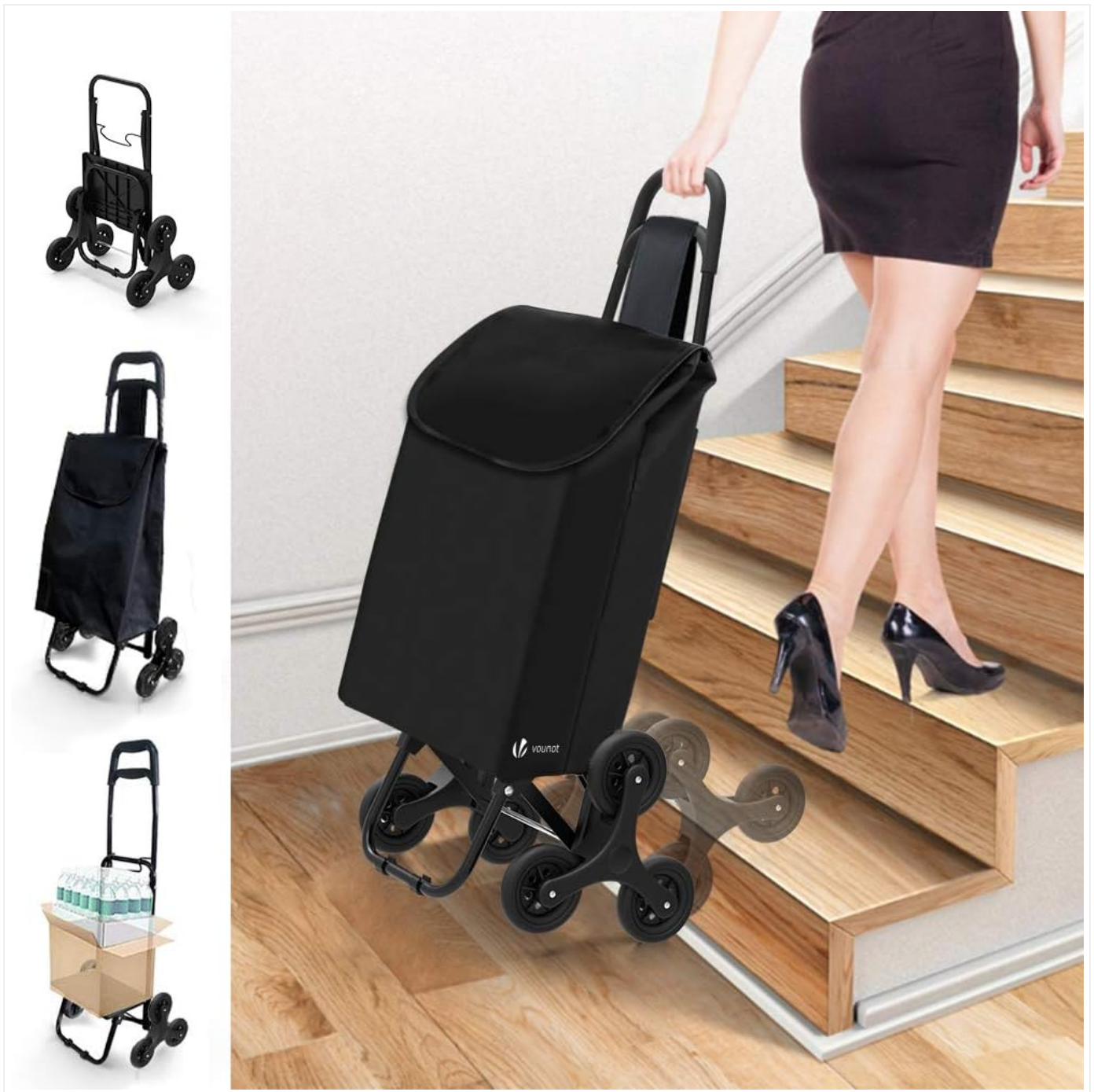
Figure 4: The VOUNOT trolley in action, showcasing its ease of use on stairs due to the innovative 6-wheel design. Also shown are the trolley's folded state and its use as a utility cart.