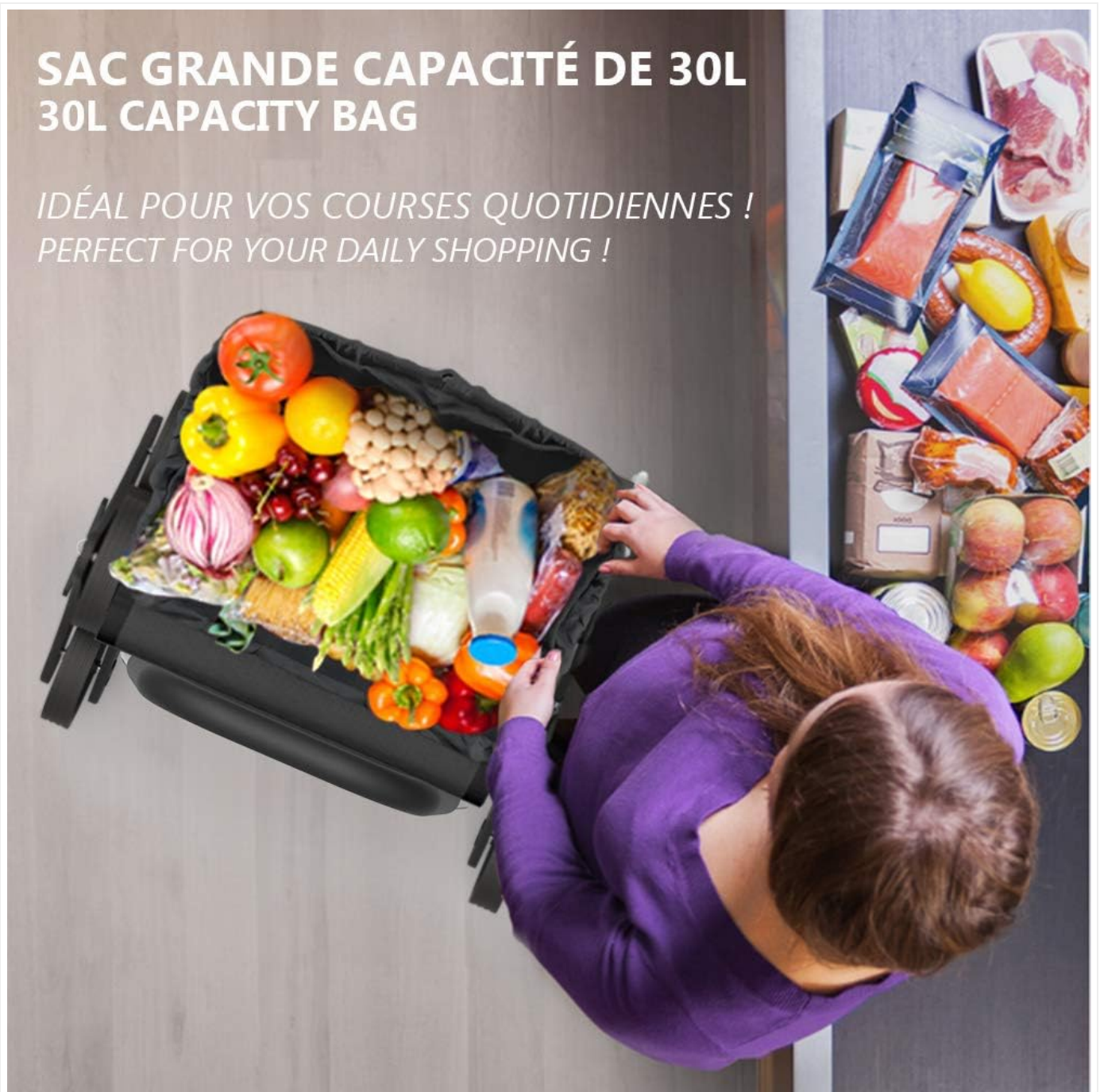
Figure 3: Illustrates the ample 30L capacity of the shopping bag, perfect for accommodating a variety of daily groceries.

IDÉAL POUR VOS COURSES QUOTIDIENNES ! PERFECT FOR YOUR DAILY SHOPPING !