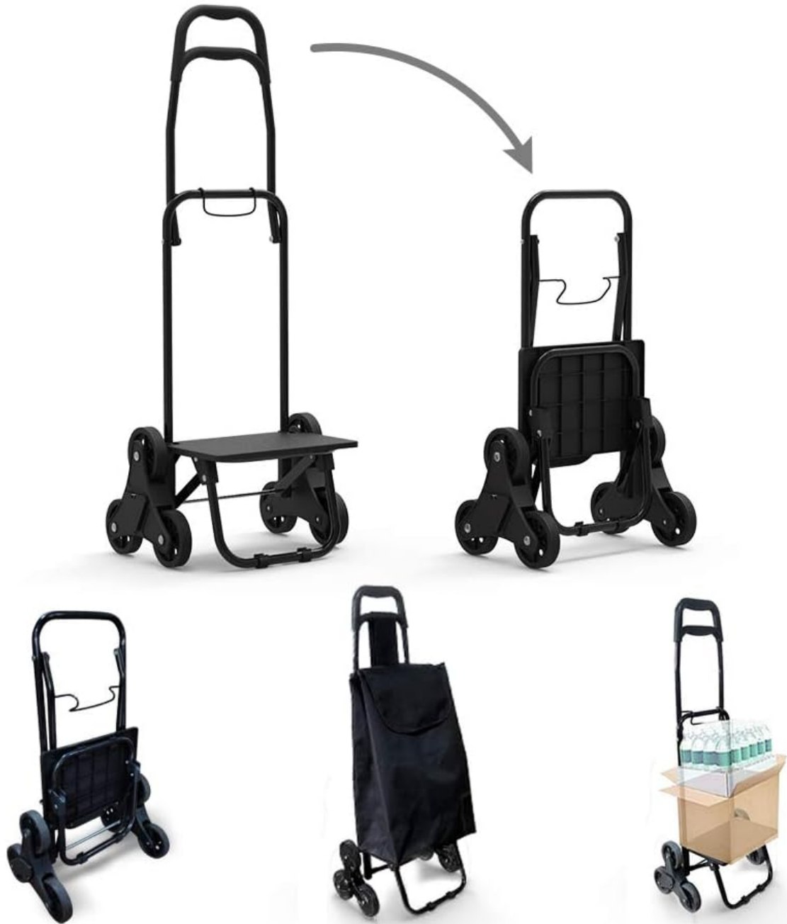
Figure 2: Visual guide to folding and unfolding the trolley frame for storage optimization, and demonstrating its dual function as a cart for transporting various items.