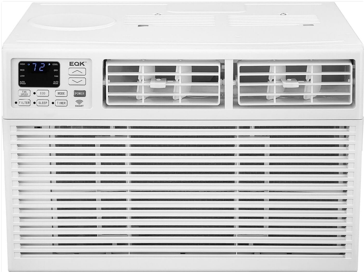
Figure 1: Front view of the Emerson Quiet Kool 15,000 BTU Smart Window Air Conditioner unit.