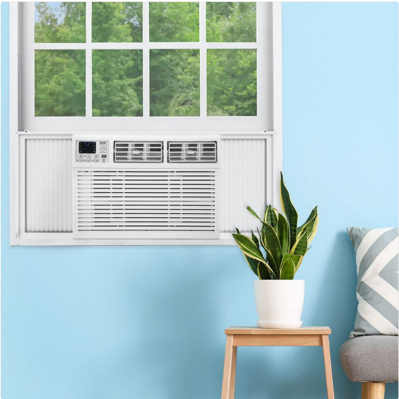
Figure 3: The air conditioner unit properly installed in a window, showcasing the side panels extended to fit the window frame.