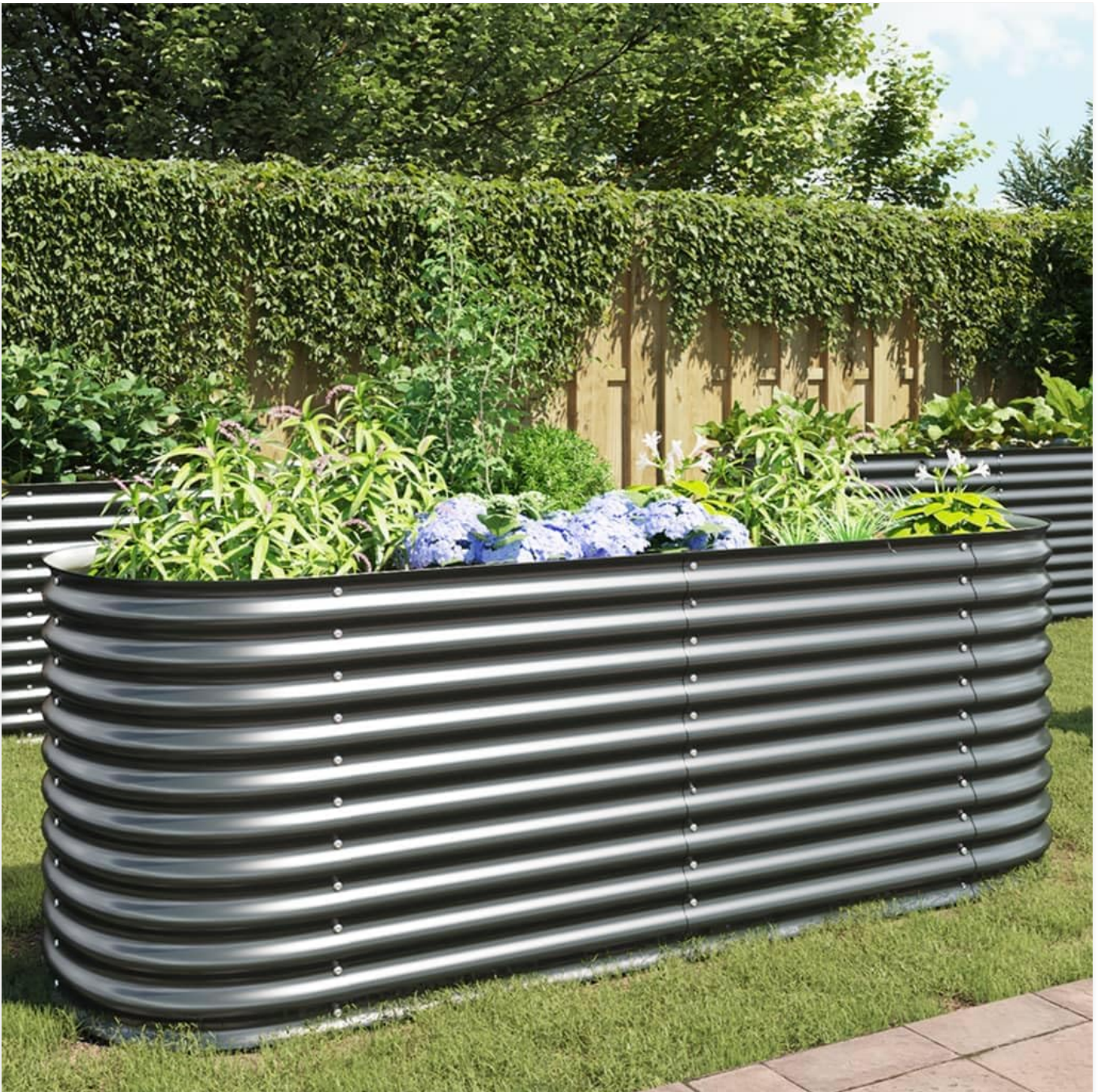
Image 1.1: The vidaXL Raised Garden Bed integrated into a garden landscape, showcasing its capacity for various plants.