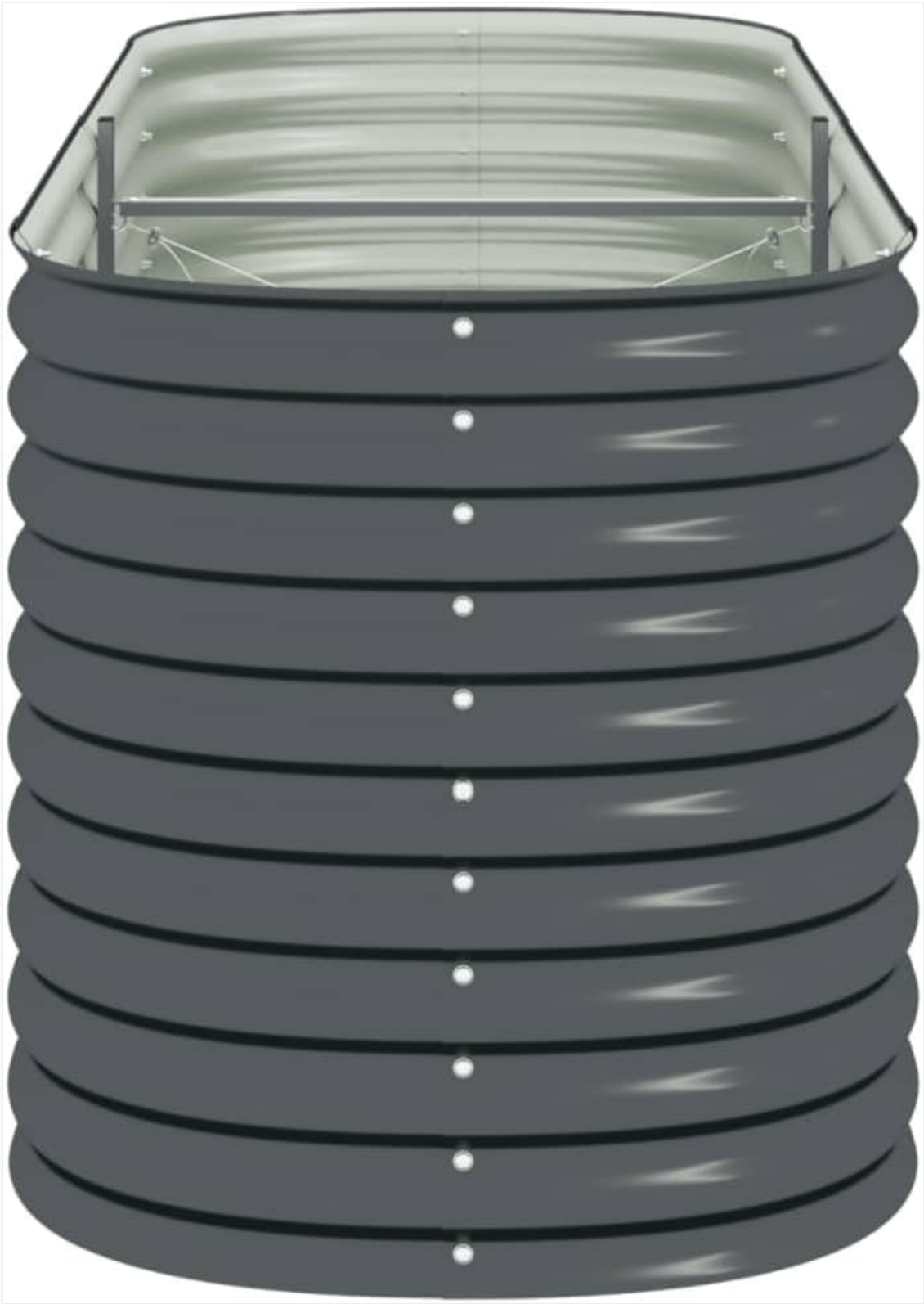
Image 4.3: Internal view highlighting the support bars for structural integrity.