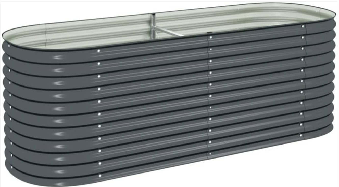
Image 4.1: Overview of the assembled garden bed, illustrating its structure.