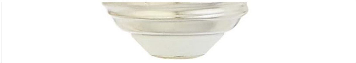
Figure 2: A close-up view of a single Amazon Basics A19 Red LED Light Bulb, highlighting its E26 base.