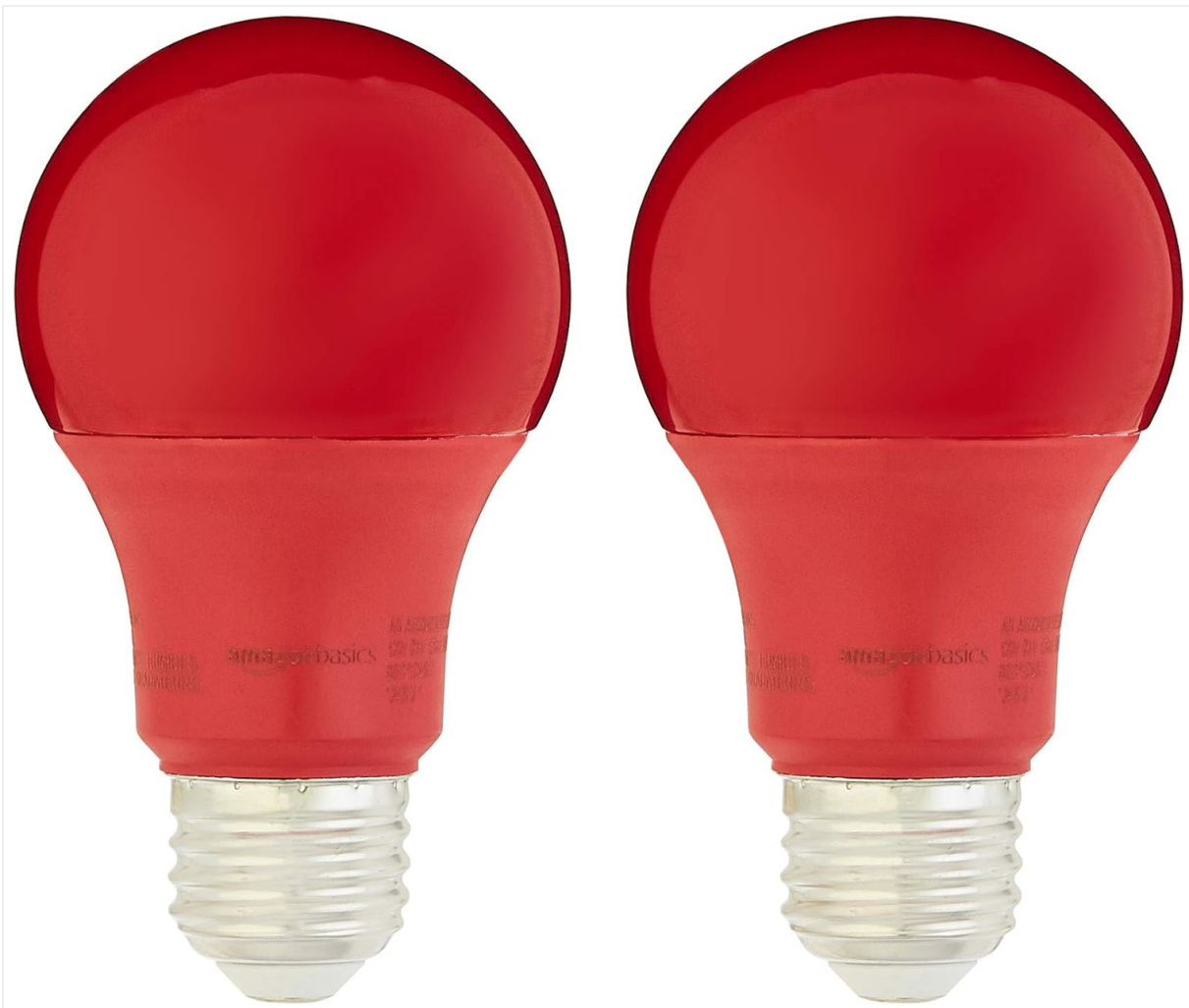
Figure 1: Two Amazon Basics A19 Red LED Light Bulbs, showcasing their distinct red color and standard base.