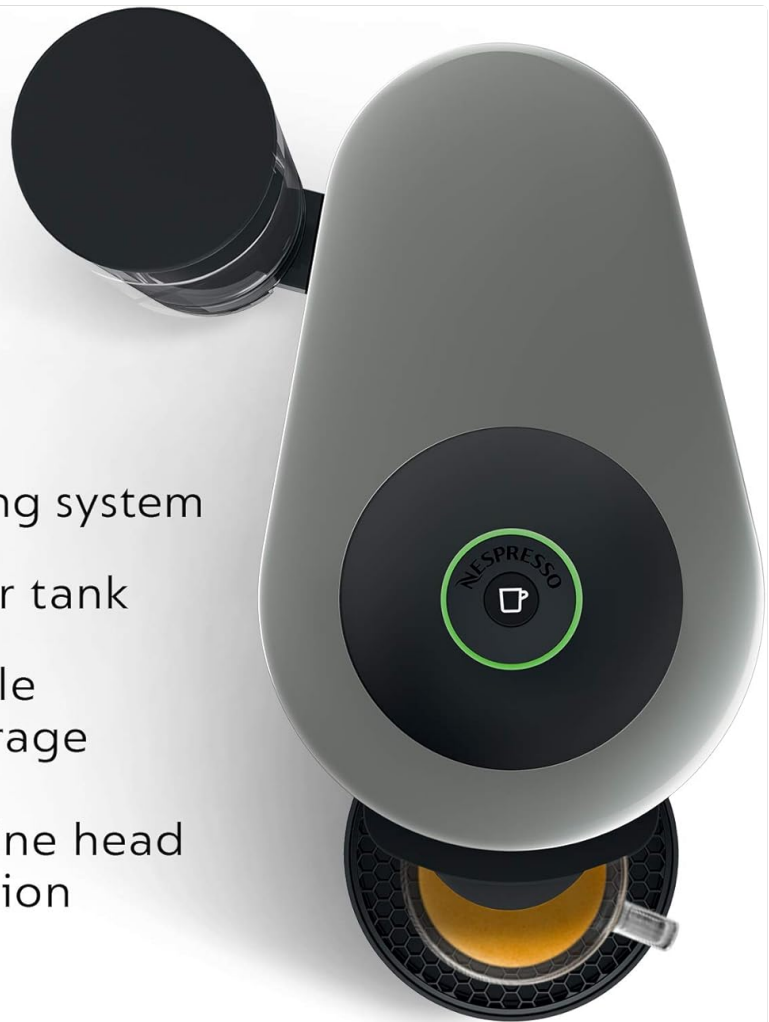
Figure 5: Machine Head Open for Capsule Insertion