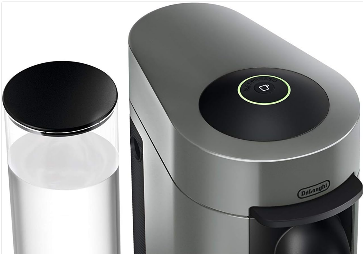
Figure 3: Water Tank and Machine Top View