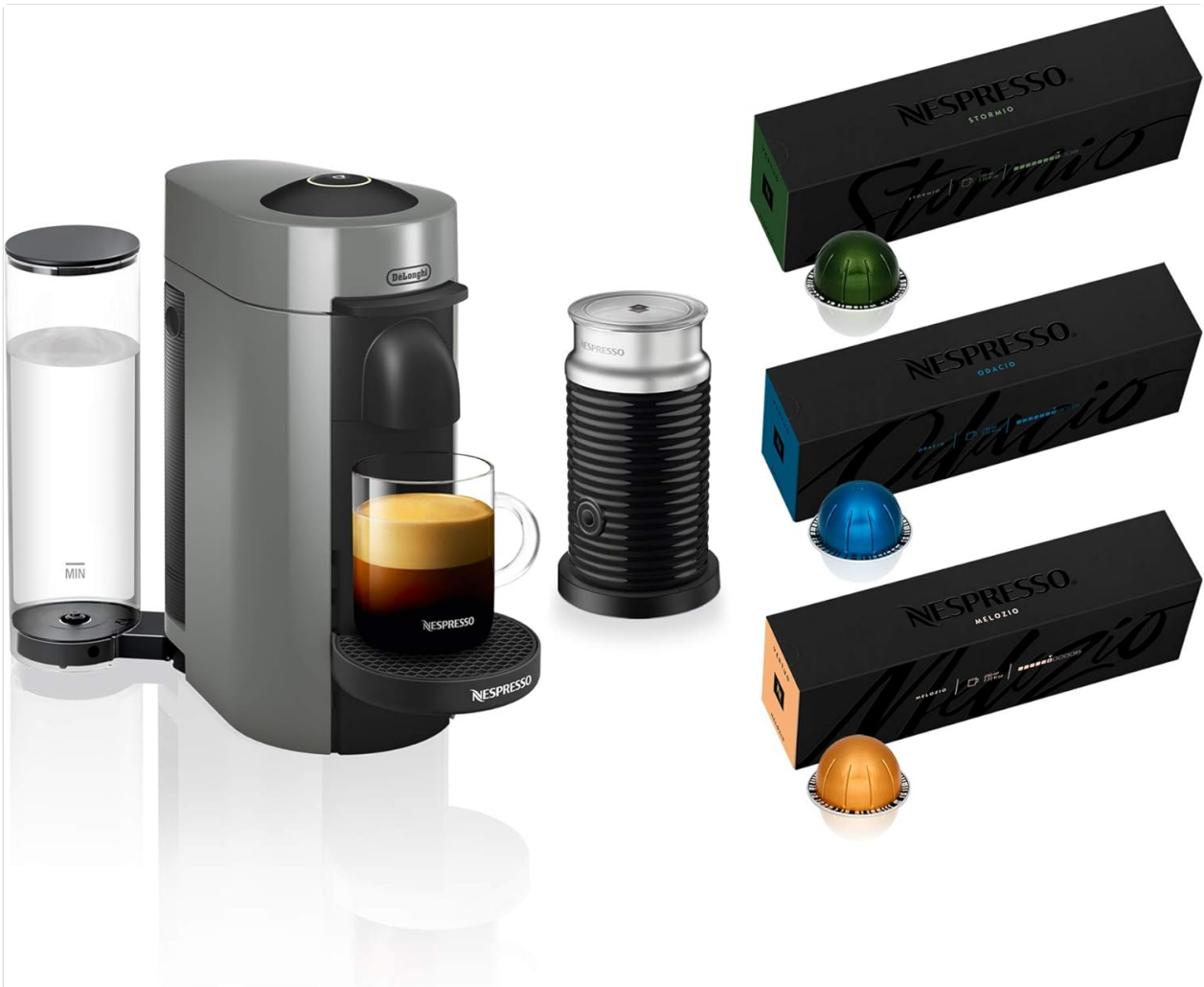
Figure 1: Nespresso VertuoPlus Machine Bundle Contents