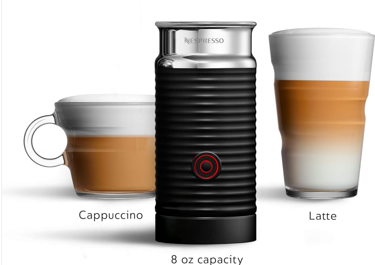
Figure 7: Aeroccino3 Milk Frother in Use

Hot/cold preparation for coffeehouse recipes