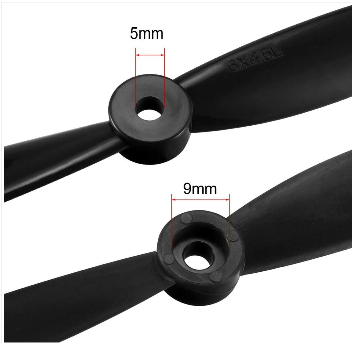
Figure 4.2: Detailed view of propeller shaft diameters, indicating 5mm and 9mm options for adapter rings.