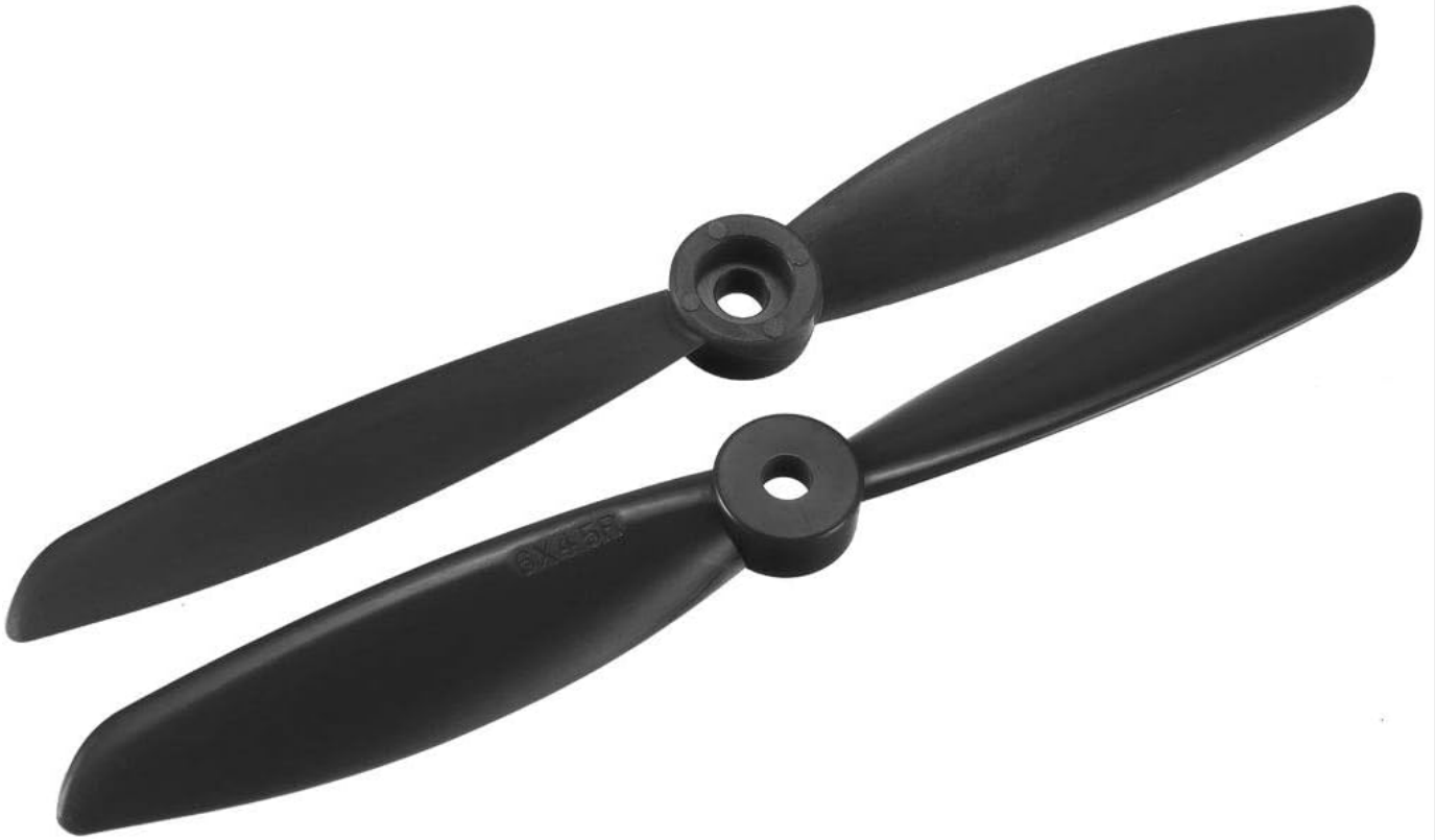
Figure 4.1: Two uxcell RC Propellers, illustrating the 6x4.5 inch size marking.