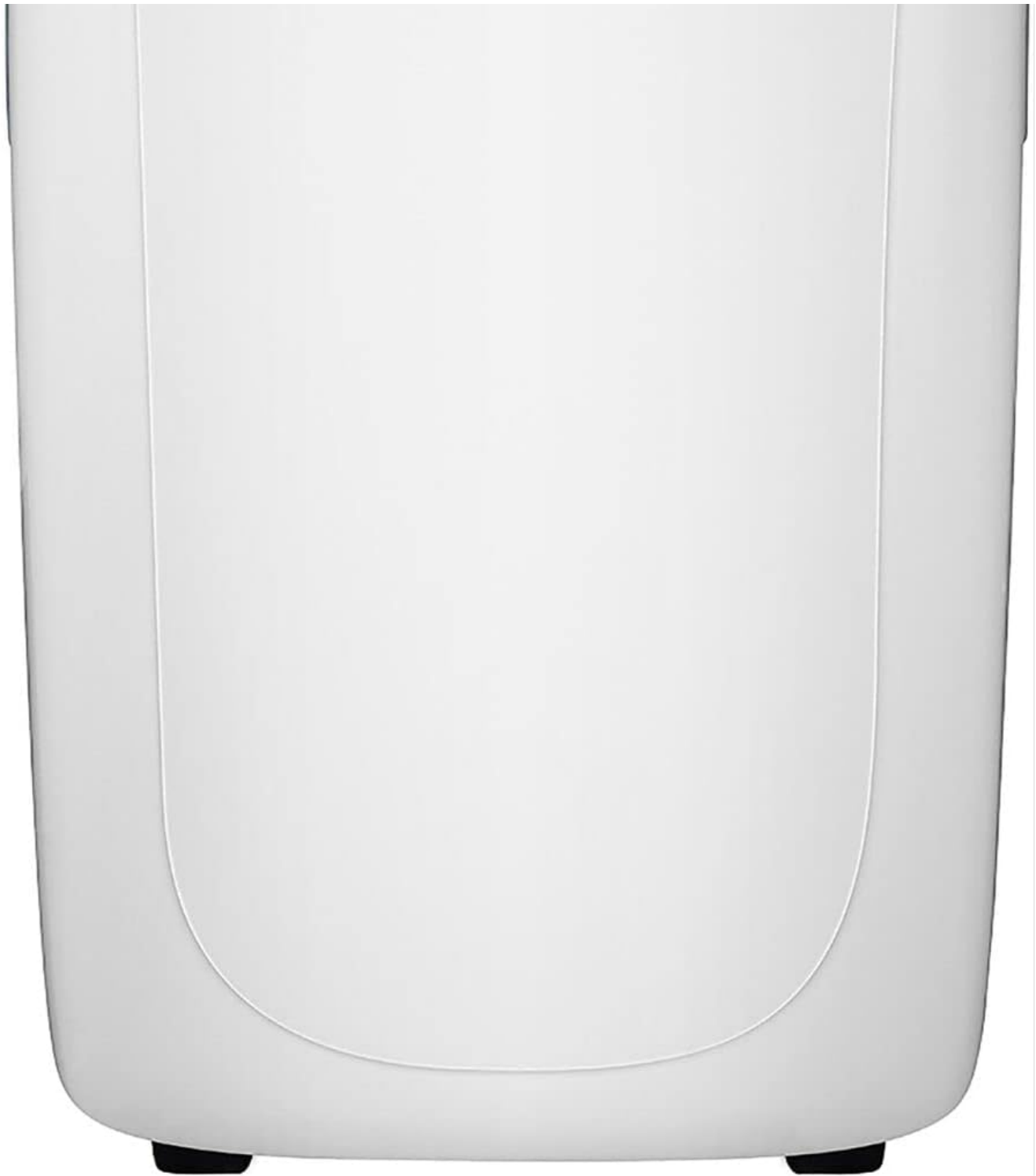
Image 1.1: Front view of the Emerson Quiet Kool EAPC12RSD1 portable air conditioner, a white rectangular unit with a control panel on top.