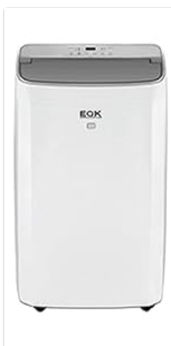
Image 6.3: Visual representation of the unit's easily programmable features, including energy savings, 24-hour timer, sleep function, and multiple operating modes (Cool, Dry, Fan).