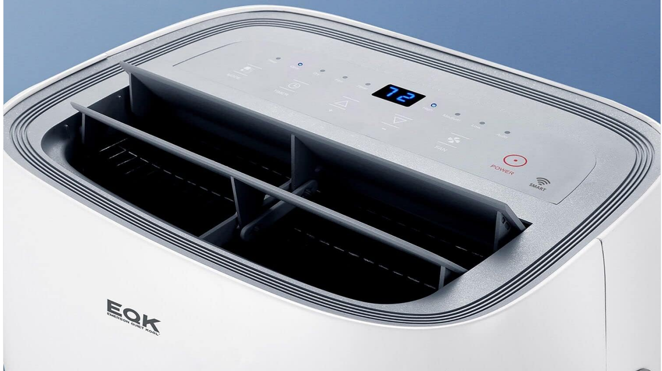
Image 6.1: Close-up of the unit's top control panel, displaying various function buttons including Sleep mode, 24 Hour Timer, Remote Control indicator, and Fan Speed settings.