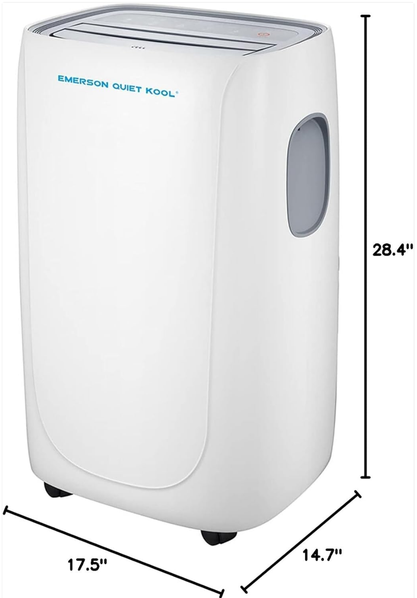
Image 9.1: Dimensional drawing of the portable air conditioner, indicating its depth (14.7"), width (17.5"), and height (28.4").