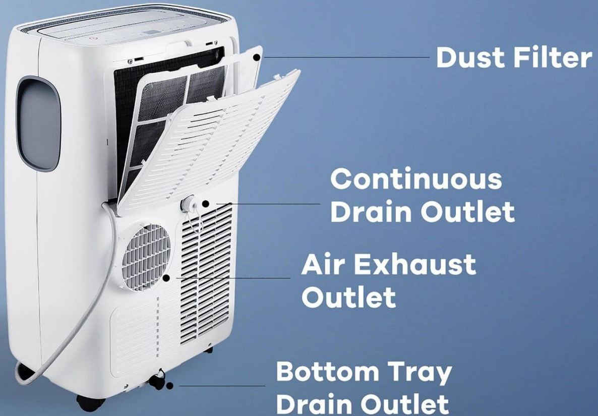
Image 4.2: Rear view of the portable air conditioner indicating the locations of the Dust Filter, Continuous Drain Outlet, Air Exhaust Outlet, and Bottom Tray Drain Outlet.