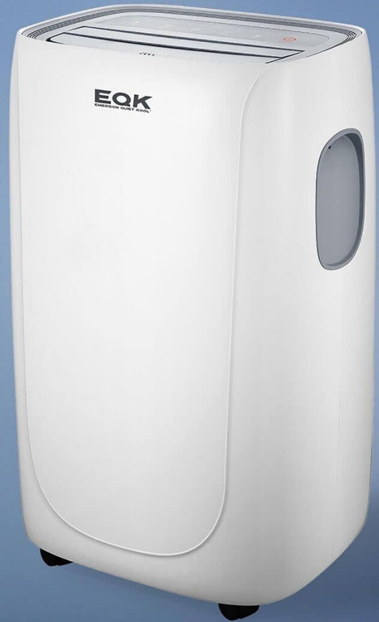
Image 4.1: Side view of the portable air conditioner highlighting key features such as the Auto Air Louver, Blue LED Digital Display, Easy To Carry Handles, and Omni-directional Casters.