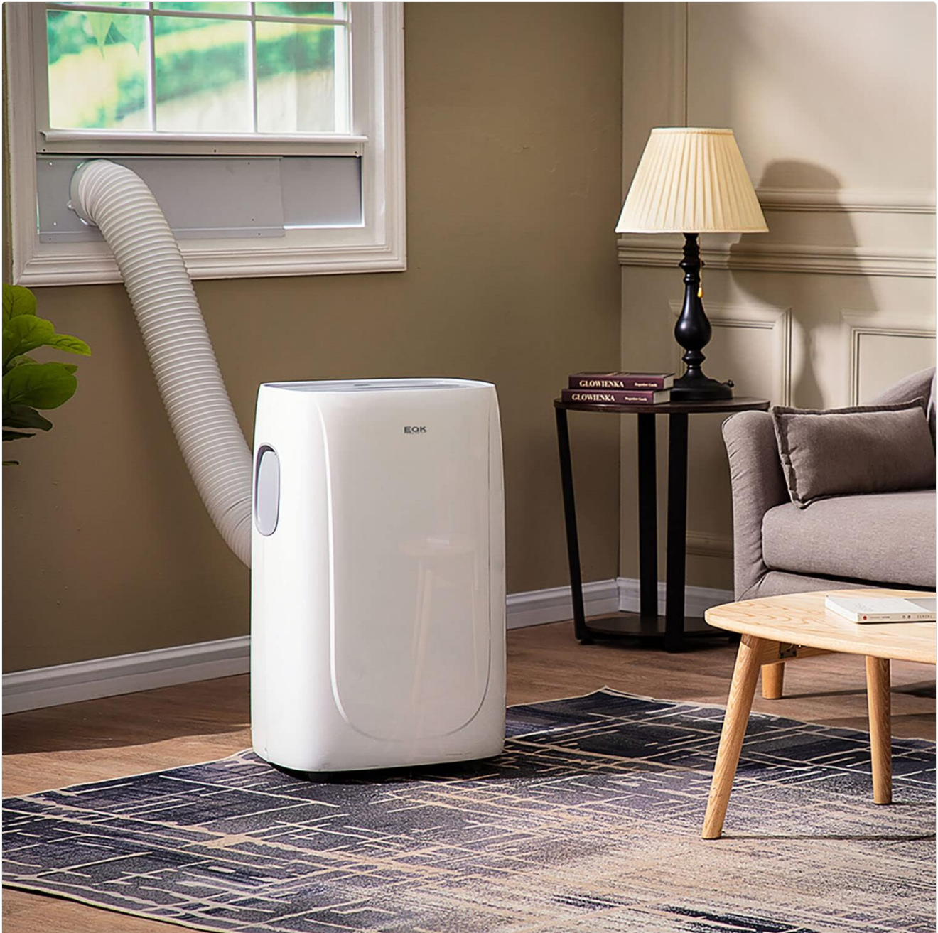
Image 5.1: The portable air conditioner unit positioned in a room with its exhaust hose properly connected to the window kit for ventilation.