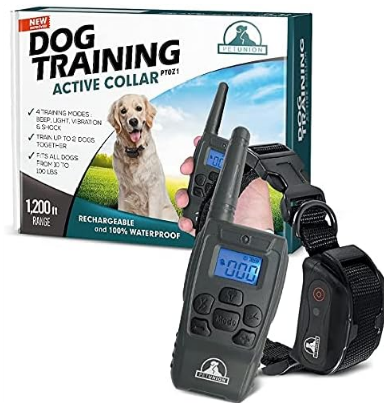
Image: The remote transmitter with its clear LCD display, allowing for easy adjustment of training levels.