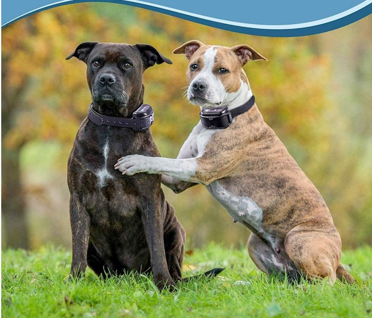
Image: The collar receiver is designed to be fully waterproof, suitable for dogs who enjoy water activities.