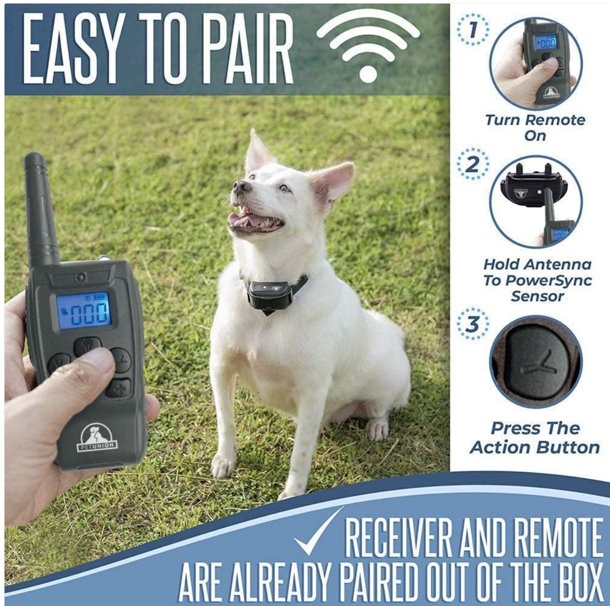
Image: Visual guide for pairing the remote and receiver. Note that the receiver and remote are usually pre-paired out of the box.