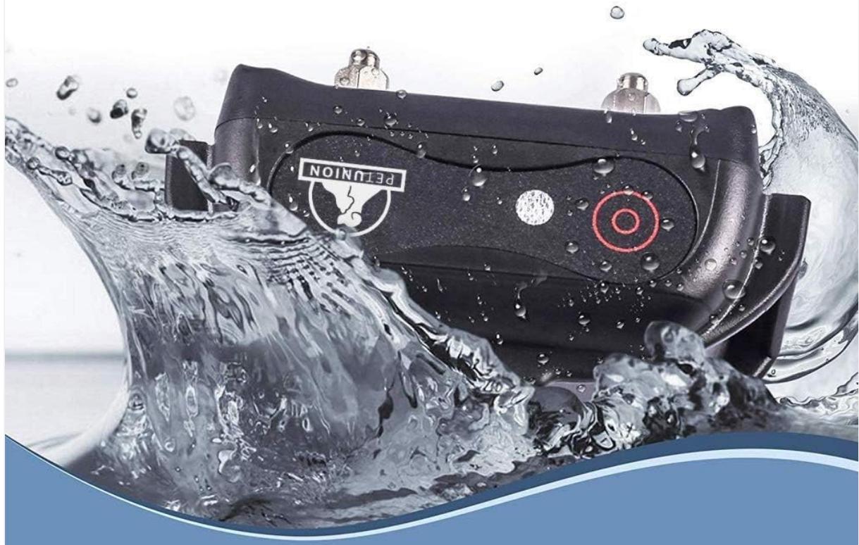
Image: The Pet Union PT0Z1 collar is designed to fit all dogs from 10 to 100 lbs, making it versatile for various breeds and sizes.