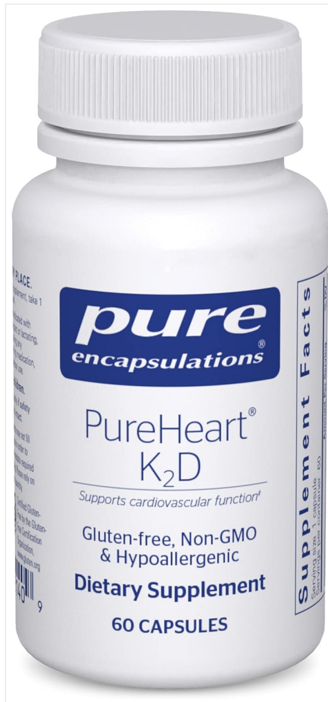
Image 1: Front view of the Pure Encapsulations PureHeart K2D supplement bottle.