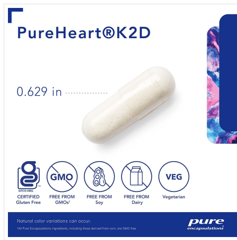
Image 3: Close-up view of a single capsule, illustrating its size and form.