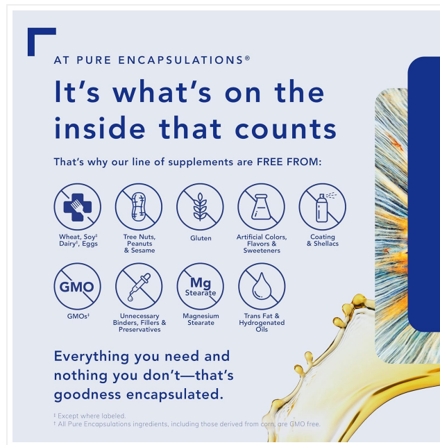
Image 4: Infographic detailing ingredients excluded from Pure Encapsulations products, such as wheat, dairy, soy, gluten, artificial colors, and GMOs.

Pure Encapsulations is committed to providing high-quality supplements. Their products are free from common allergens, artificial or unnecessary ingredients, and GMOs. They partner with TerraCycle for packaging recycling and focus on sustainable practices.