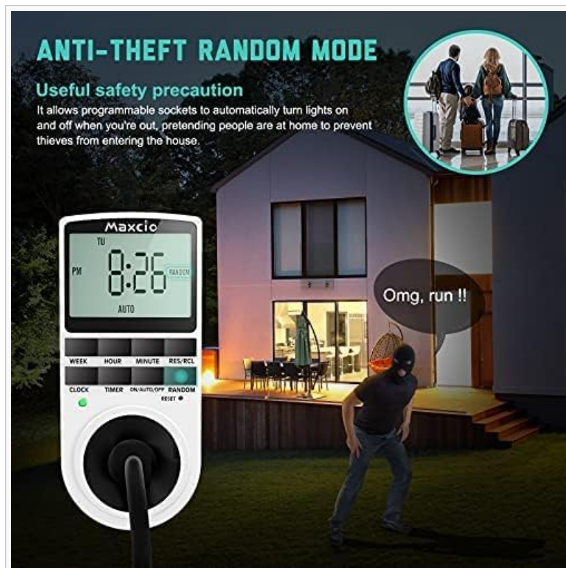
Image 7.1: The Maxcio Digital Plug Timer shown in an outdoor context, with a house in the background and a masked figure. This image visually represents the anti-theft random mode, which helps deter intruders by making it appear as though someone is home.

The random function is designed to simulate occupancy when you are away, enhancing home security. When activated, the timer will randomly turn ON and OFF the connected appliance within a specific time window.