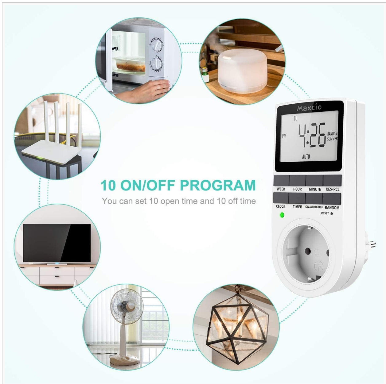
Image 6.1: The Maxcio Digital Plug Timer centrally positioned, surrounded by icons representing various household appliances such as a microwave, fan, television, and lamp. This visual demonstrates the timer's versatility and its capacity for 10 distinct ON/OFF programs to control different devices.