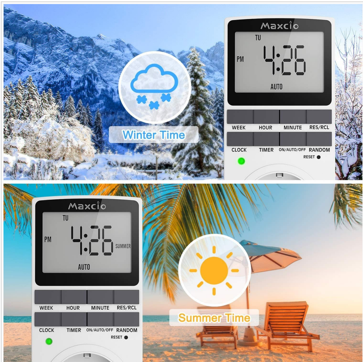
Image 5.1: The Maxcio Digital Plug Timer displaying 'SUMMER' mode, indicating the Summer Time function is active. The image also visually contrasts winter and summer scenes to illustrate the concept of daylight saving.