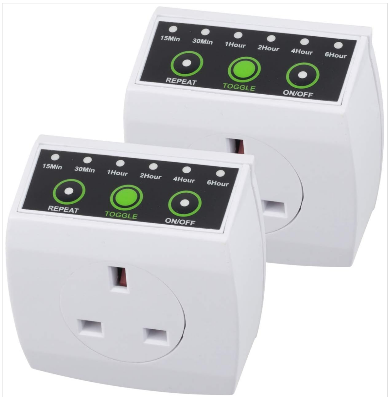
Image: Two HBN Countdown Timer Plugs, white in color, with a black control panel featuring green buttons for 'REPEAT', 'TOGGLE', and 'ON/OFF', and LED indicators for various countdown durations (15min, 30min, 1Hour, 2Hour, 4Hour, 6Hour).