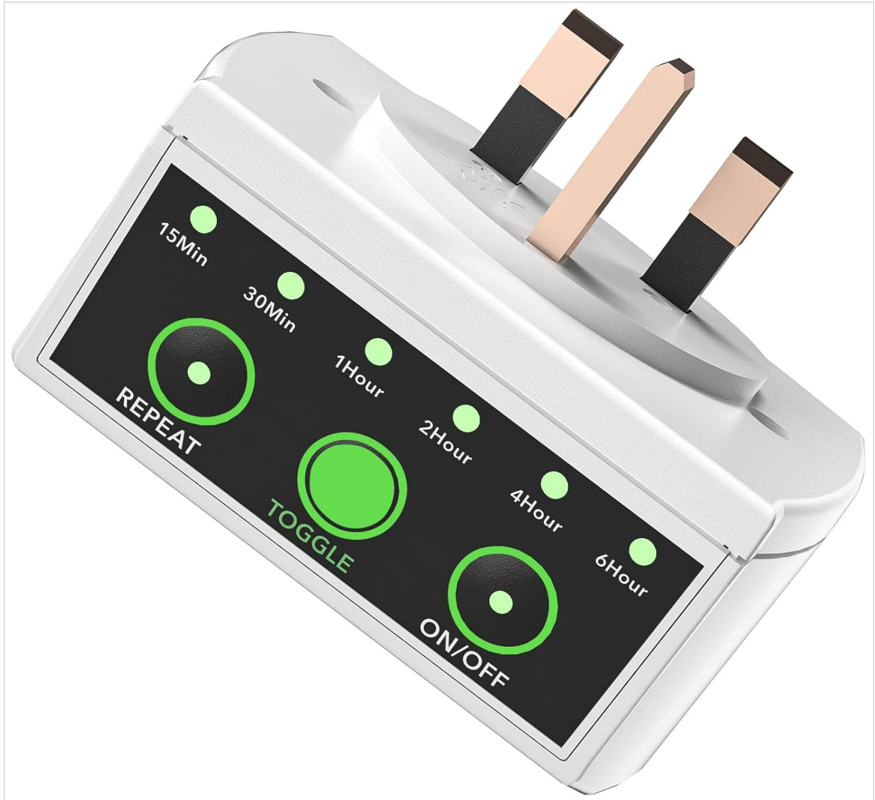
Image: An angled view of the HBN Countdown Timer Plug, clearly displaying the control panel with its 'REPEAT', 'TOGGLE', and 'ON/OFF' buttons, along with the LED indicators for various time settings.