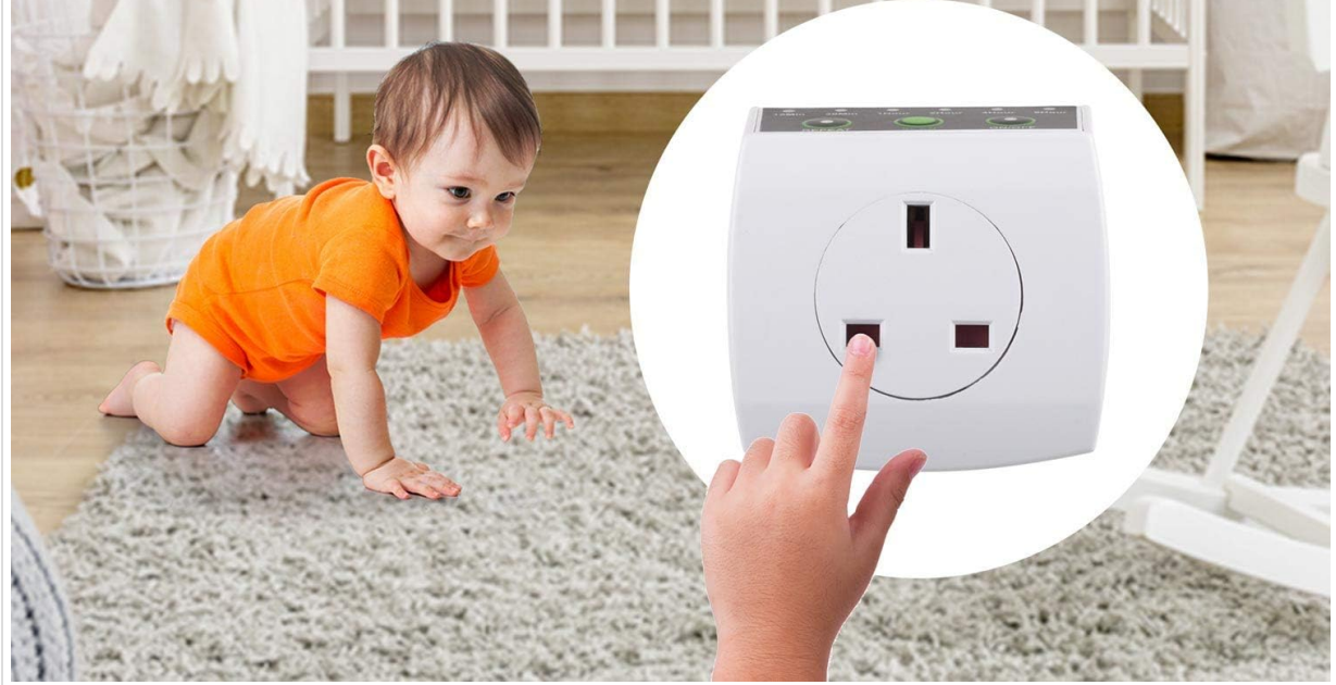
Image: The HBN Countdown Timer Plug features child safety outlet covers, indicated by a hand pointing to the covered socket openings, with a baby crawling in the background.