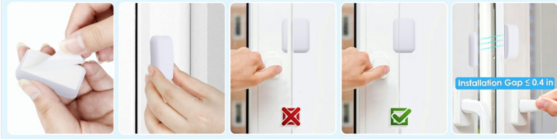
Image: A step-by-step visual guide on how to install the SanJie door chime sensor using adhesive tape, showing proper alignment and gap requirements.

Your browser does not support the video tag.