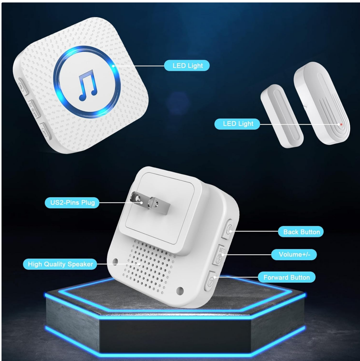
Image: Detailed view of the receiver and sensor, highlighting the LED indicators, volume controls, and chime selection buttons.

Your browser does not support the video tag.