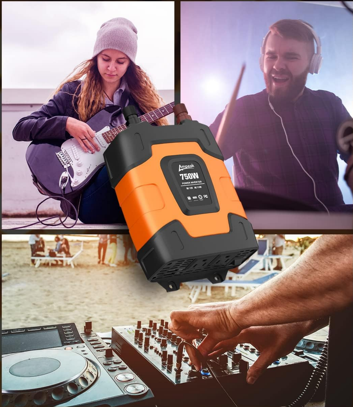
Image: The inverter providing power for sound system equipment, demonstrating its versatility.