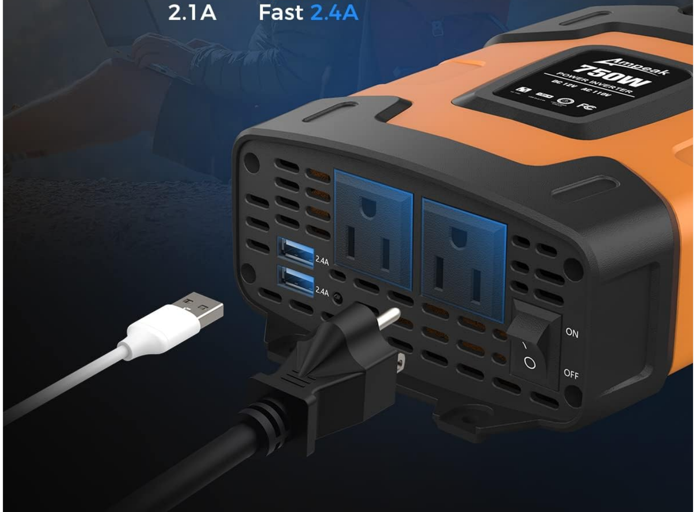
Image: Illustration of the inverter's fast charging capabilities via its dual 2.4A USB ports.