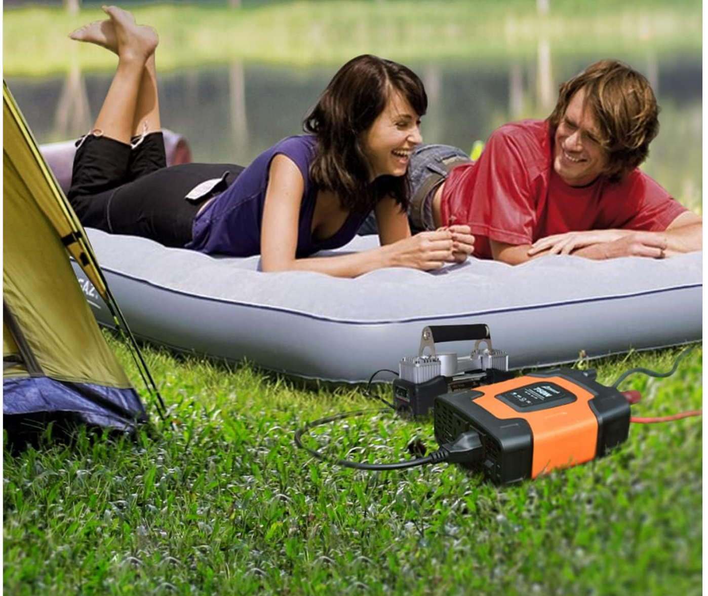
Image: The inverter being used to power an air mattress pump for outdoor activities.