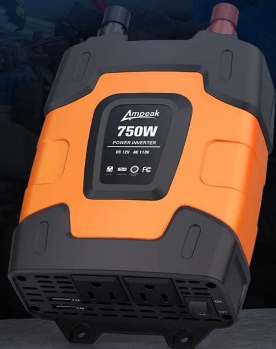
Image: Visual representation of the 11 safety protections integrated into the Ampeak 750W Power Inverter.