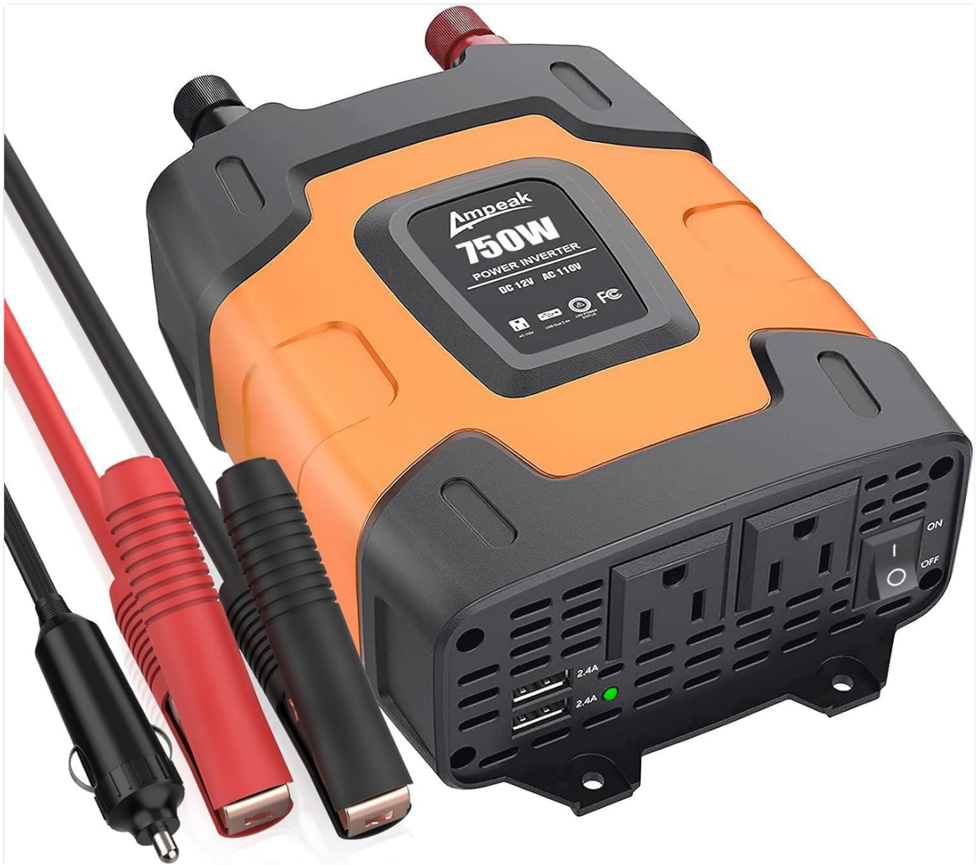
Image: Ampeak 750W Power Inverter with battery clip cables and cigarette lighter plug cable.