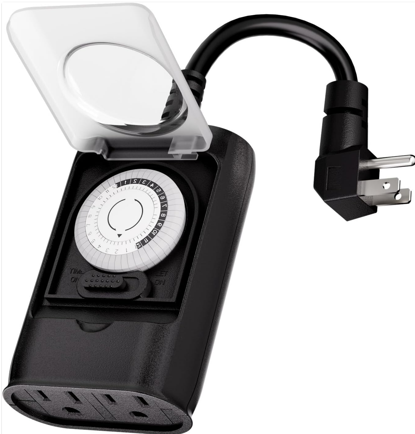
Figure 1: Front view of the K KASONIC Outdoor Light Timer Outlet, showing the mechanical dial, protective cover, and dual grounded outlets.