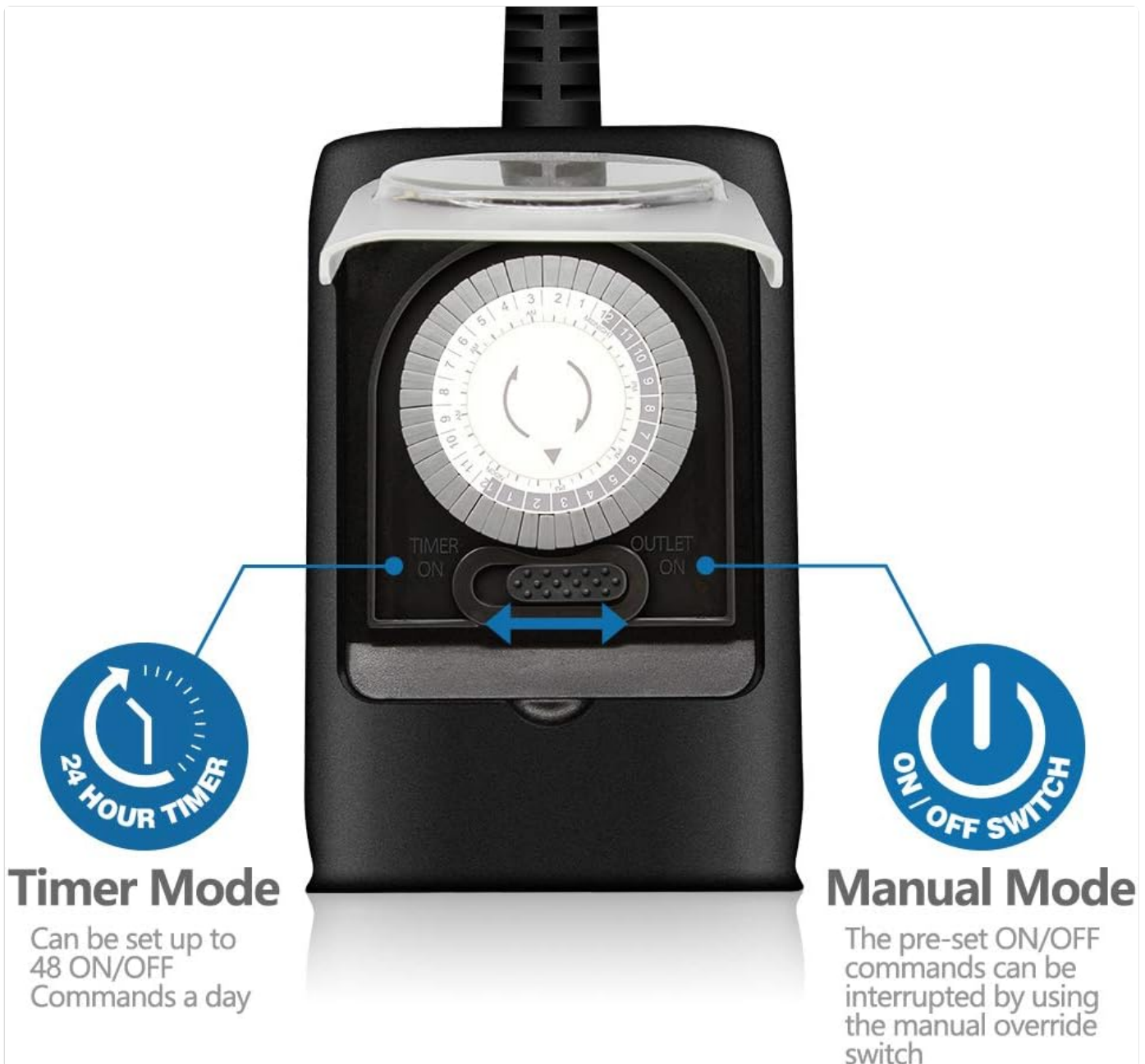
Figure 3: Illustration of the Timer Mode and Manual Mode switch, allowing for automated or continuous operation.