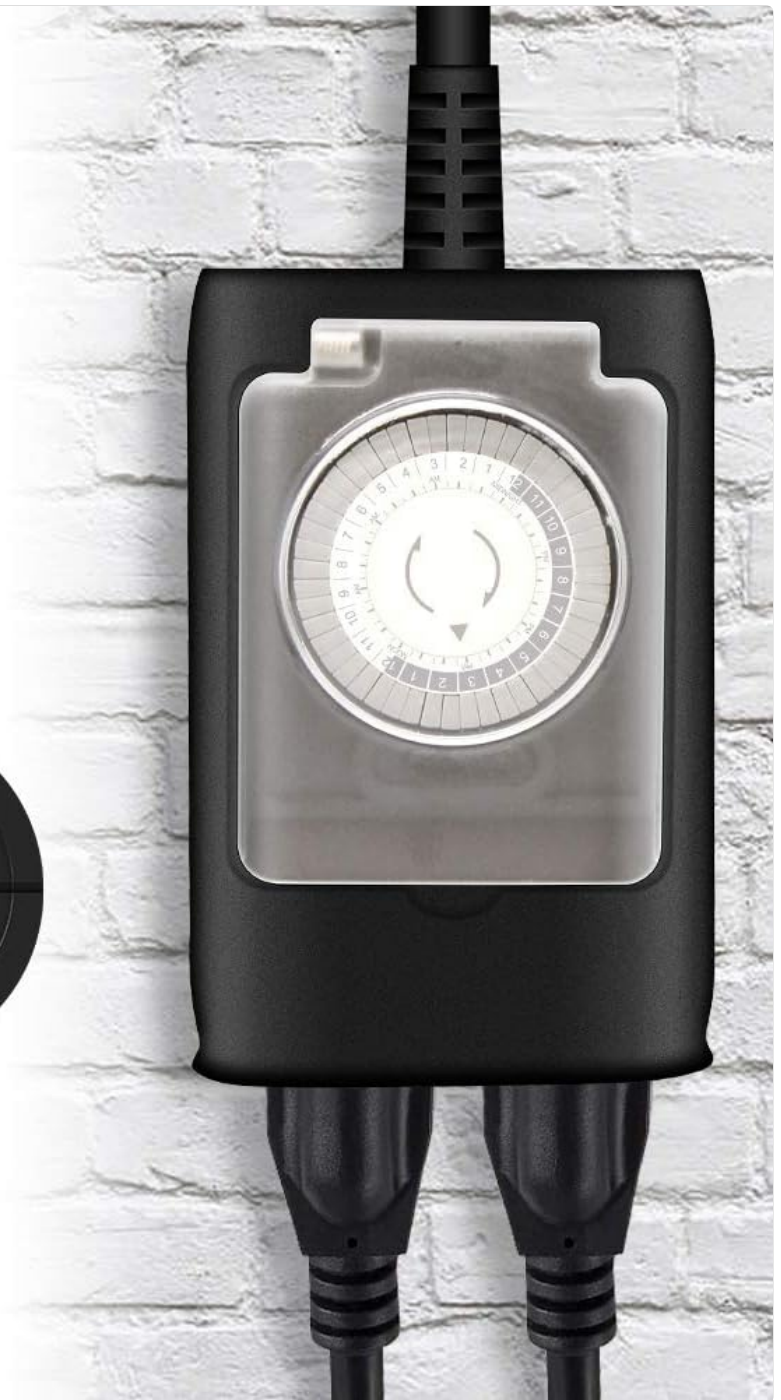
Figure 2: Close-up view of the two grounded AC outlets, doubling your available connections.