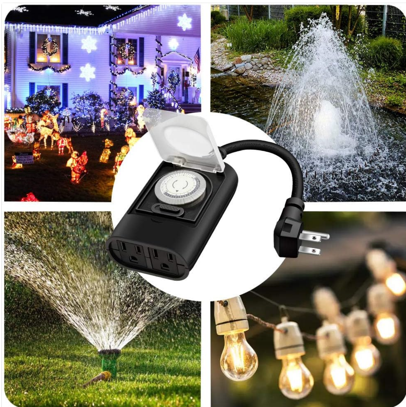
Figure 6: Examples of the timer's versatility, including use with holiday lights, garden sprinklers, and other outdoor electrical devices.