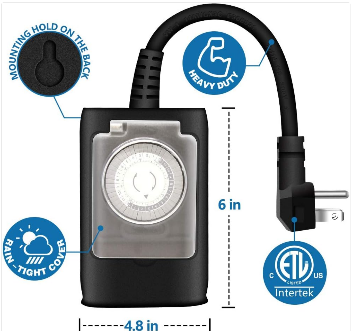
Figure 7: Overview of the timer's dimensions (6 inches H x 4.8 inches W), heavy-duty construction, rain-tight cover, mounting hold, and ETL listing.