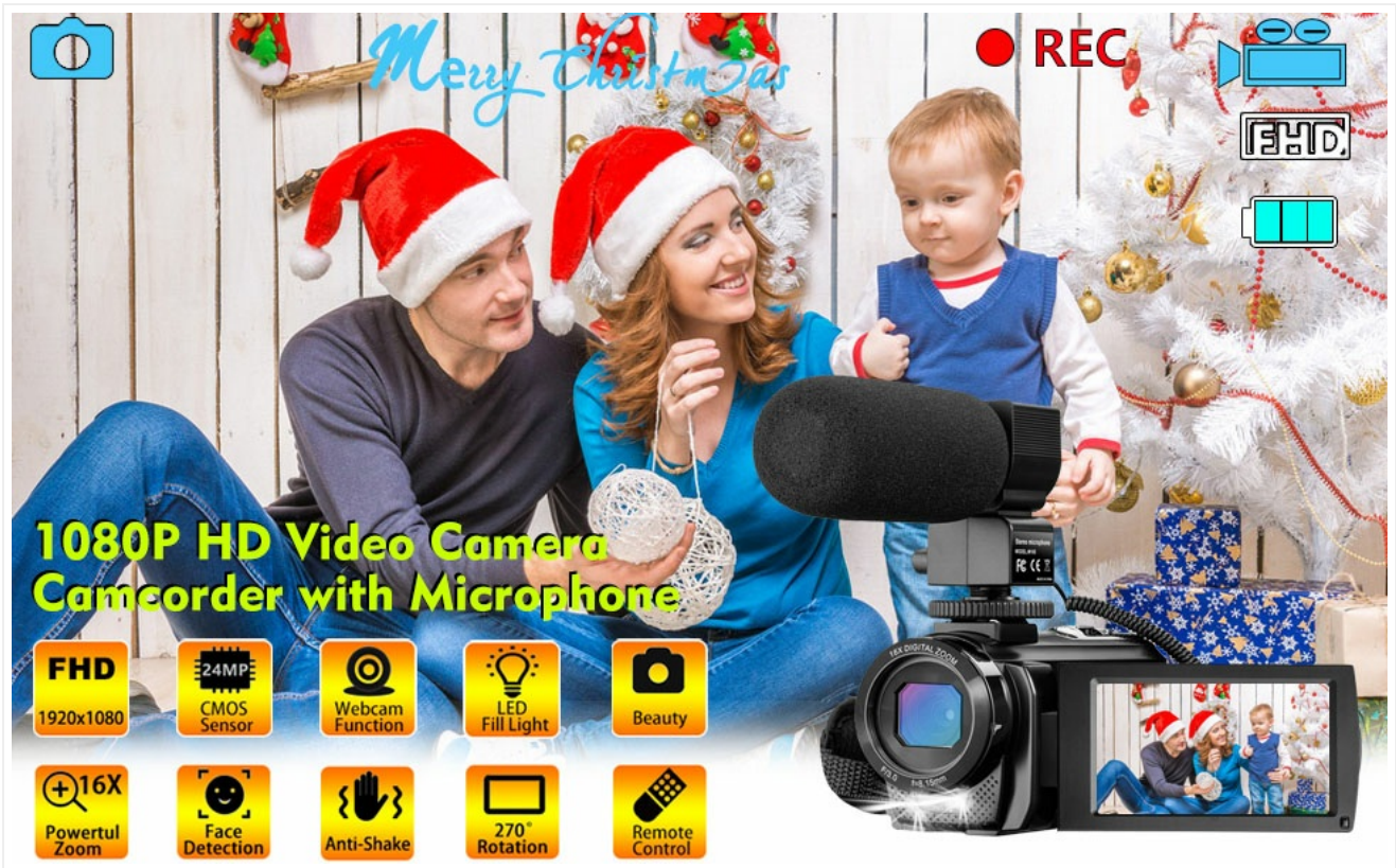
Figure 3.2: The camcorder shown with its various accessories, including the microphone, remote, and cables.