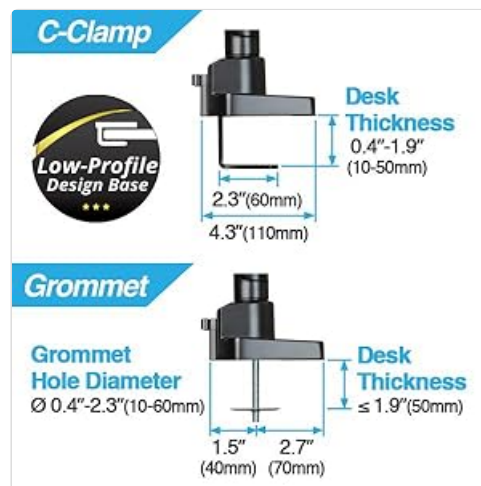
Figure 2: C-Clamp and Grommet Mounting Details