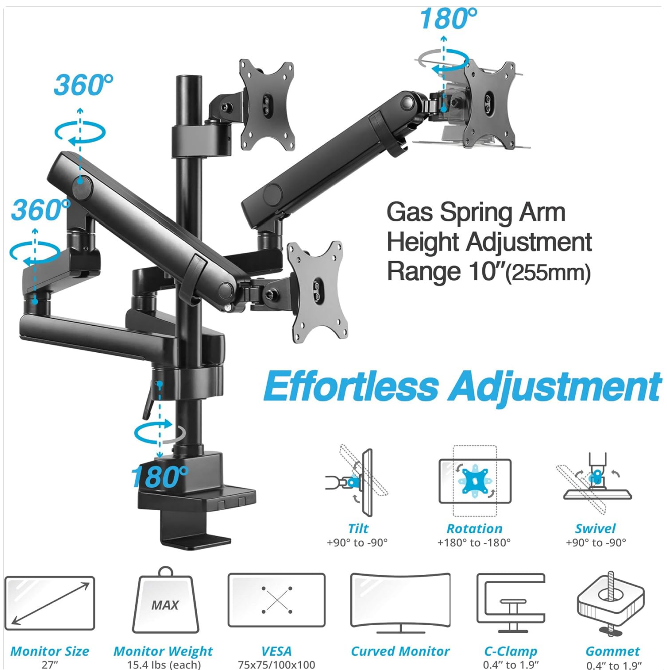
Figure 4: Effortless Adjustment Capabilities (Tilt, Rotation, Swivel)