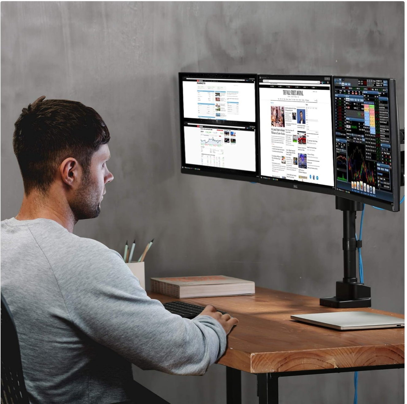
Figure 5: Example of a three-monitor setup for enhanced productivity.