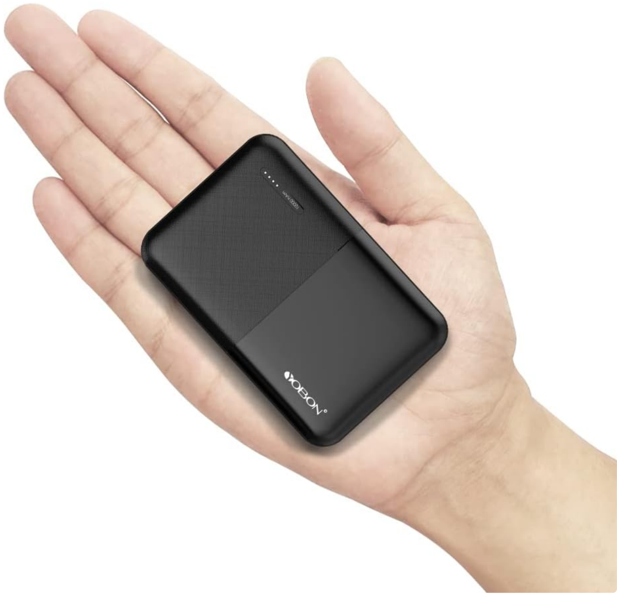
Figure 1: YOBON 10000mAh Power Bank

This manual provides essential information on how to set up, operate, maintain, and troubleshoot your power bank to ensure optimal performance and longevity.