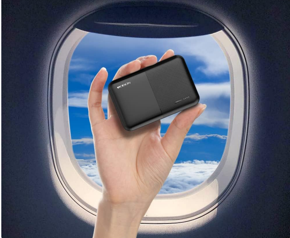
Figure 3: Portability for Travel