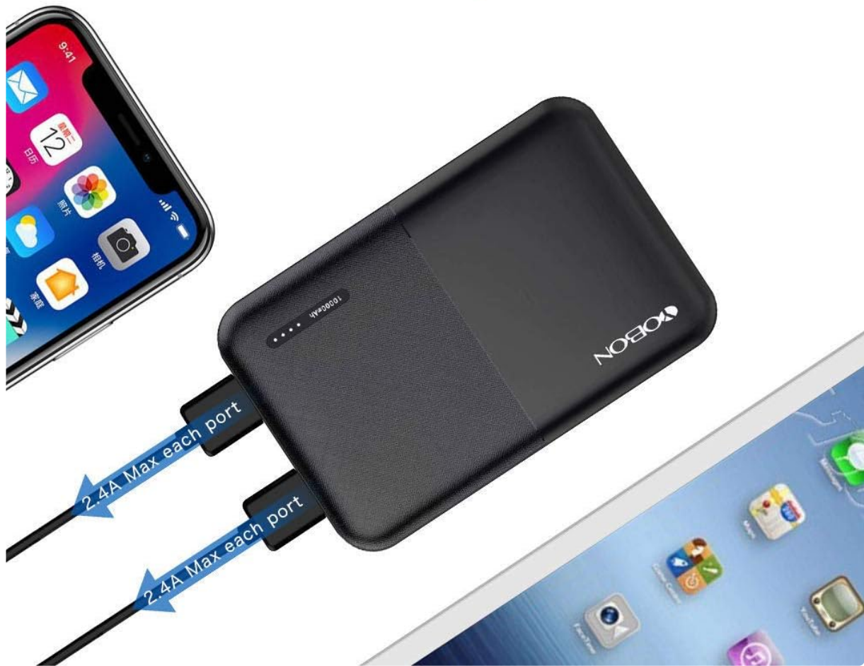
Figure 4: Dual Device Charging