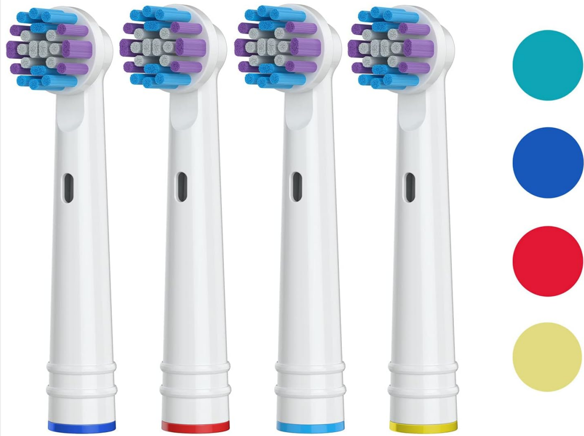
Image: Multi-color rings for brush head distinction.