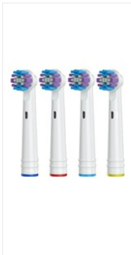
Image: Reminder bristles indicating when to replace the brush head.

For multi-user households, the brush heads come with multi-colored rings for easy identification, ensuring each user uses their designated brush head.