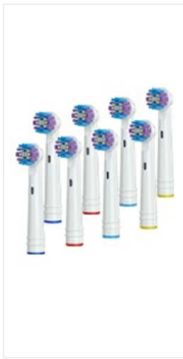
Image: Brush head in action, showing deep cleaning.