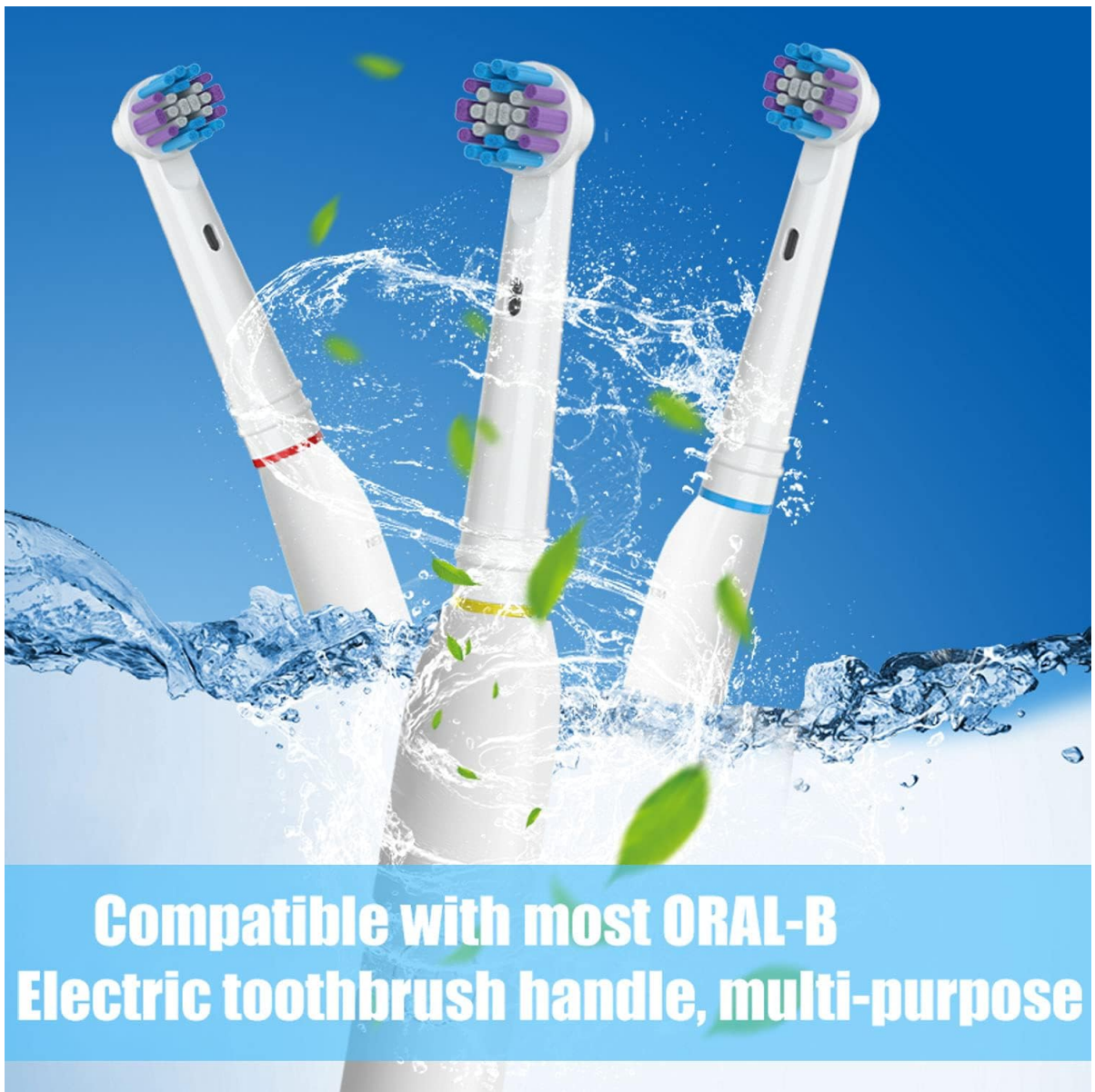
Image: Maillink replacement toothbrush heads, compatible with most Oral-B electric toothbrush handles.