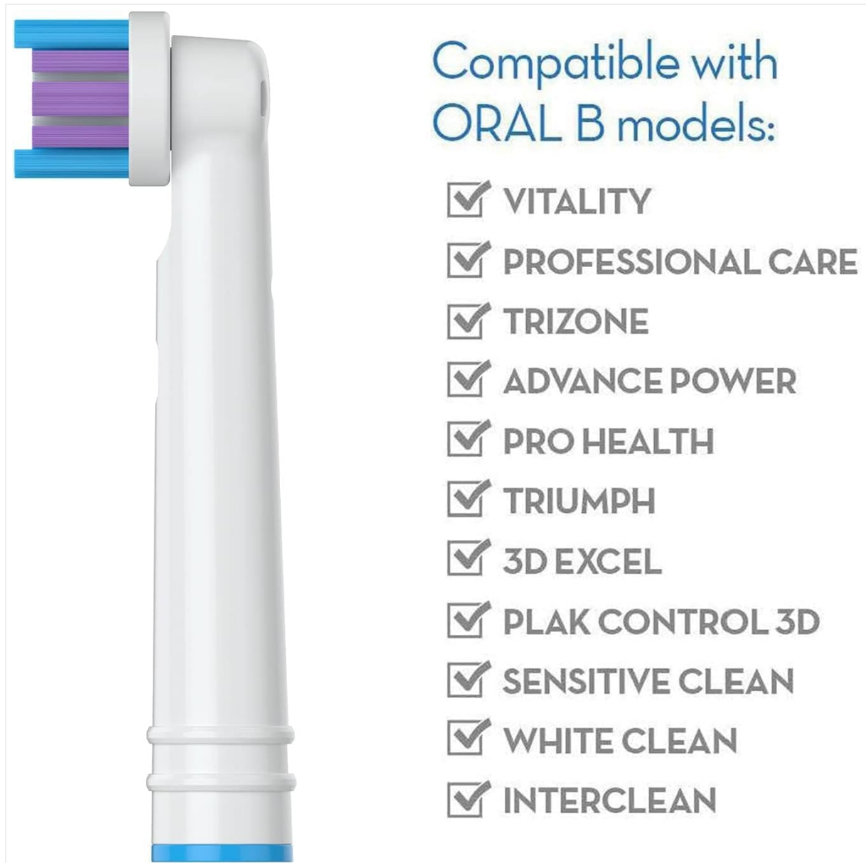
Image: Compatible Oral-B electric toothbrush models.

Mailink replacement heads are compatible with most Oral-B electric toothbrush bases, including ORAL B PRO, GENIUS, and SMART SERIES. They are not compatible with Oral-B Pulsonic models.