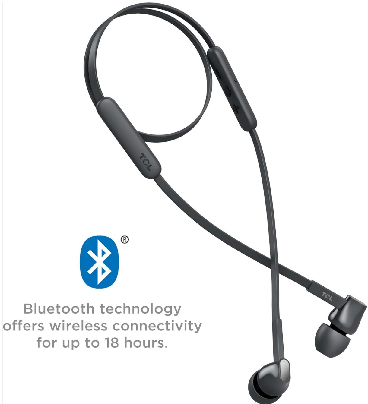
Image: The TCL MTRO100BT wireless earbuds, highlighting their Bluetooth connectivity and neckband design.