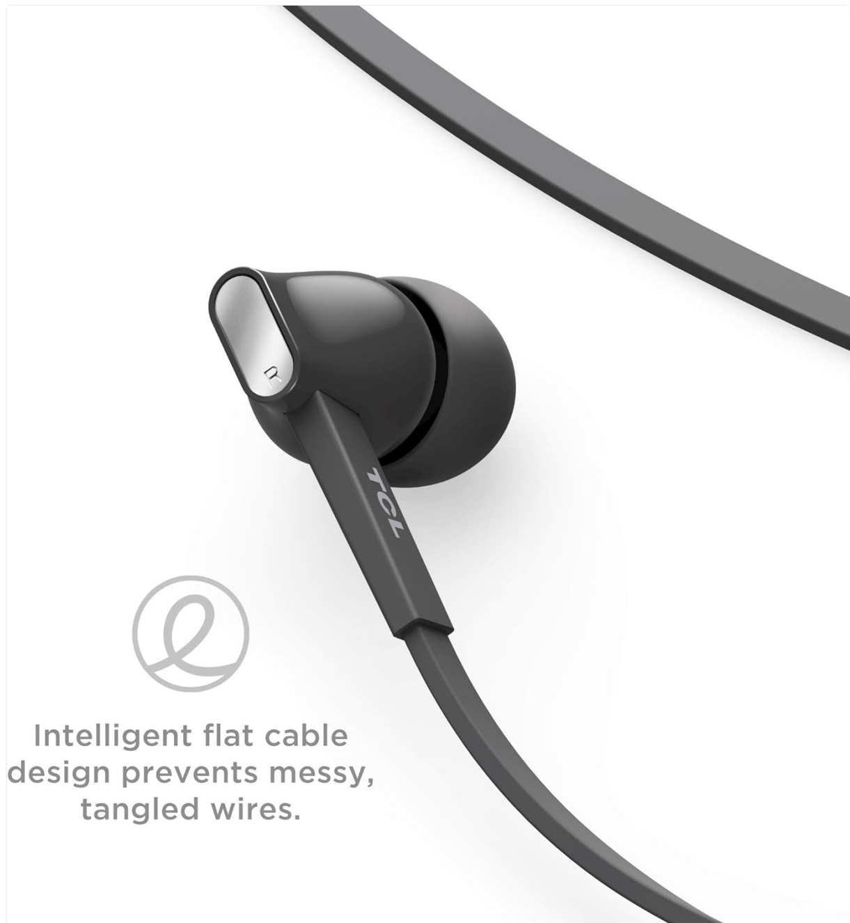
Image: Front view of the TCL MTRO100BT earbuds, showcasing their sleek design.