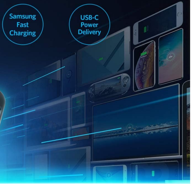
Image: An iPhone being charged by the Anker PowerPort Atom III Slim, highlighting its fast charging capabilities compared to standard chargers for various devices.