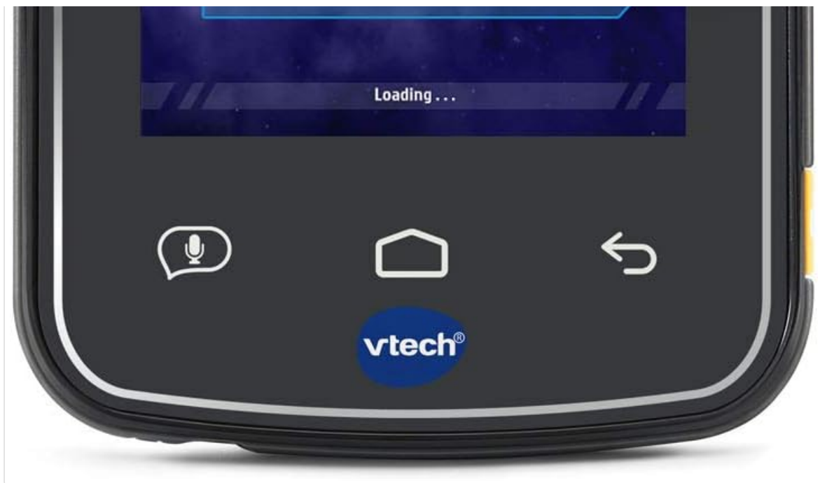
Image: The VTech KidiBuzz G2 device showing the 'Creature Detective' game, an augmented reality experience where a cartoon creature is overlaid on a real-world background.