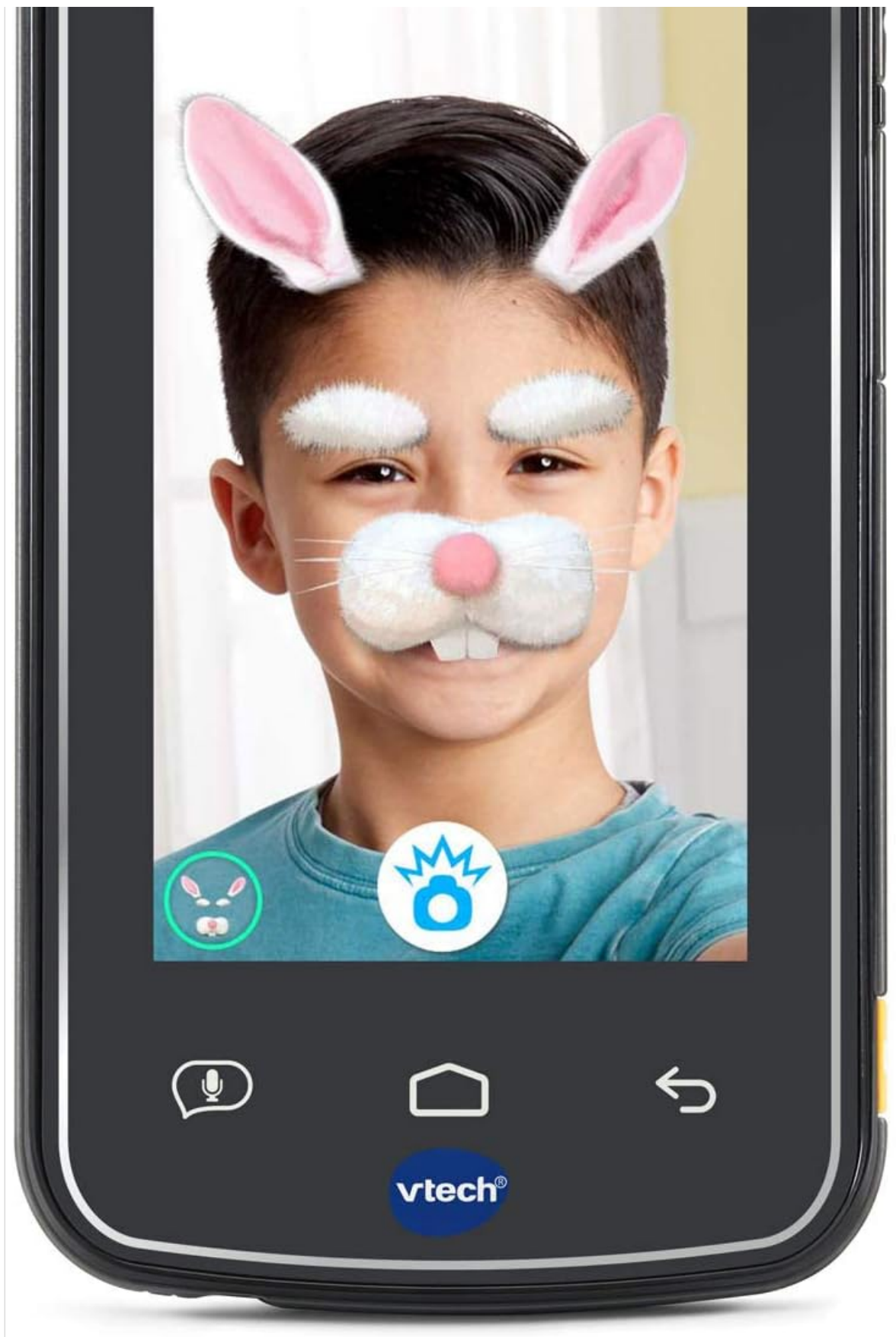
Image: The VTech KidiBuzz G2 device displaying a child's face with an interactive bunny filter from the Wonder Masks app.